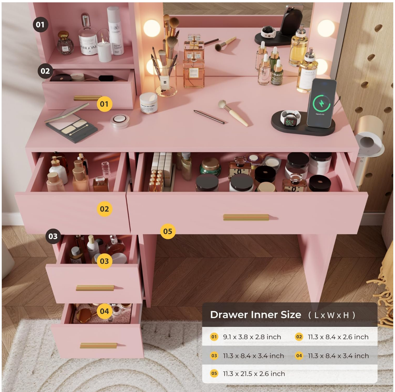
Figure 5: Drawer Inner Sizes.