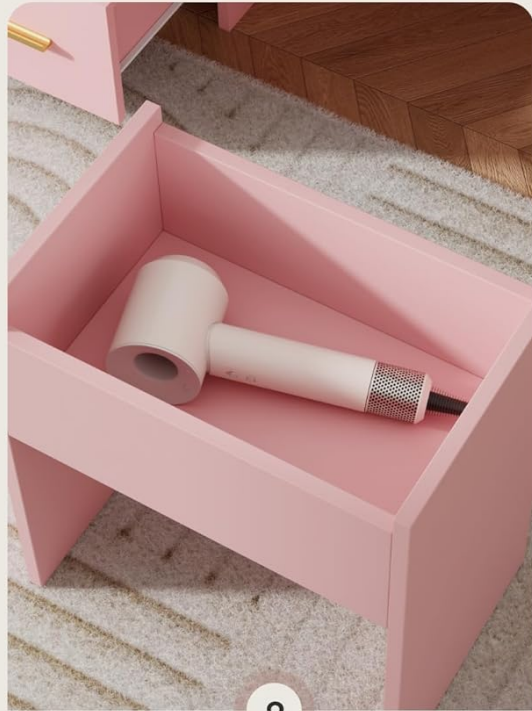
Desktop Drawer & Metal Handle