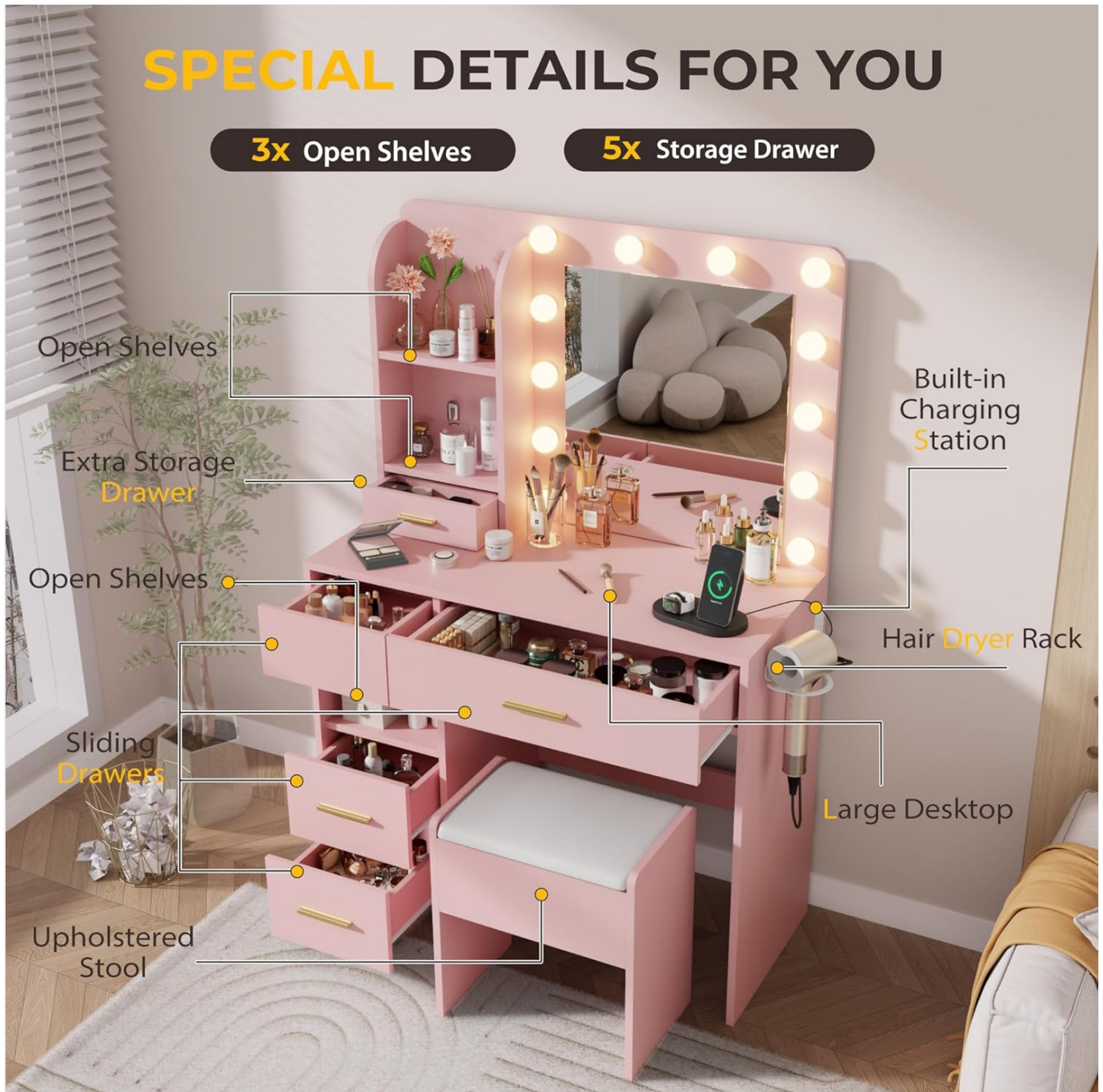
Figure 1: Exploded view of vanity desk components and features.