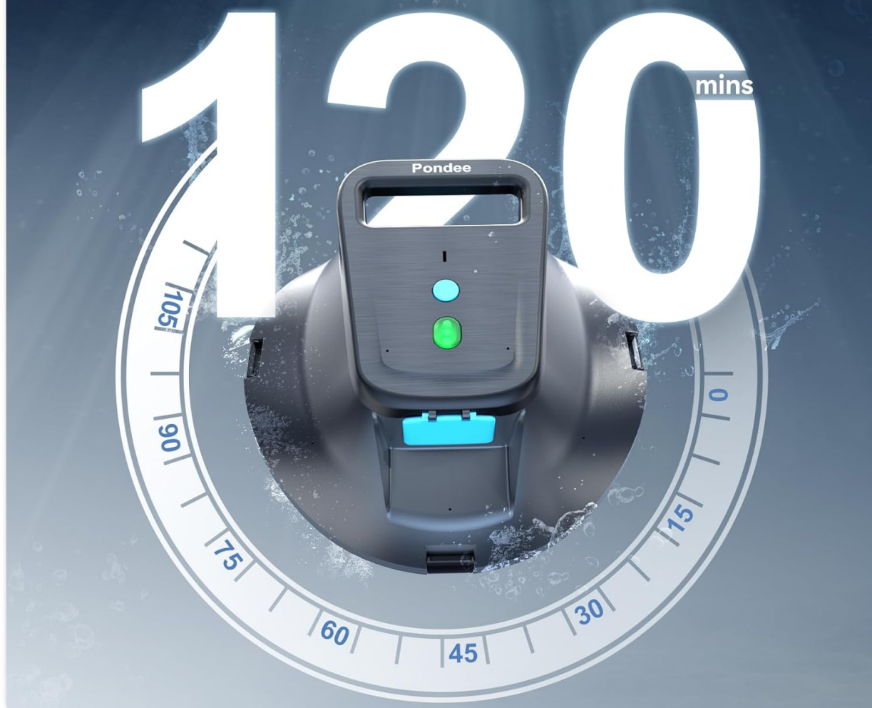
Figure 3: One-Click Operation

Enjoy uninterrupted cleaning for each cleaning session