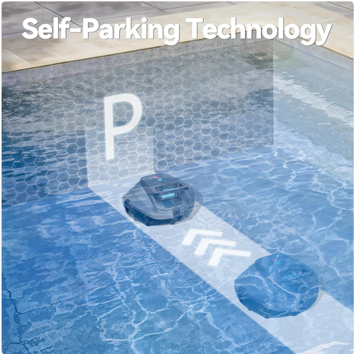
Figure 4: Self-Parking Feature