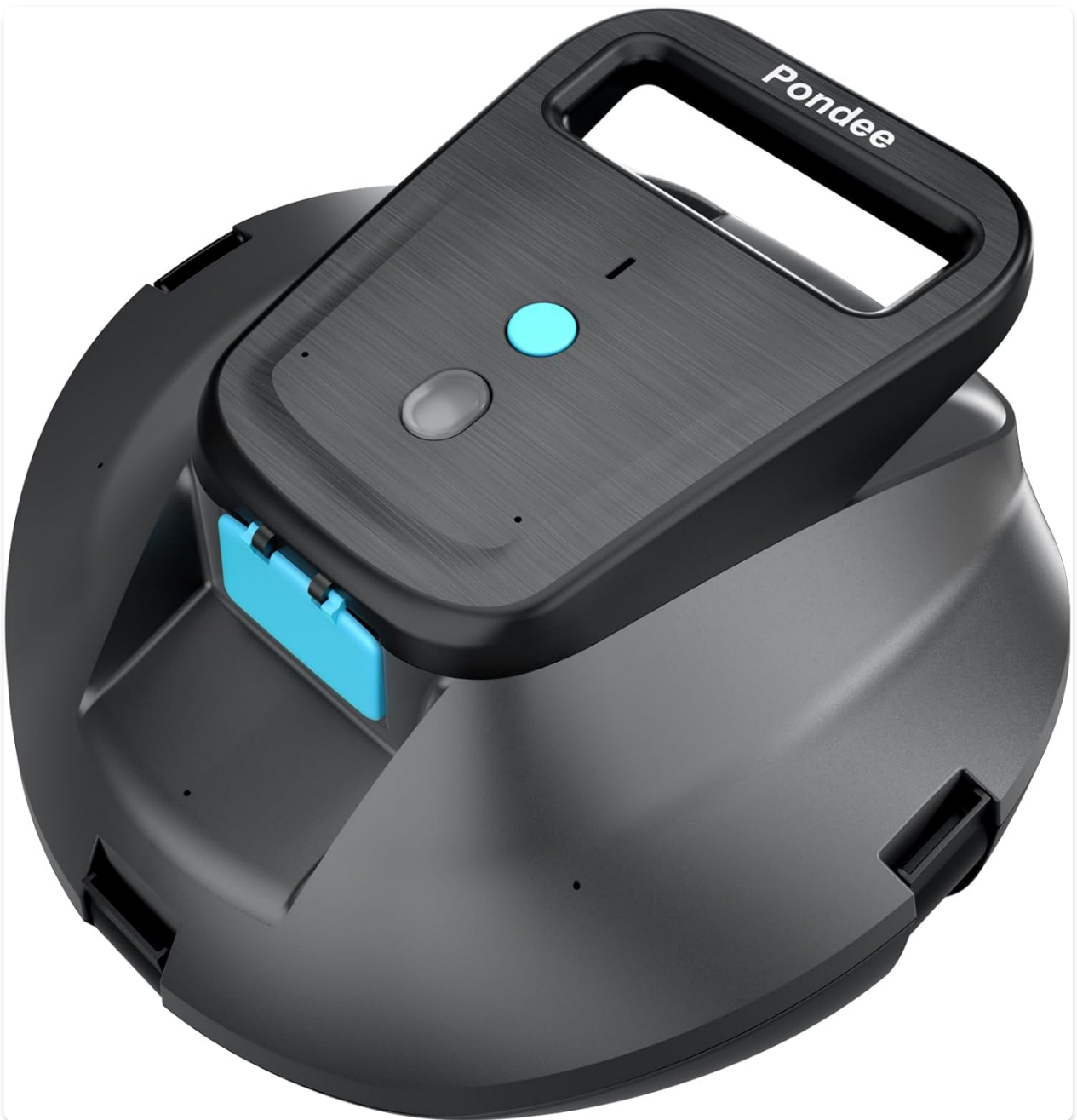
Figure 1: Pondee X1 Robotic Pool Vacuum

This robotic cleaner features precision-engineered dual motors, dual suction ports, and brushes to power through dirt, debris, leaves, sand, and even small stones. Its hydrodynamic design and advanced filtration system contribute to powerful and efficient cleaning while reducing energy consumption.