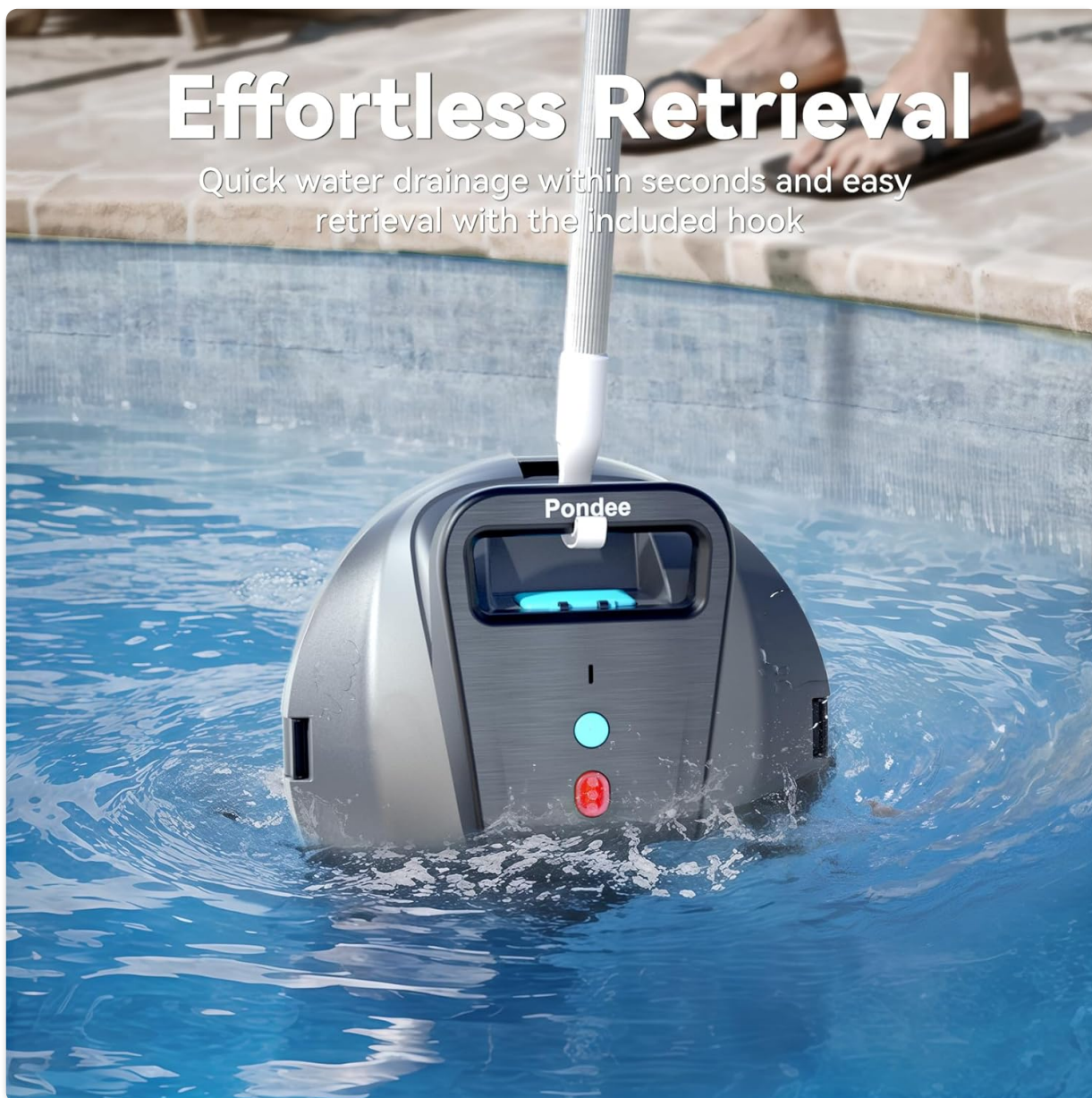
Figure 5: Easy Retrieval with Hook

Quick water drainage within seconds and easy retrieval with the included hook