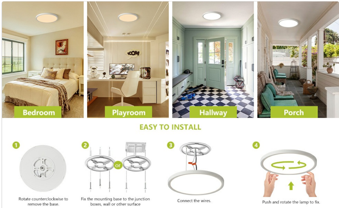
Image: A visual guide to the four-step installation process, from detaching the base to securing the light fixture.