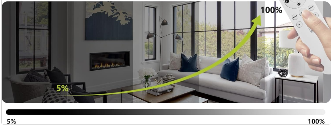
Image: Illustrates the selectable color temperatures and the remote's brightness adjustment range.