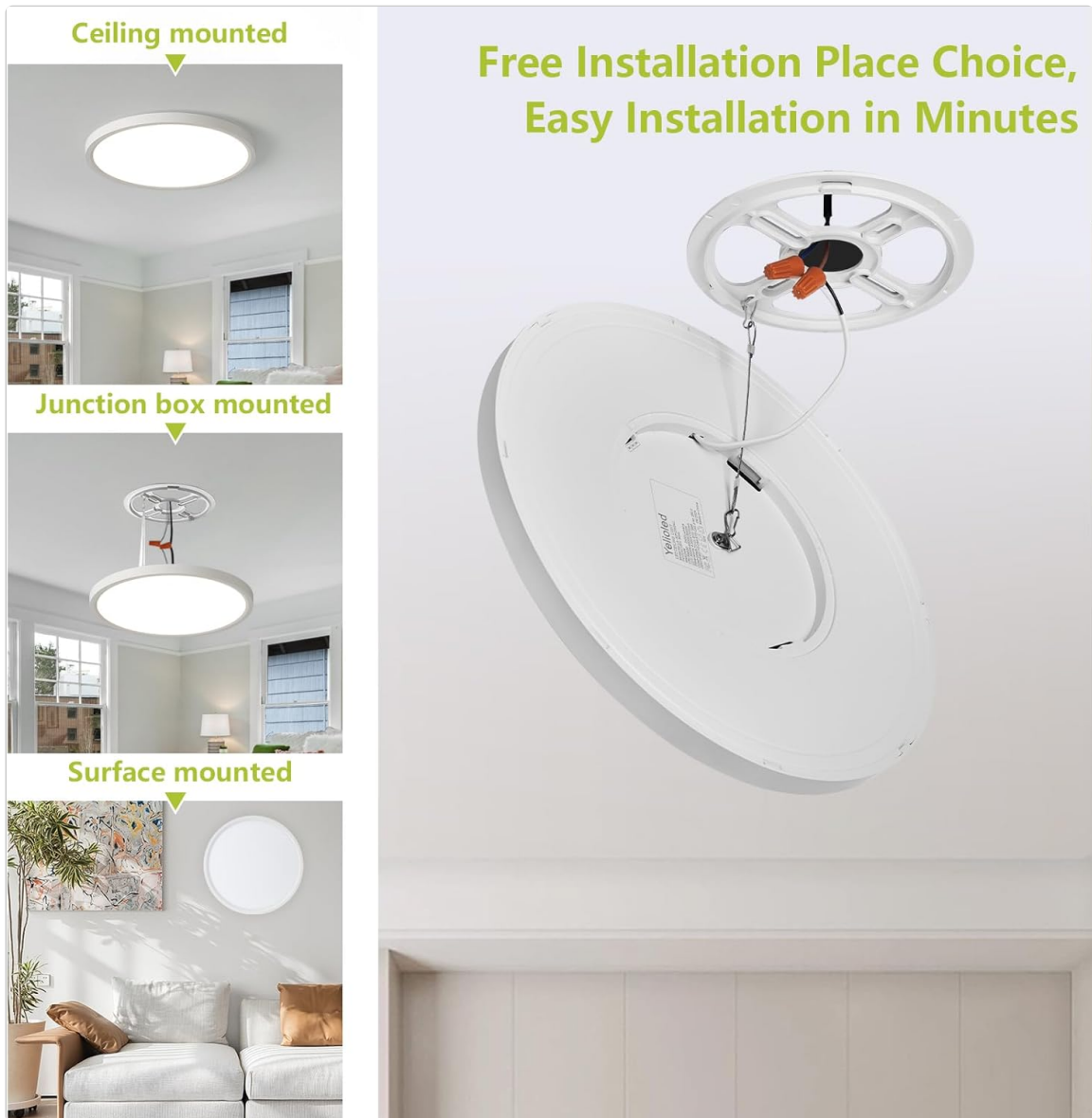
Image: The light fixture's base serves as the mounting bracket, offering flexible installation options for ceiling, junction box, or surface mounting.