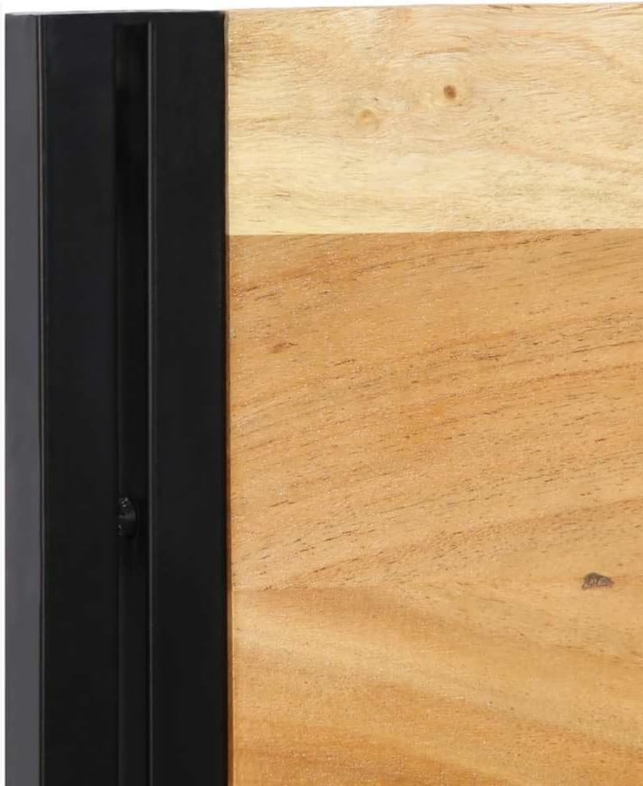
Figure 3: Detail of the connection between the wood panel and the iron frame.