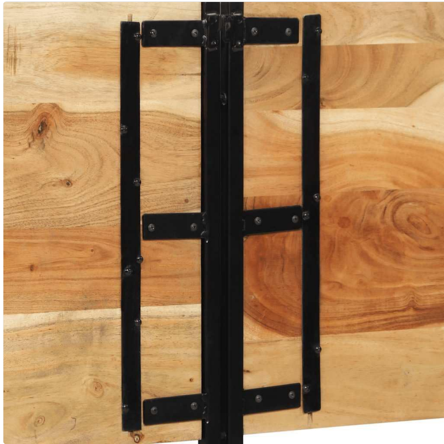
Figure 5: Rear view illustrating the central iron frame connections between the two wood panels.