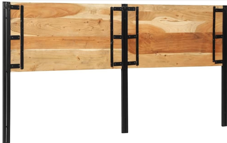
Figure 6: Rear view of the fully assembled headboard, showcasing the complete iron frame structure.