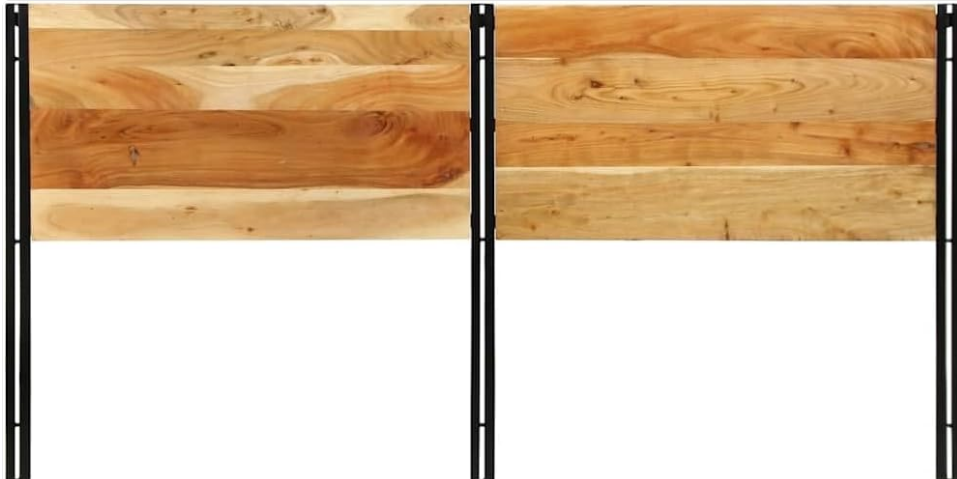
Figure 2: The two main acacia wood panels of the headboard.