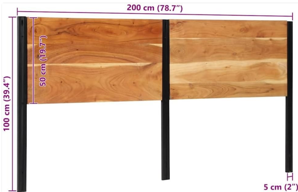
Figure 1: Overall view of the vidaXL Natural Solid Acacia Wood Headboard.

Constructed from solid acacia wood with a natural finish and supported by a powder-coated iron frame, this headboard is built for durability and stability. Its freestanding design allows for flexible placement and repositioning without requiring wall installation.