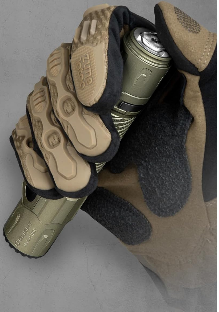
Image: Detailed output specifications for the OLIGHT Warrior Ultra.