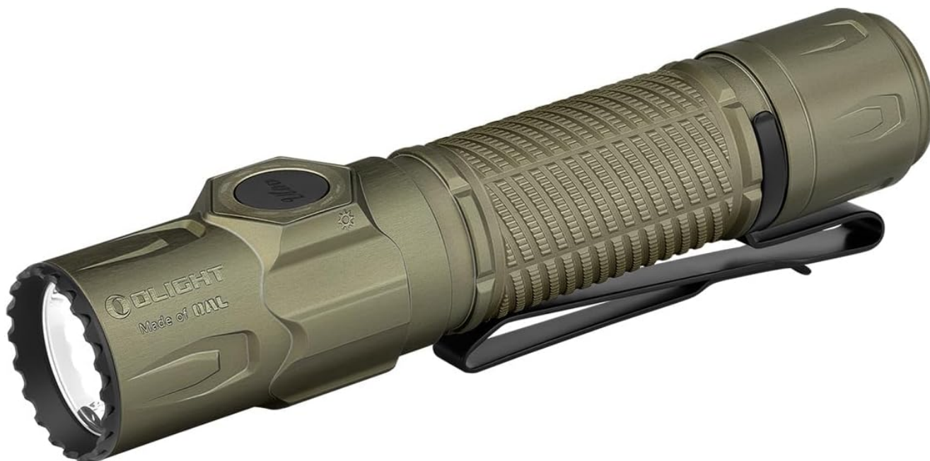
Image: OLIGHT Warrior Ultra 2500 High Lumens Tactical Flashlight in Olive Green.

The OLIGHT Warrior Ultra 2500 High Lumens Tactical Flashlight is a compact, rechargeable handheld light designed for outdoor, emergency, and searching applications. It features dual switches, a proximity sensor for automatic dimming, and a durable O-aluminum construction.