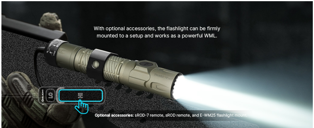
Image: OLIGHT's commitment to quality and customer satisfaction.