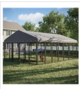
Image: Quick assembly overview.

The modular structure is designed for quick assembly and disassembly, as shown in the overview.