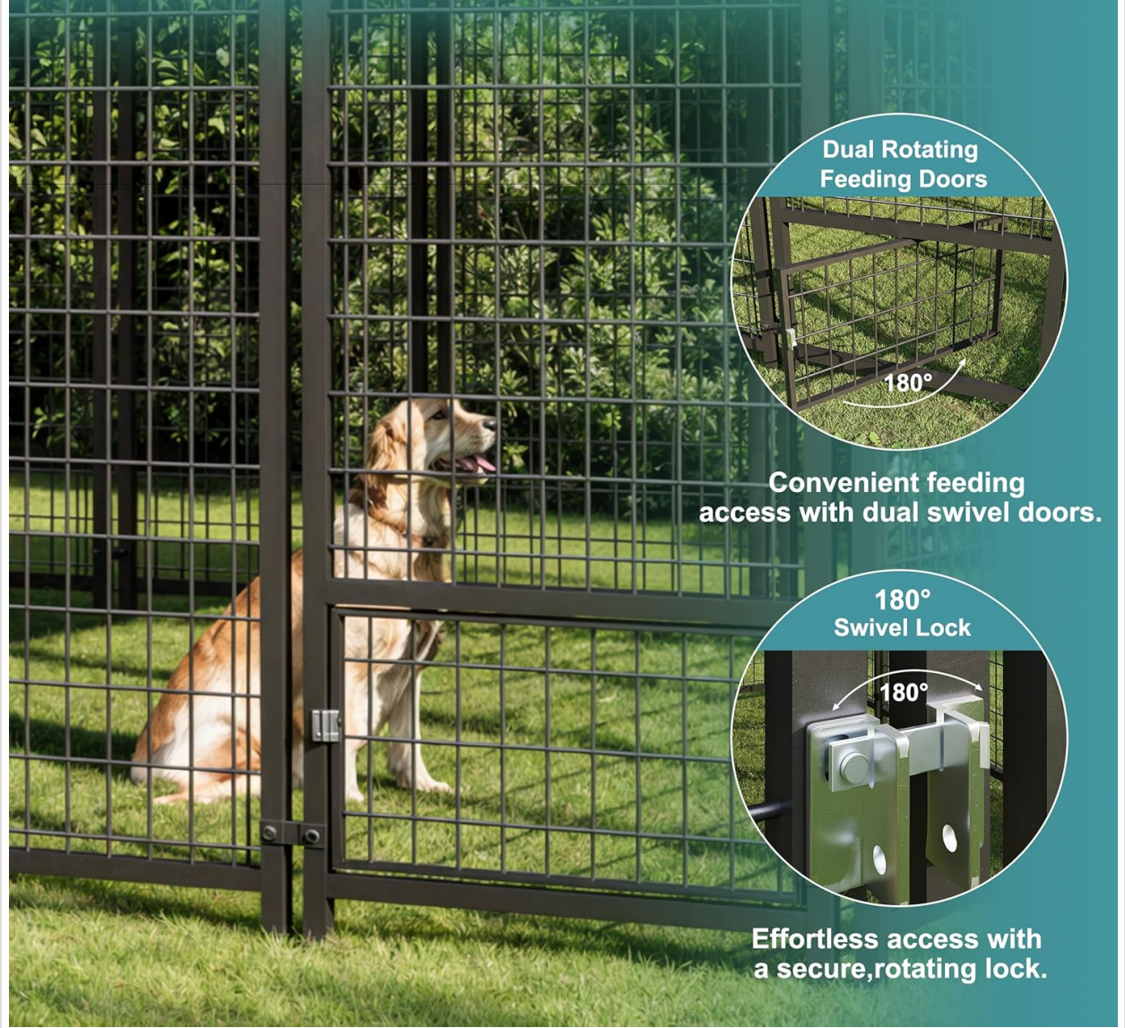
Dual Rotating Feeding Doors

Convenient feeding access with dual swivel doors.