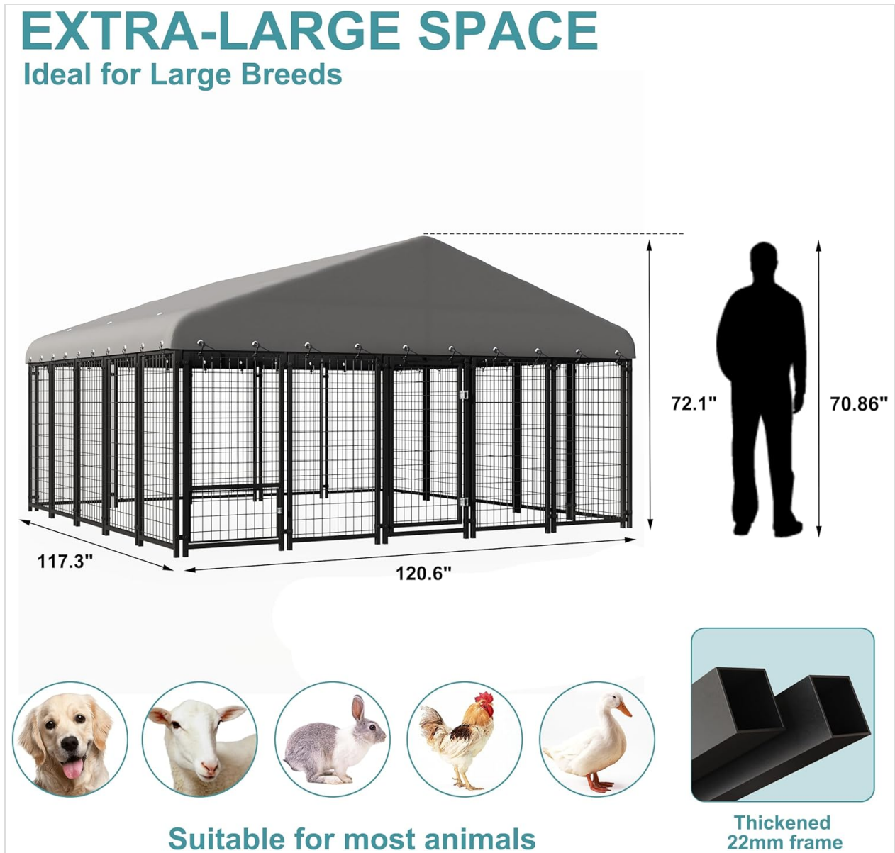
Image: Kennel dimensions for site planning.