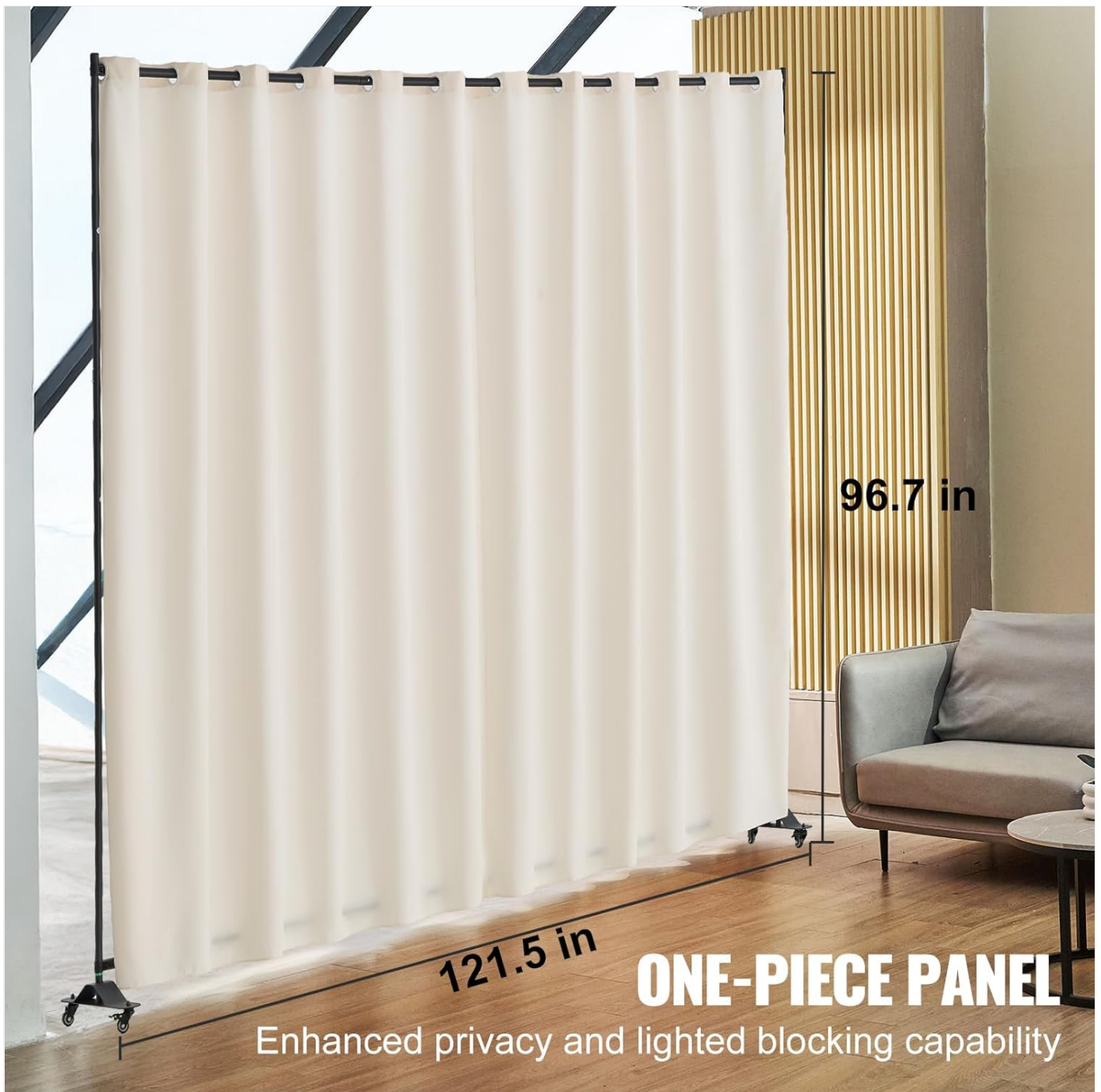
Image 1.1: VEVOR Room Divider showing overall dimensions (121.5 in W x 96.7 in H).

This portable room divider is suitable for various settings, including bedrooms, living rooms, offices, and hospitals, providing a flexible solution for space separation.