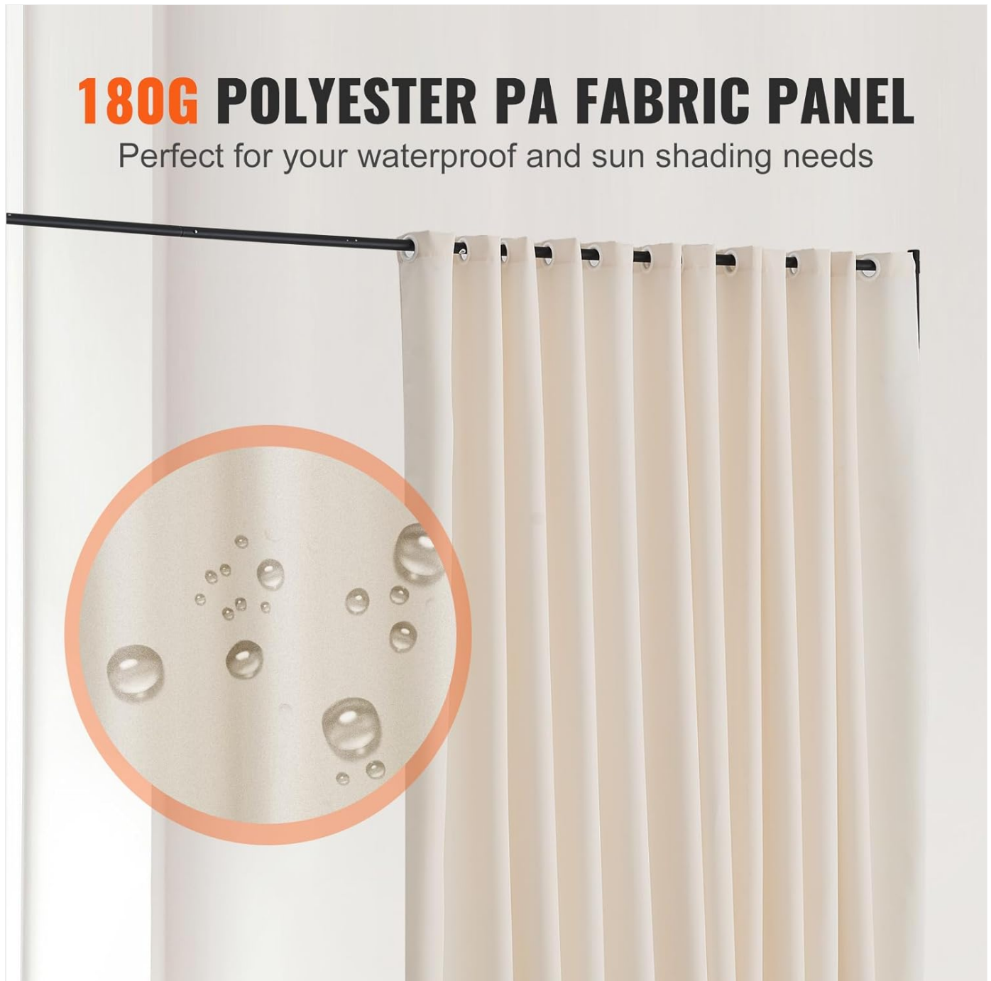
Image 6.1: Detail of the 180g polyester PA fabric panel, highlighting its waterproof and sun-shading capabilities.