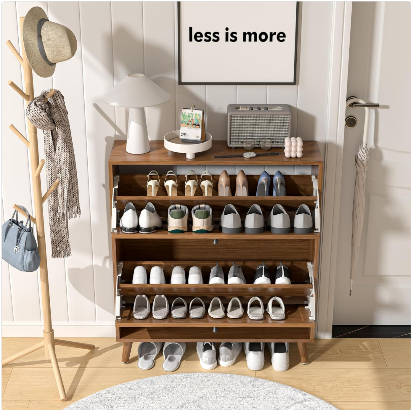
Figure 3: The shoe cabinet with its two flip drawers open, revealing the internal storage compartments filled with various types of footwear. This illustrates the practical capacity and organization of the unit.

their size and style. The internal shelves are removable, allowing for flexible storage of various shoe types, including high heels, slippers, sneakers, and boots.