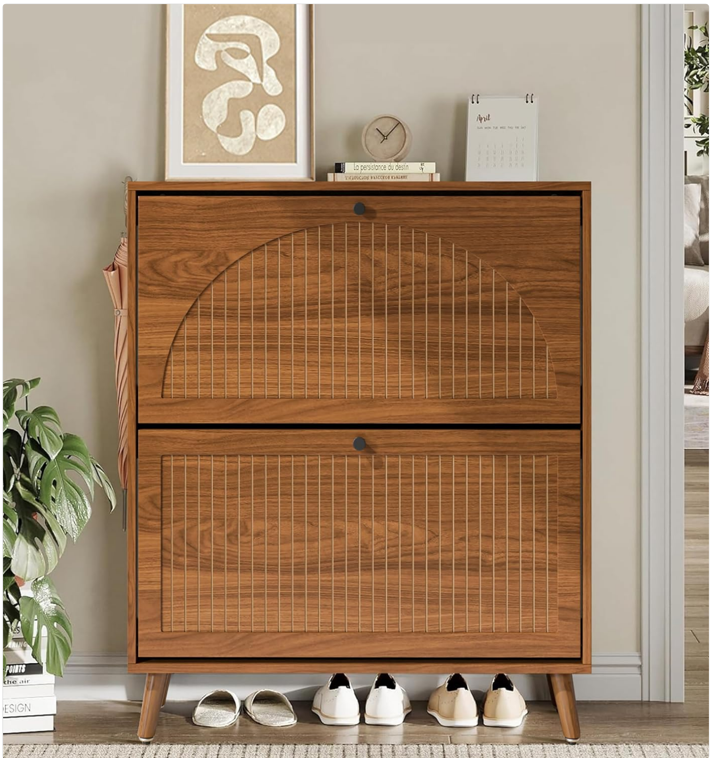
Figure 1: Front view of the Fsbecl Shoe Storage Cabinet in walnut finish. This image displays the two flip drawers with fluted panels and black handles, showcasing its modern aesthetic suitable for various home styles.