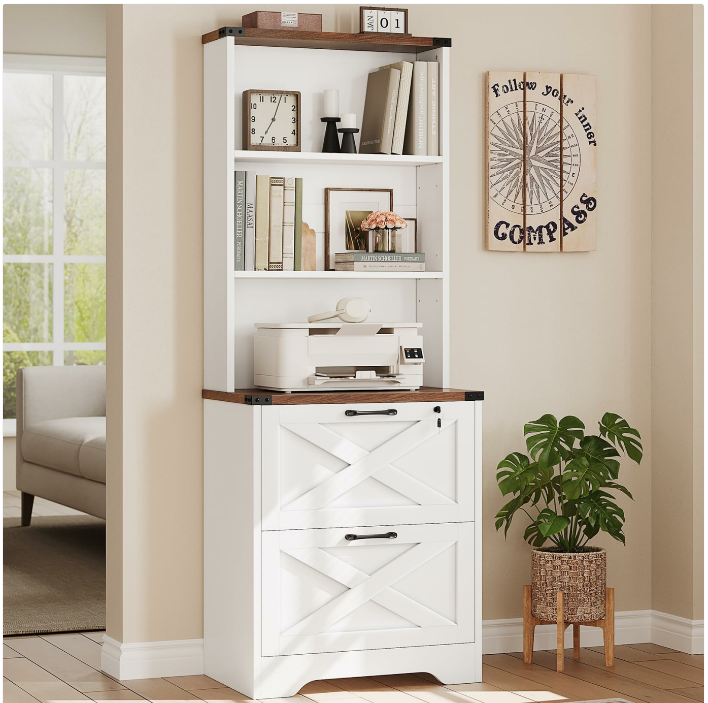
Image 1.1: The SEDETA 2-Drawer File Cabinet in white, featuring open shelves and two file drawers.