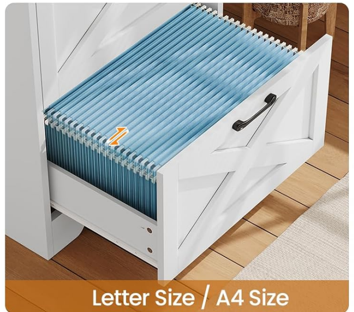
Image 5.2: Close-up view of the file cabinet drawers, demonstrating the lock feature, general storage, and compatibility with Legal, Letter, and A4 size hanging files.