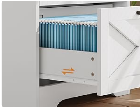
Image 5.4: The file drawer configured to hold Letter or A4 size hanging files.