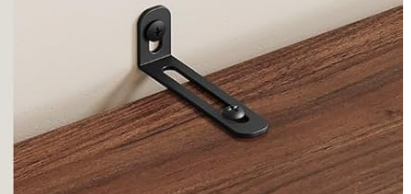
Image 2.1: Illustration showing the anti-tip kit being secured to the wall for enhanced stability and safety.

Secure the cabinet to the wall for safety