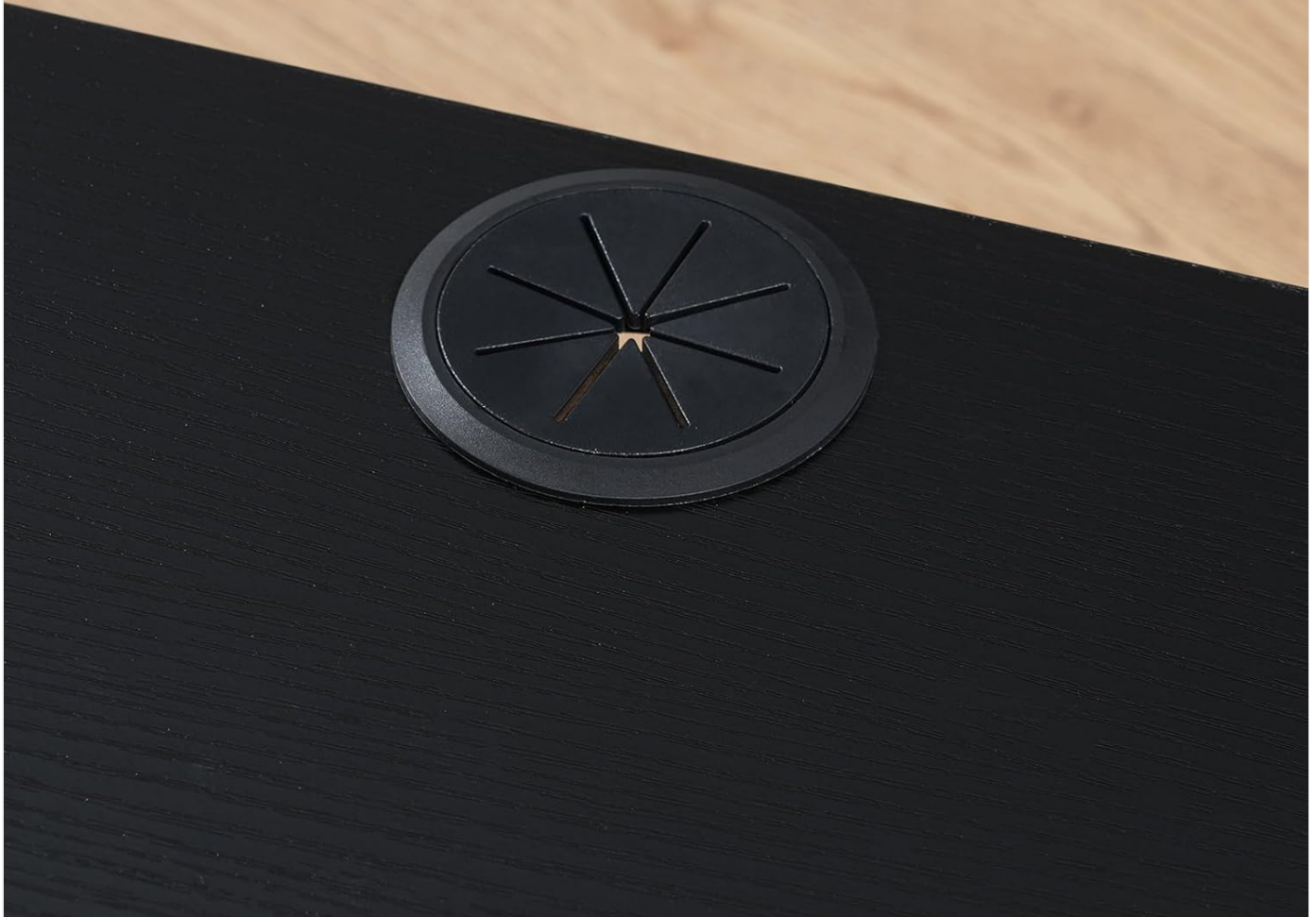
Image: A close-up of the circular cable management grommet on the TV stand's surface, designed to help organize and conceal power and data cables for a tidy appearance.

Streamline your cables, no more tangled messes.