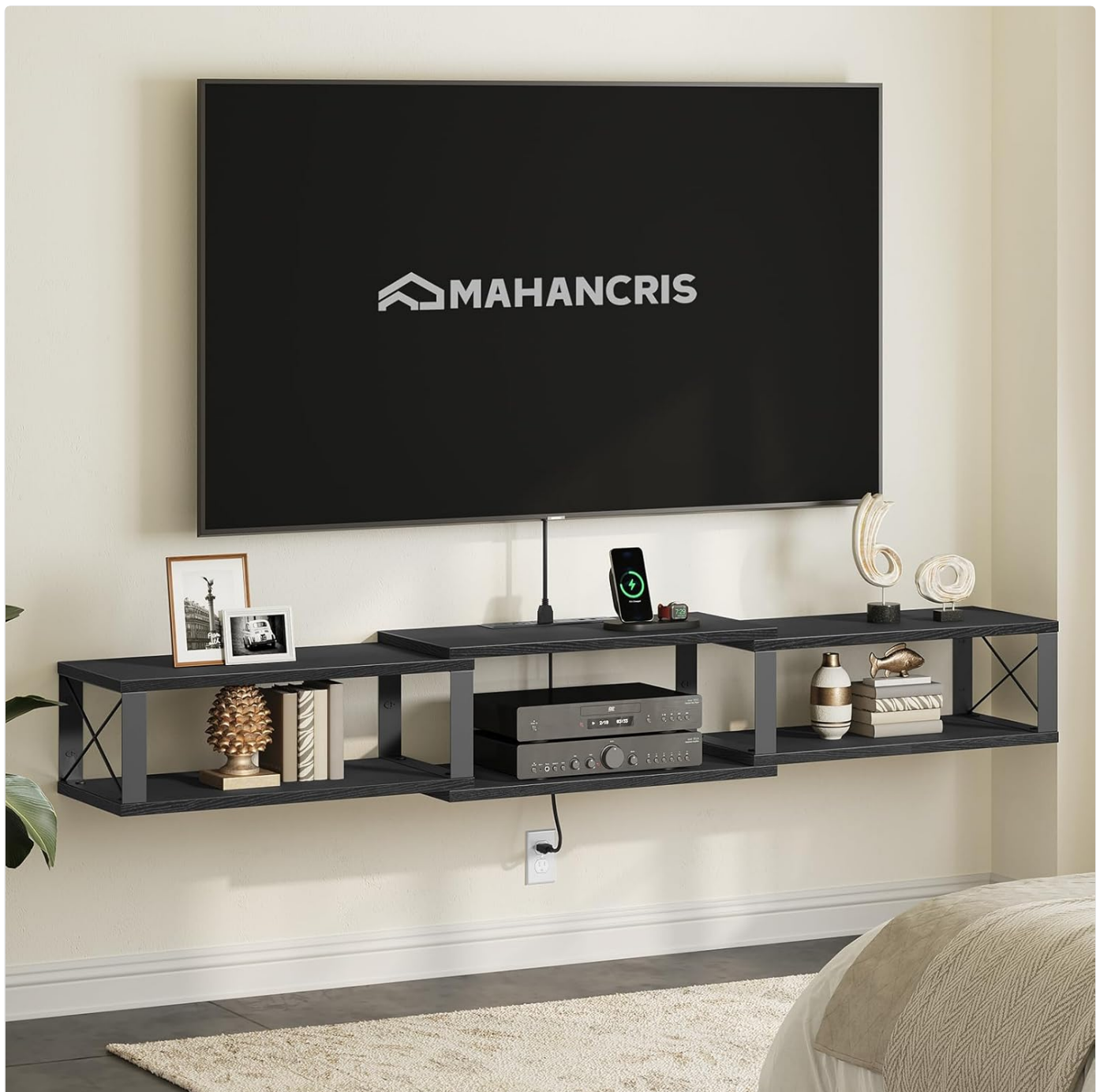
Image: The MAHANCRIIS Floating TV Stand, Model TVBK103E01, installed beneath a wall-mounted television in a modern living room setting. The stand provides organized storage for media devices and decorative items.