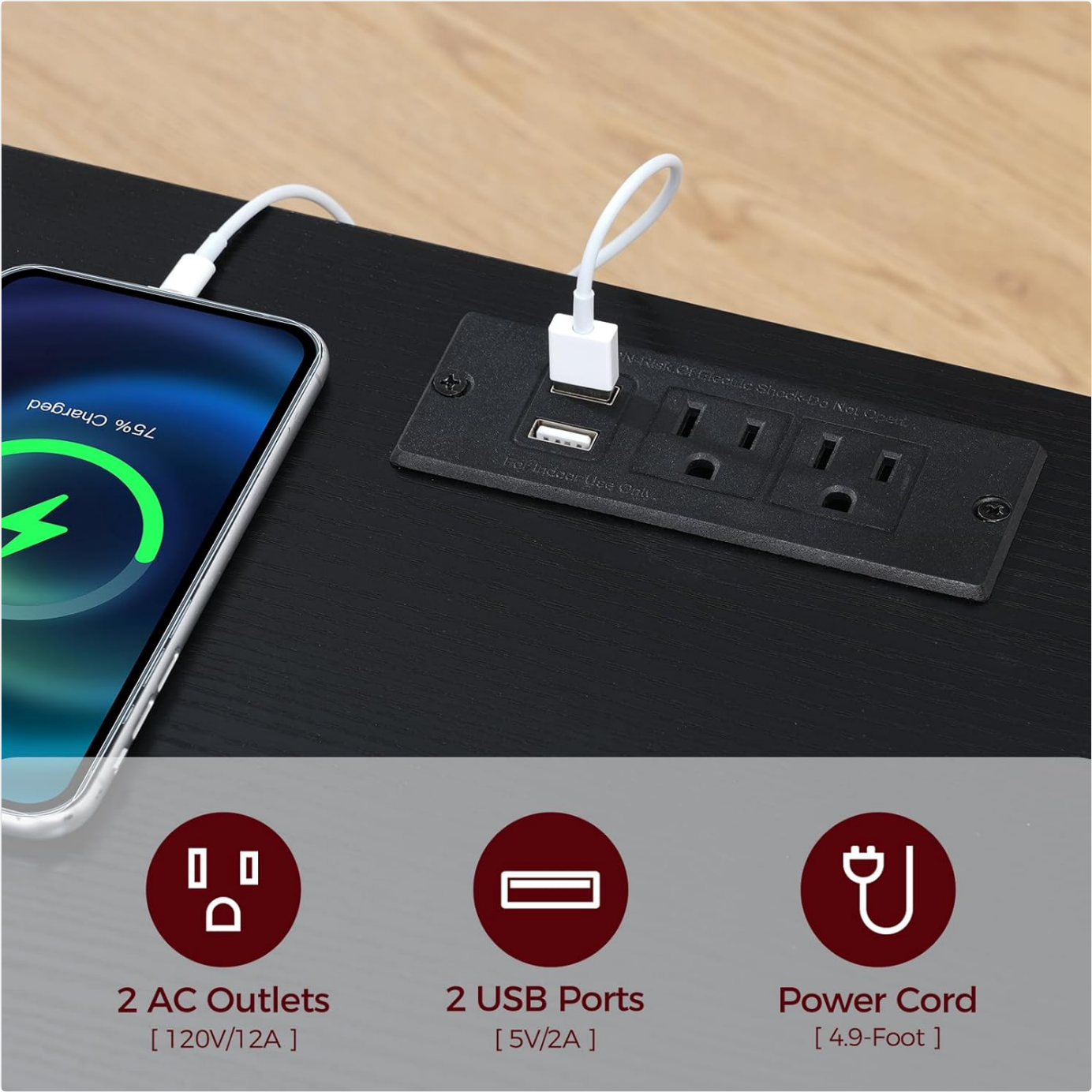
Image: A detailed view of the built-in power outlet on the TV stand, showing two standard AC outlets and two USB charging ports, ready for connecting electronic devices.