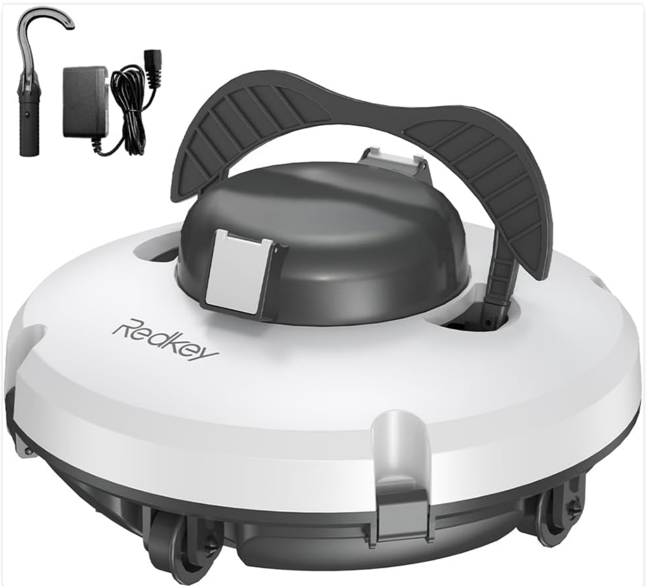
Figure 1.1: Redkey S100 Cordless Robot Pool Cleaner and accessories.