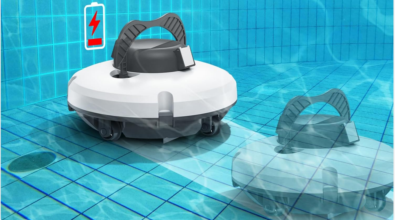
Figure 4.4: The self-parking feature ensures easy retrieval of the cleaner.

Your browser does not support the video tag.