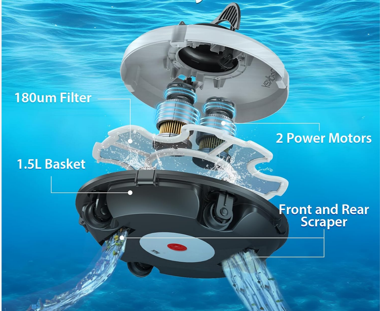
Figure 5.2: The S100 features an advanced filter system with a 1.5L basket.

Your browser does not support the video tag.