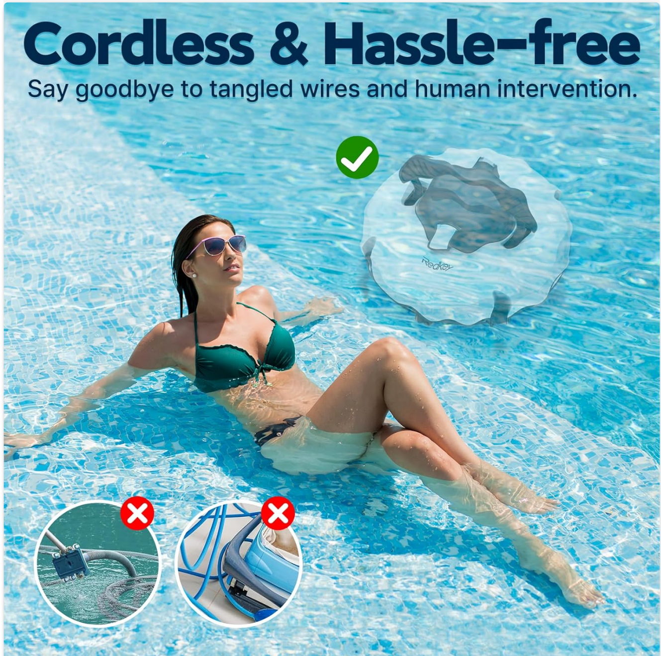
Figure 4.1: The Redkey S100 offers a cordless and hassle-free cleaning experience.

Enjoy the freedom of a cordless design. The S100 moves independently without the need for external power cords or hoses, preventing tangles and simplifying pool cleaning.