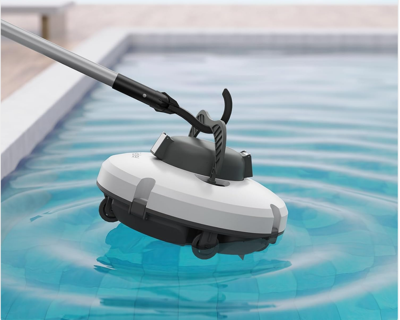
Figure 5.1: Easy retrieval of the Redkey S100 using the provided hook.

Your browser does not support the video tag.