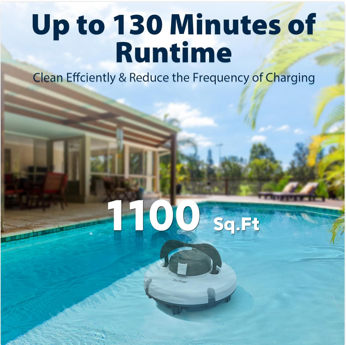
Figure 4.2: The Redkey S100 provides extended runtime for large pool coverage.