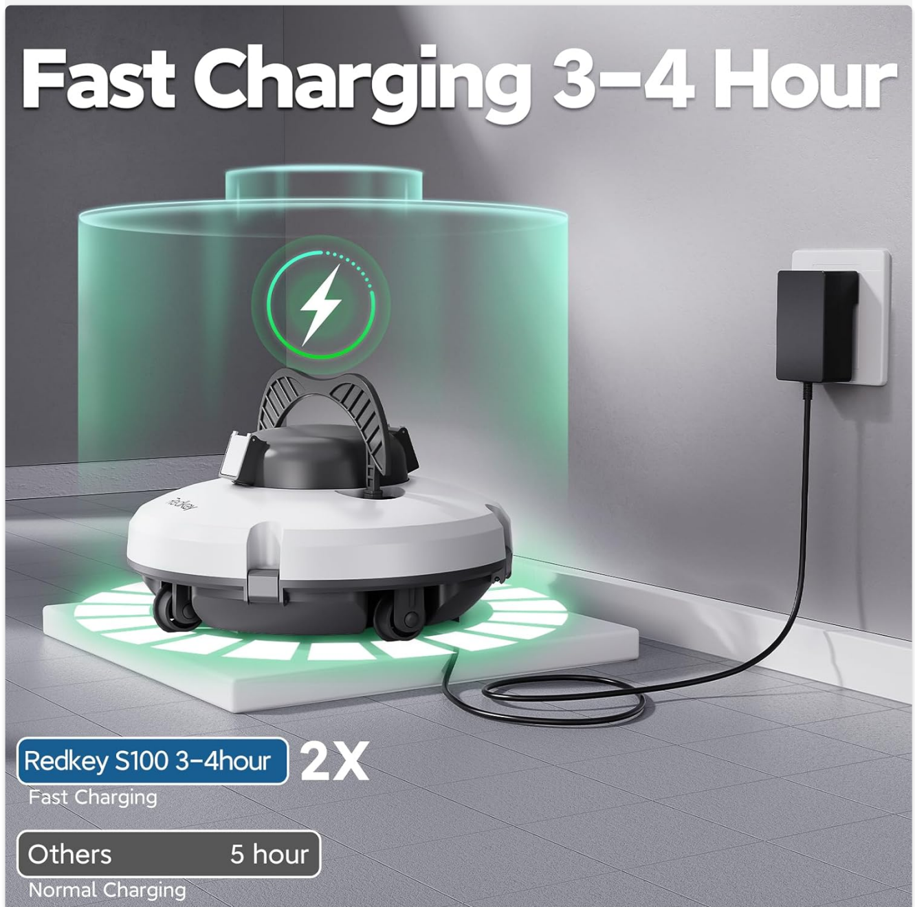
Figure 3.1: Connecting the Redkey S100 to its charger.

the charger to the cleaner's charging port and plug it into a power outlet. The indicator light will show charging status.