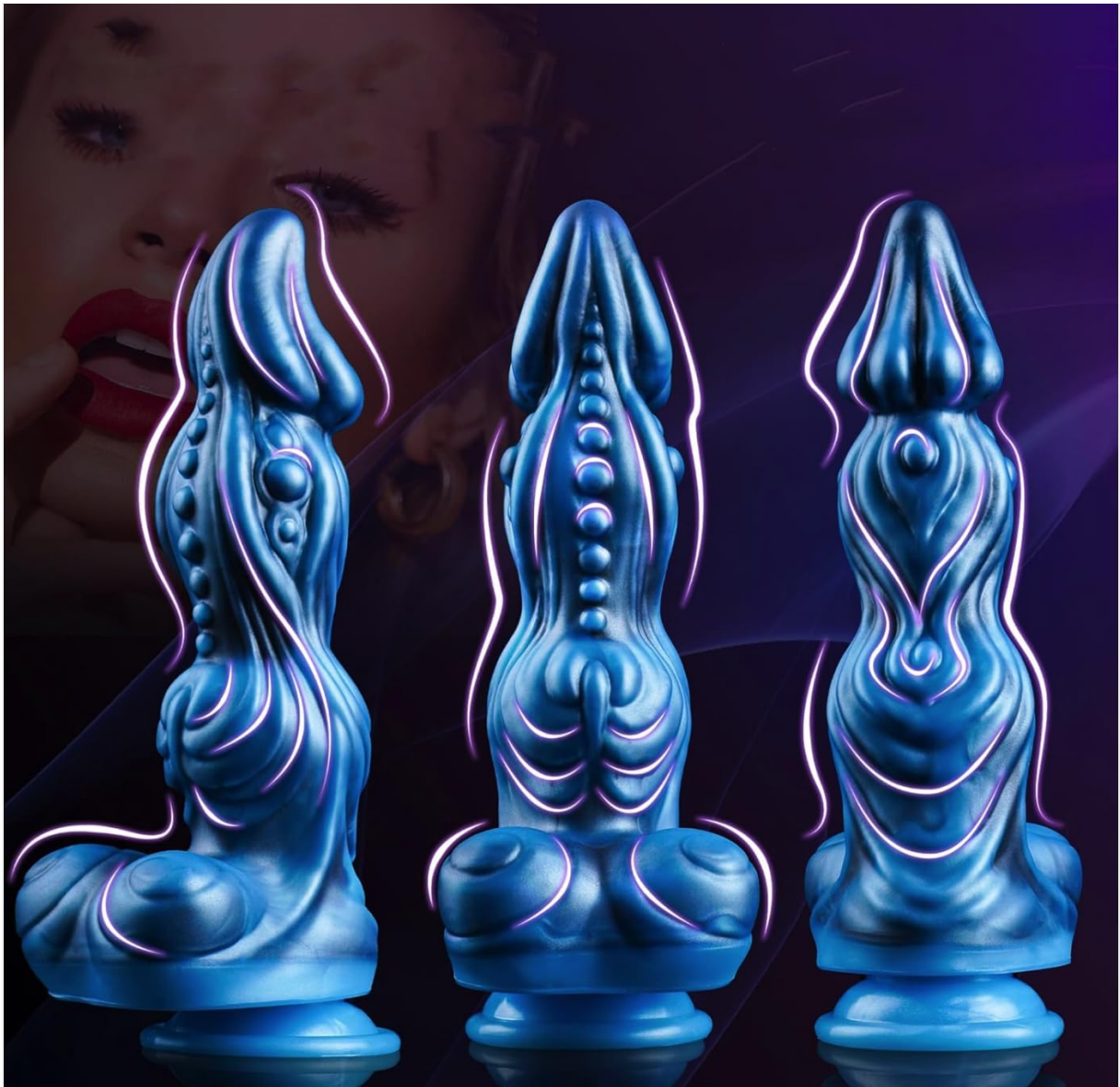
Image 2.2: Three distinct views of the product, showcasing its unique dragon-inspired design and contours from different perspectives.