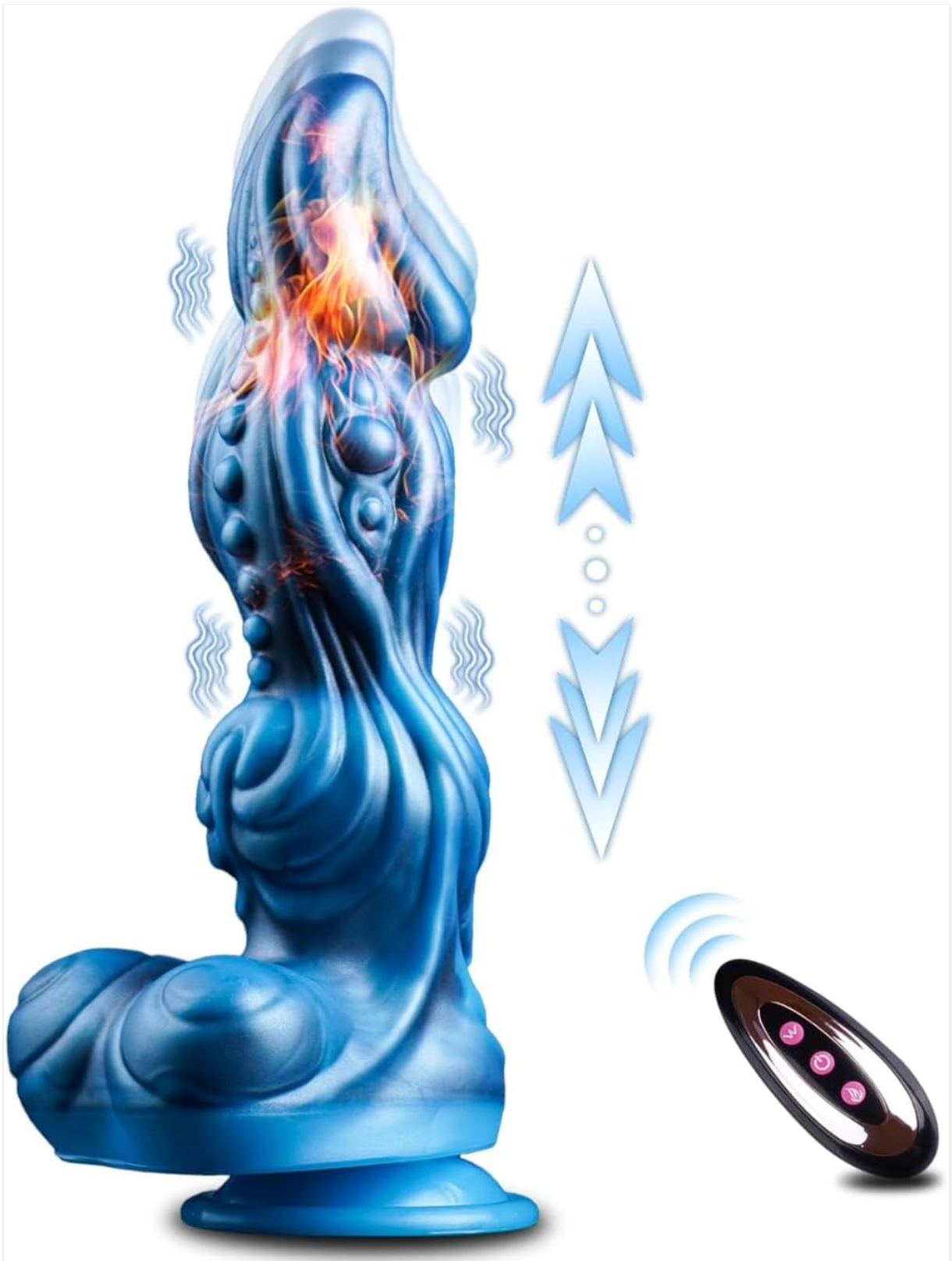
Image 1.1: The 4-in-1 Multi-Function Dragon Dildo shown with its wireless remote control. The image highlights the product's textured surface and the remote's control buttons.