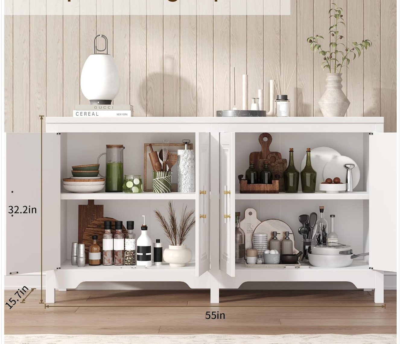
Figure 4: Interior view demonstrating ample storage space and key dimensions (55" W x 15.7" D x 32.2" H).