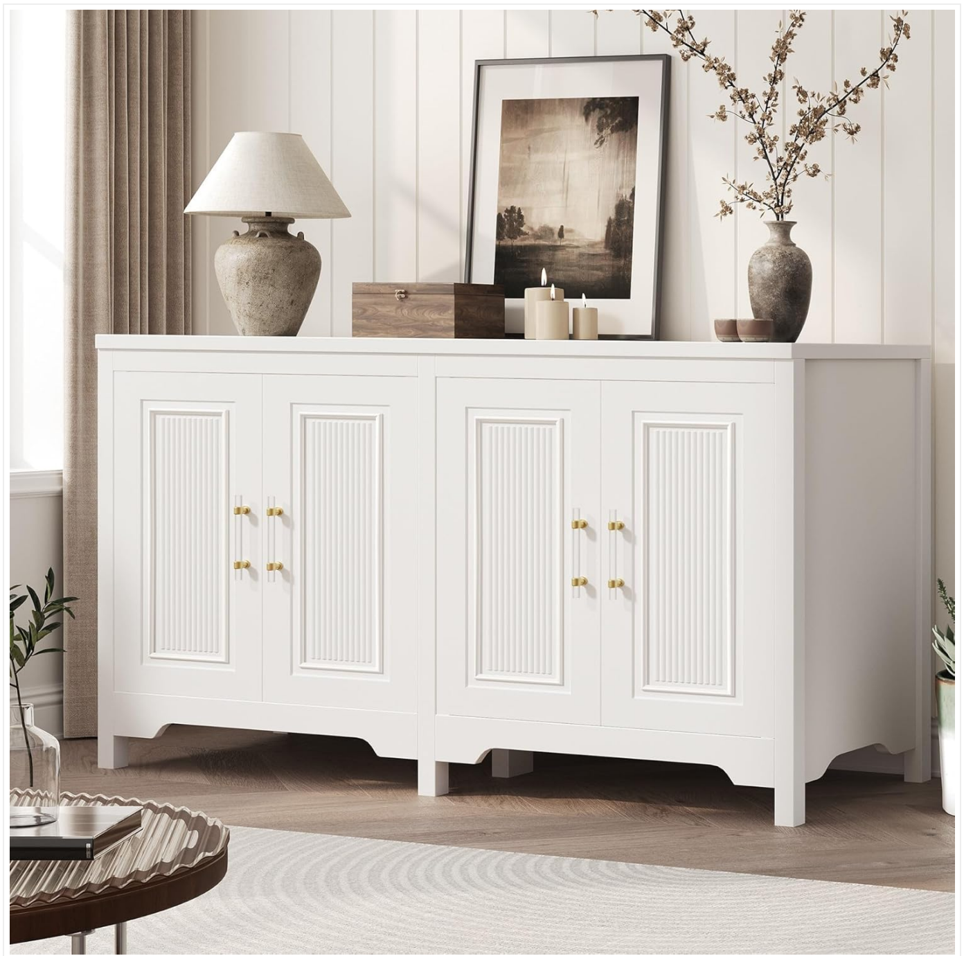
Figure 1: Jocoevol Buffet Cabinet with Storage, showcasing its elegant design and four doors.