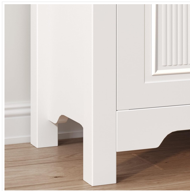
Figure 2: Detail of the cabinet leg attachment point.