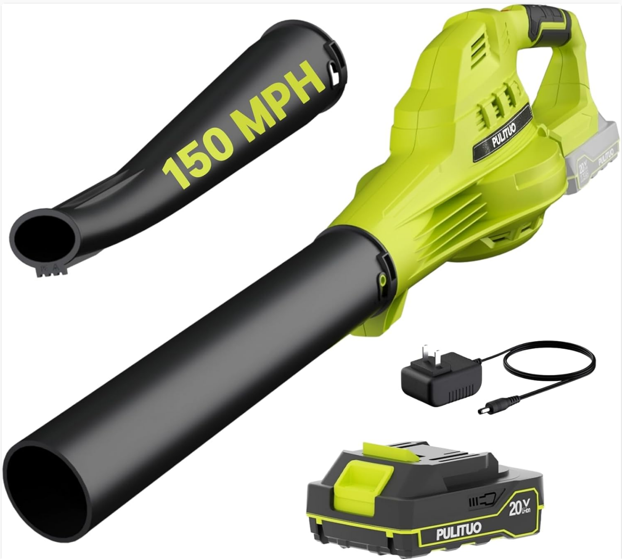
Image 3.1: Contents of the PULITUO Leaf Blower package, including the blower unit, battery, charger, and nozzles.