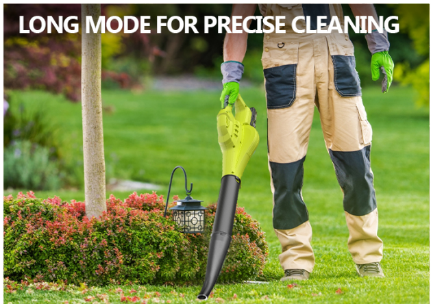
Image 7.2: Demonstrating short mode for general use and long mode for precise cleaning.

The PULITUO leaf blower is suitable for various tasks including lawn care, dust cleaning, acting as a BBQ helper, snow blowing, and as a car dryer.