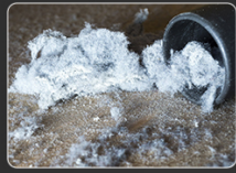
Level 1: Dust or fire

To suit Different Needs In Various Scenarios