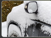
Level 3: Light Snow