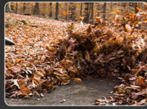
Level 2: Leaves and grass