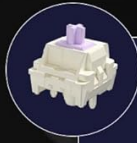
Creamy Medium Purple Switch