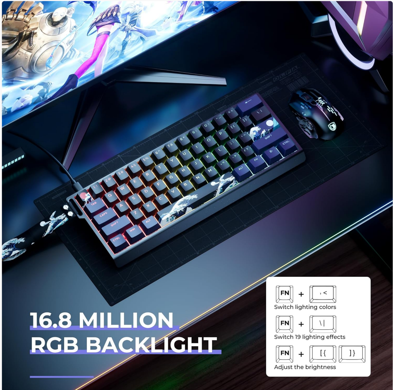
Figure 5.1: Dynamic RGB Backlight in operation.

For advanced customization, including personalized RGB modes and colors, please use the dedicated software.