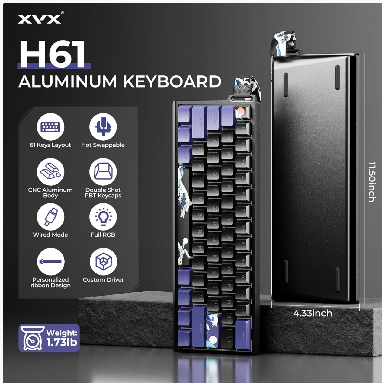
Figure 4.1: Overview of the XVX H61 Aluminum Keyboard features and dimensions.

Video 4.1: Official product video demonstrating the features and setup of the XVX H61 Wired Aluminum Gaming Keyboard, including the detachable strap and hot-swappable switches.