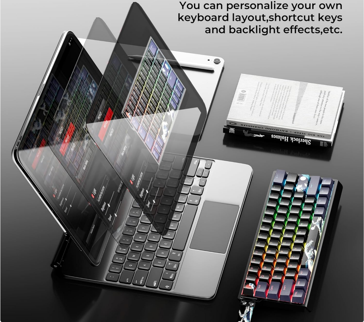
Figure 5.3: Programmable software interface.

You can personalize your own keyboard layout, shortcut keys and backlight effects, etc.