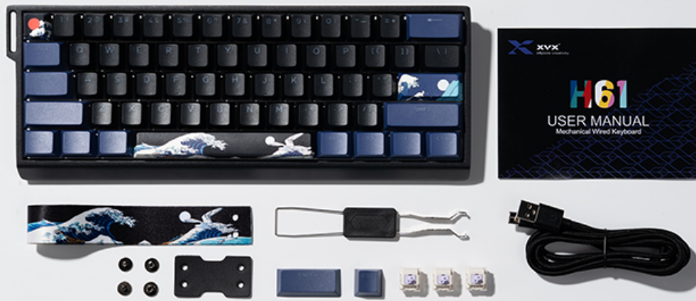
Figure 2.1: Contents of the HITIME XVX H61 package.