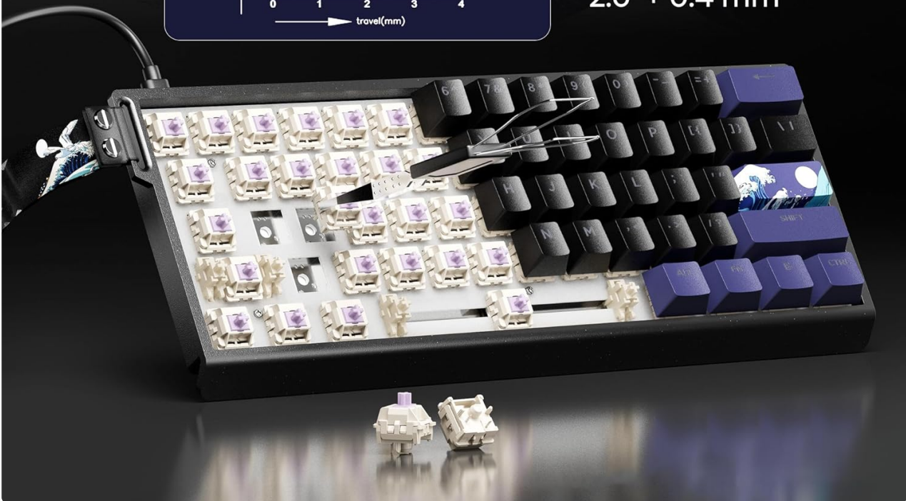
Figure 5.2: Hot-swappable switch mechanism.