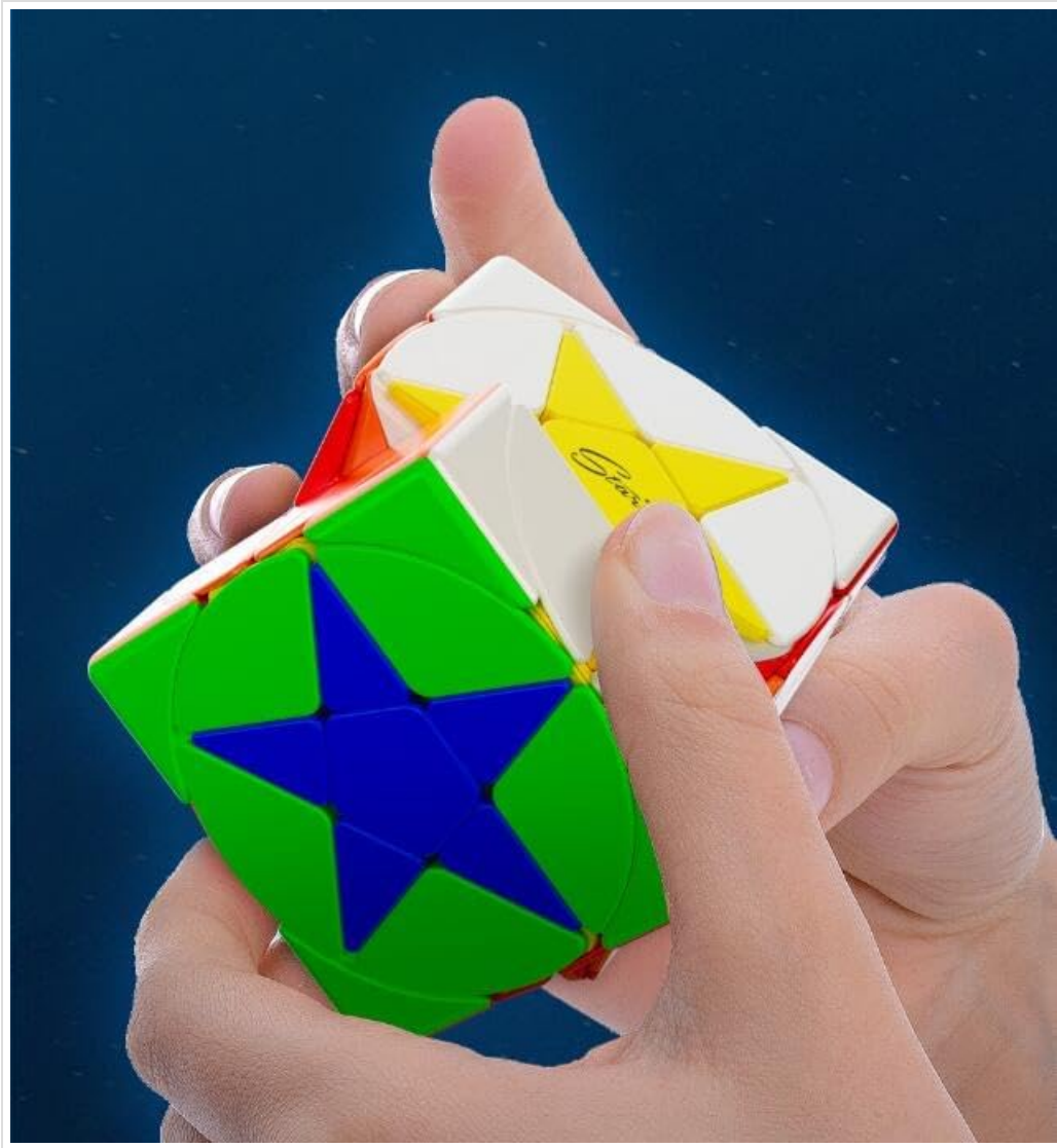
Image: A user's hands manipulating the Pentacle Cube, illustrating how the star patterns must be aligned to allow for a rotational movement of a face.