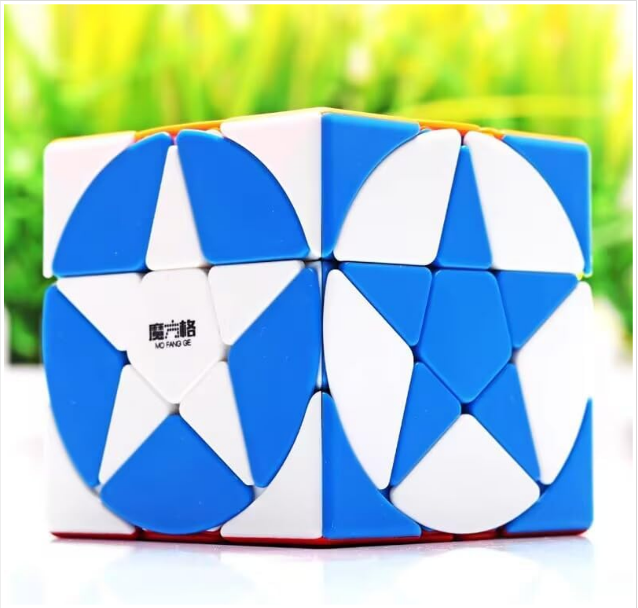
Image: The Cuberspeed QiYi Pentacle Cube in its solved configuration, displaying distinct blue and white star patterns on its faces.