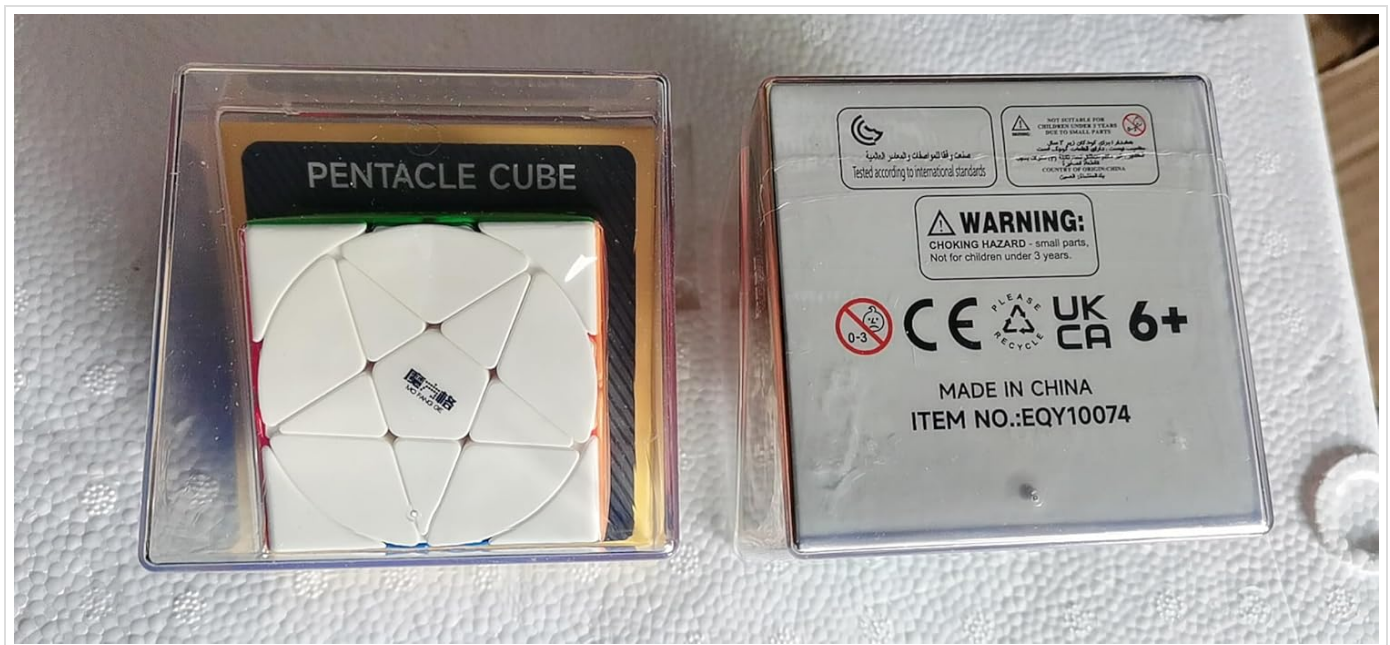
Image: Product packaging displaying safety warnings, including a choking hazard notice and a recommended age of 6+ years.