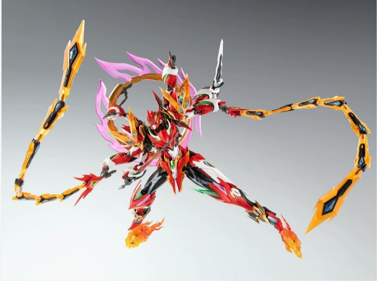
Image 4: The Nezha model posed dynamically, showcasing its articulation and ability to hold various weapons.