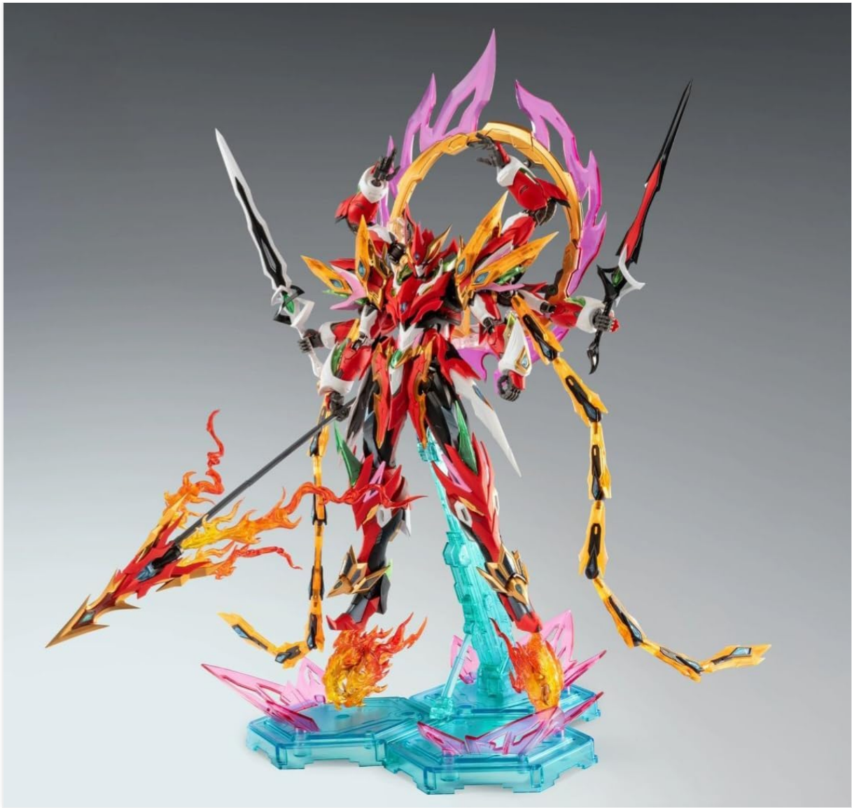
Image 5: The Nezha model securely mounted on its action base, demonstrating stable display options.