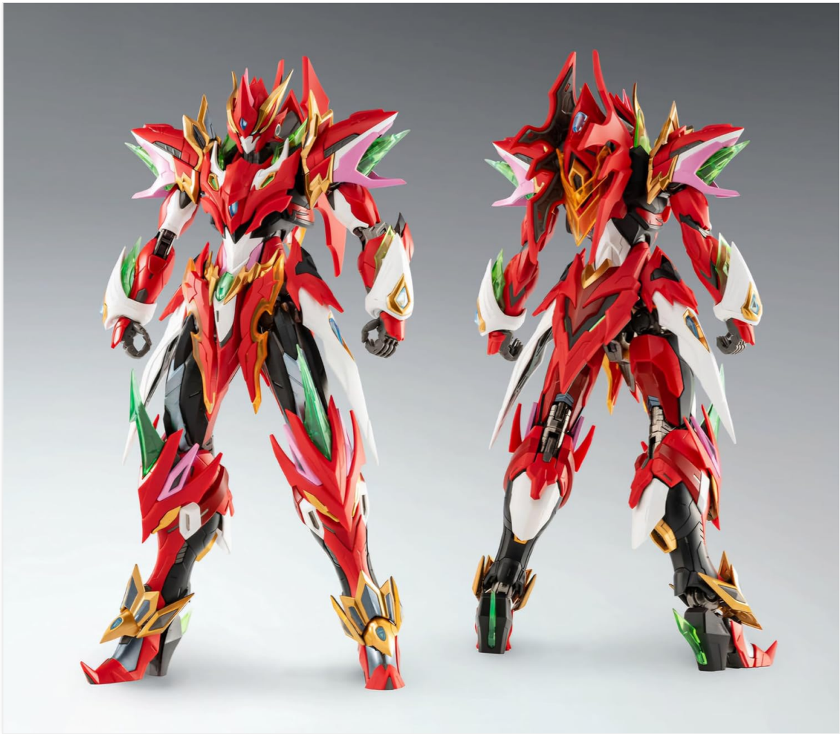
Image 2: Front and rear views of the Motor Nuclear Nezha model, highlighting its intricate design and articulation points.