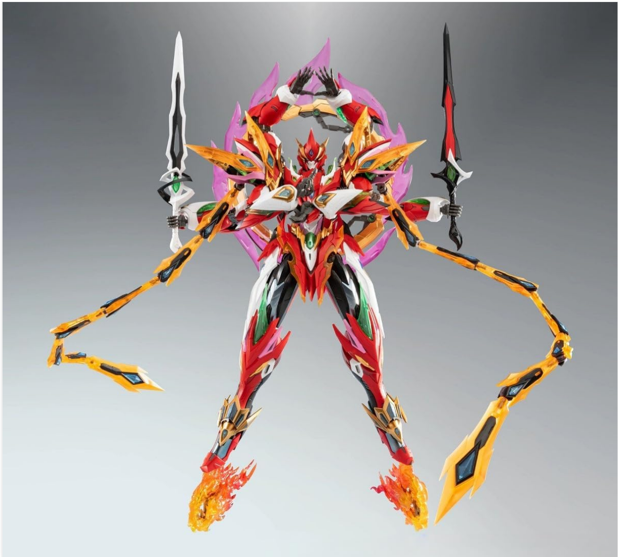
Image 1: The Motor Nuclear Nezha model showcasing its full assembly with all included weapons and effect parts.