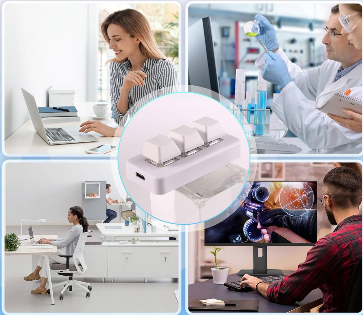
Image: A collage showing the TKOWTB MK321U Mini Keyboard being used in different environments: an office setting, a laboratory, and a gaming setup, demonstrating its wide scope of application.