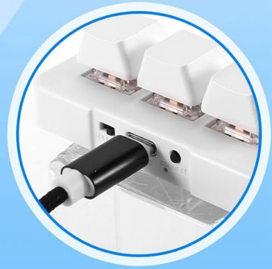
Image: The TKOWTB MK321U Mini Keyboard shown with its included USB cable. The keyboard features three large, white mechanical keys and a Type-C port for connection.