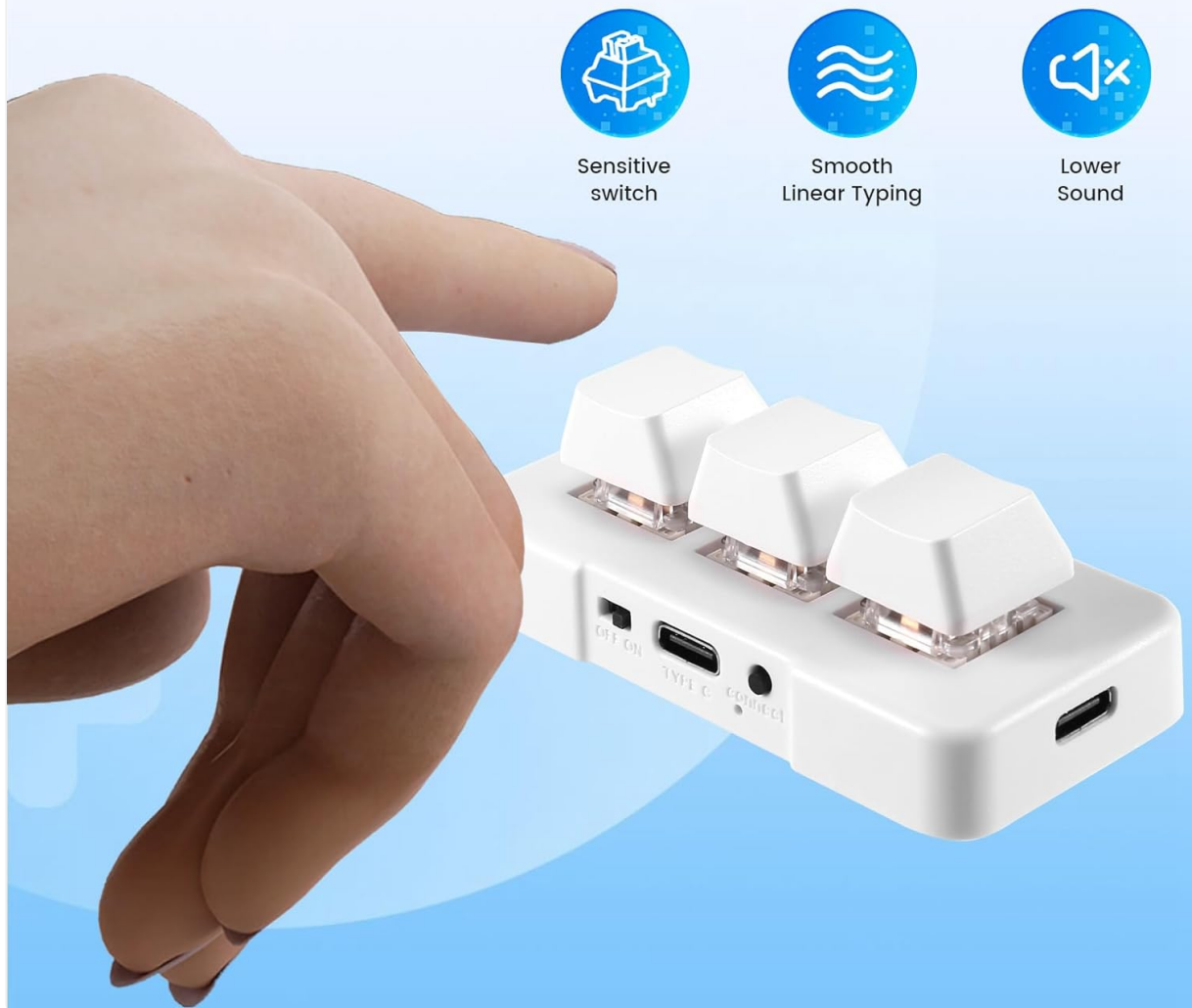
Image: A hand interacting with the TKOWTB MK321U Mini Keyboard, emphasizing its standard as a mini keyboard. Icons illustrate its sensitive switches, smooth linear typing experience, and lower sound profile.