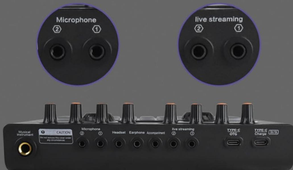
Figure 2: Rear view of the X3 Live Voice Mixer, highlighting microphone inputs, live streaming outputs, headset, earphone, accompaniment, and USB-C ports.