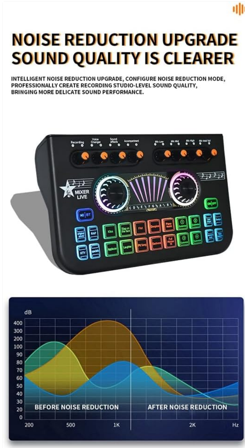
Figure 6: Visual representation of noise reduction, showing improved sound quality after the feature is activated.