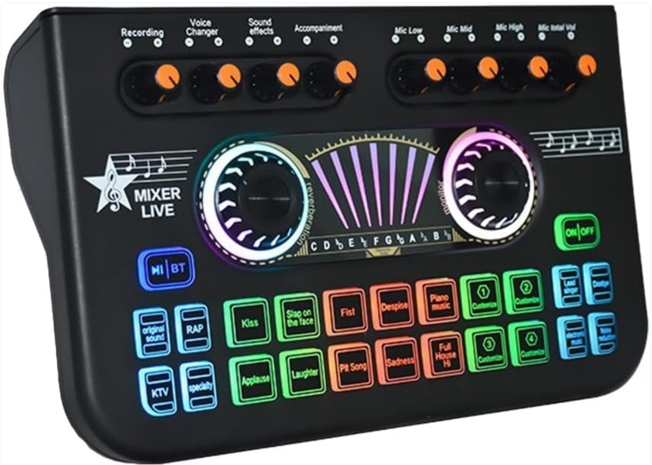
Figure 1: Front view of the X3 Live Voice Mixer Audio Interface Console, showing control knobs, illuminated buttons, and central display.