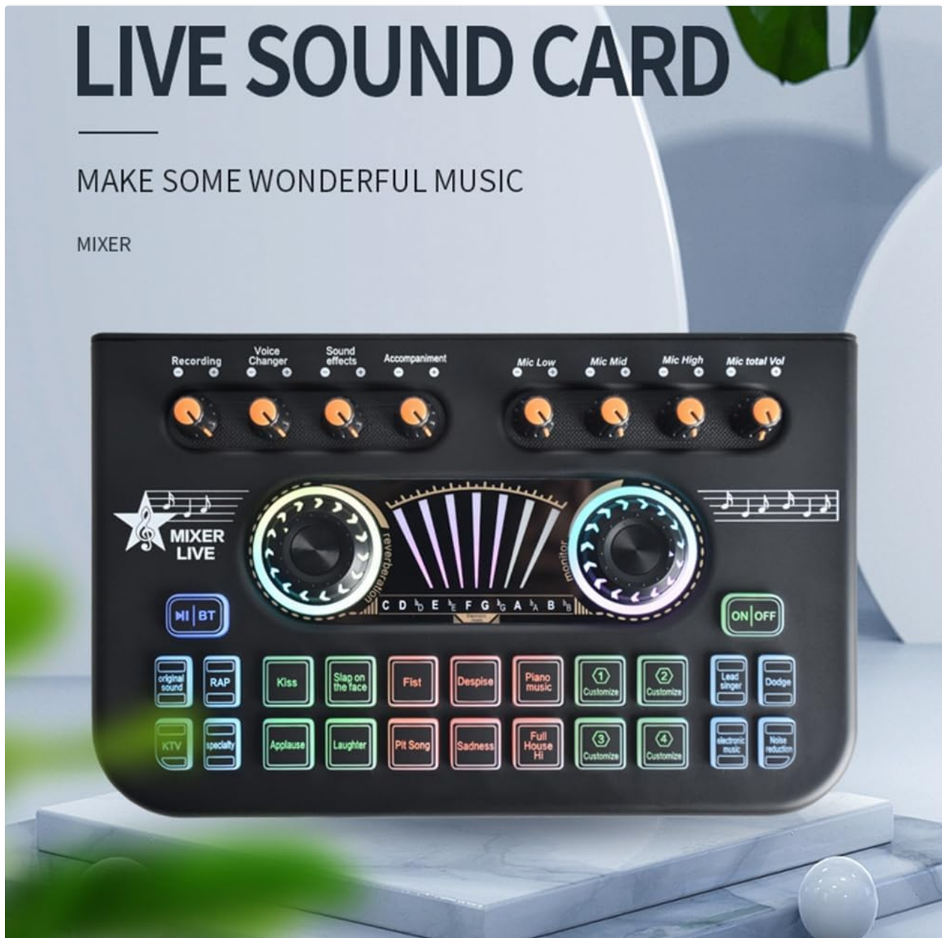
Figure 3: Top view of the X3 Live Voice Mixer, showing the layout of all control knobs and illuminated function buttons.

The X3 Live Voice Mixer features a comprehensive set of knobs and buttons for precise audio control and effect application.