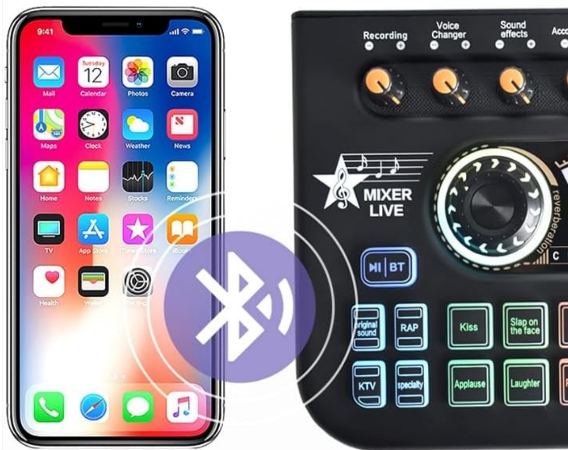
Figure 5: Illustration of Bluetooth accompaniment transmission, allowing wireless audio input from a smartphone.