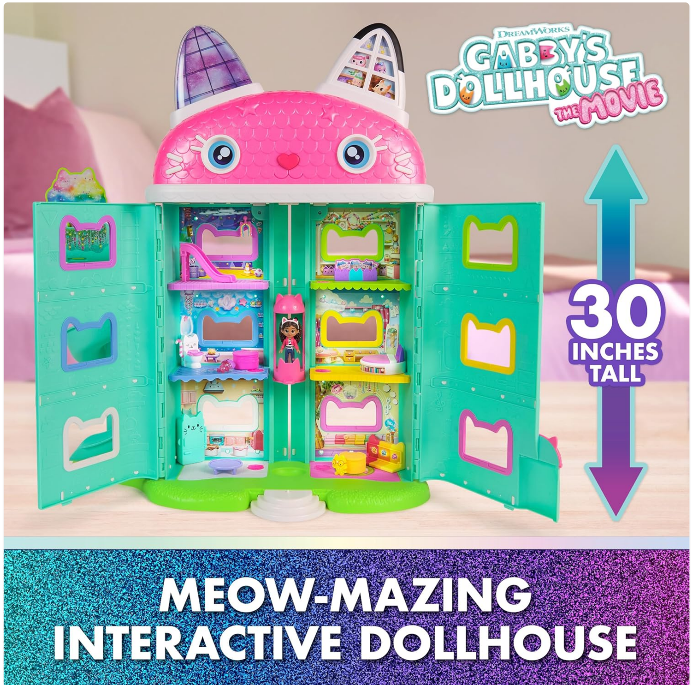
Image: The dollhouse fully assembled and open, highlighting its 30-inch height.

Carefully remove all components from the packaging. The dollhouse may come partially folded or require minor assembly of external parts like the slide or specific room sections. Refer to the visual guides on the packaging or included quick-start sheet for specific assembly instructions. Ensure all pieces click securely into place.