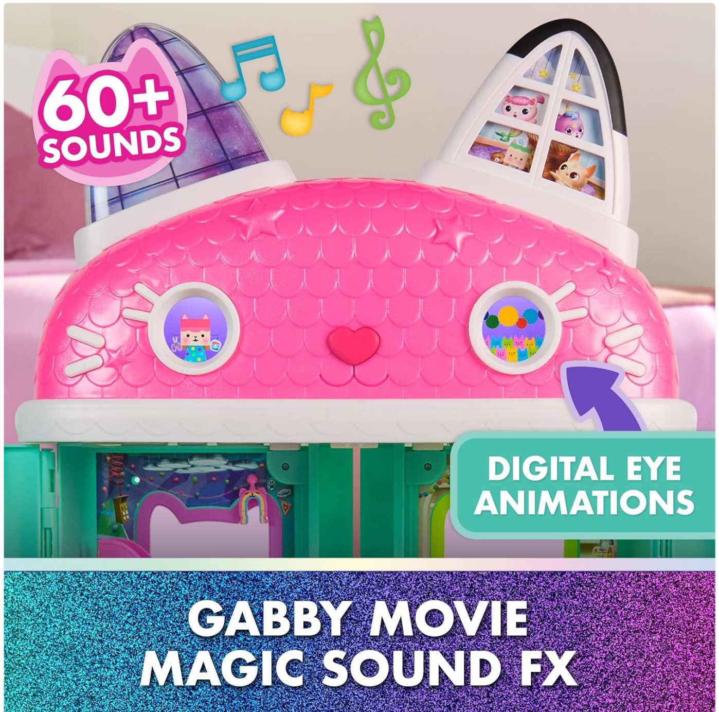
Image: A close-up of the dollhouse's cat-shaped head, showing the digital eye animations and indicating over 60 sounds.

animations, music from the movie, and sound effects, are activated through different play actions. Pressing the dollhouse's nose or activating Paw Bump Magic buttons will trigger these interactive elements.