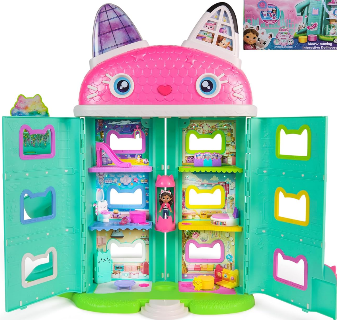
Image: The Gabby's Dollhouse Meow-Mazing Interactive Dollhouse in its packaging, showing the main dollhouse unit.