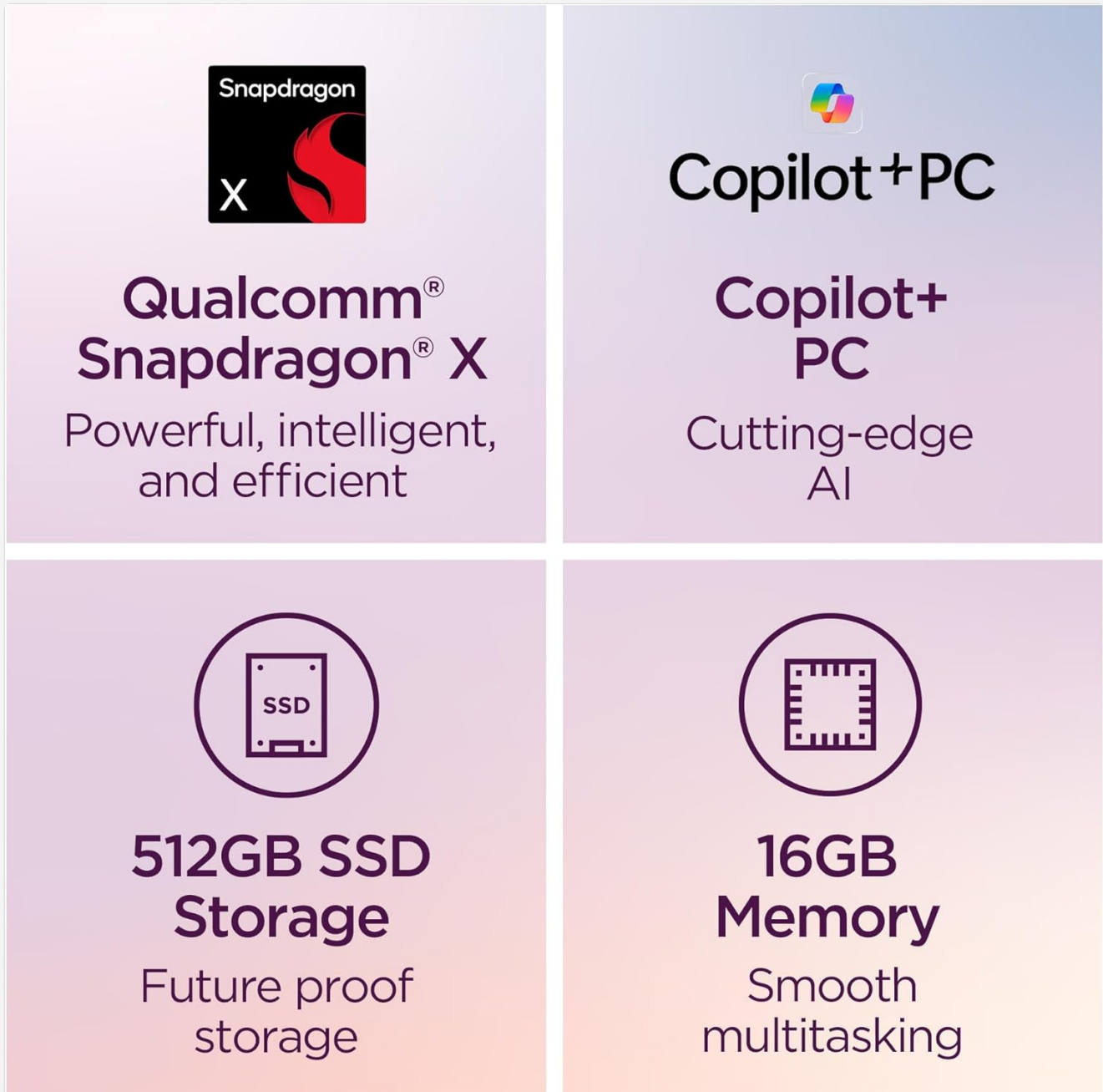
Image 3.1: Key features of the IdeaPad Slim 3X, including its processor, AI capabilities, storage, and memory.

The IdeaPad Slim 3X features a 15.3-inch WUXGA (1920x1200) display with a 16:10 aspect ratio. It offers vivid colors and sharp contrast. The display is TÜV certified for eye comfort, reducing blue light emissions during prolonged use.