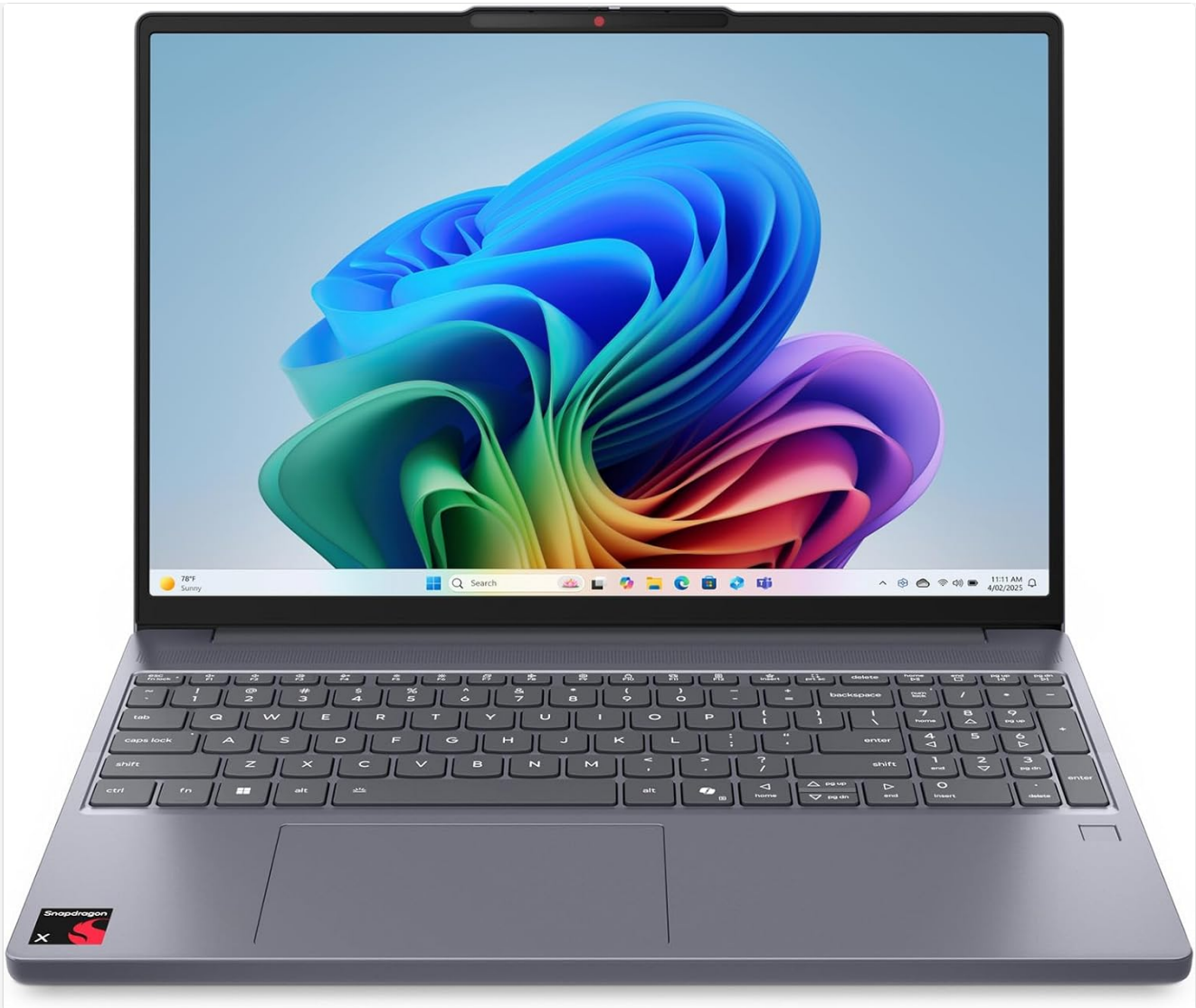
Image 1.1: The Lenovo IdeaPad Slim 3X laptop, showcasing its display and keyboard layout.