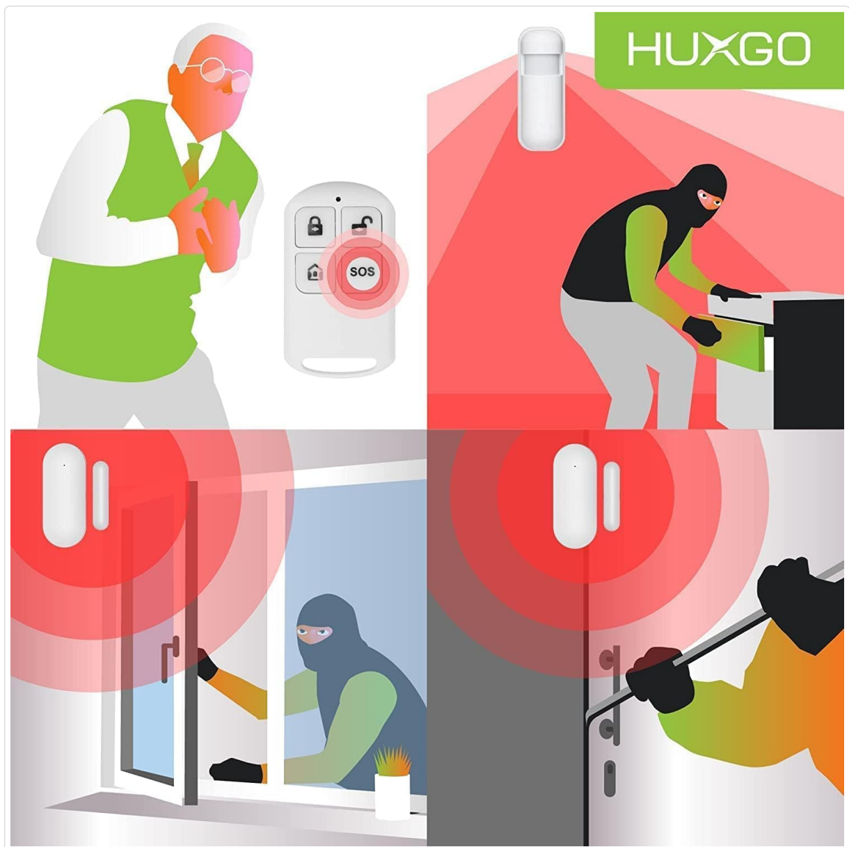
Image: Visual representation of the SOS function on the remote control and various alarm scenarios detected by motion and door/window sensors.

In an emergency, press the SOS button on the remote control or the control panel. This will immediately trigger the alarm and send notifications to pre-programmed emergency contacts.