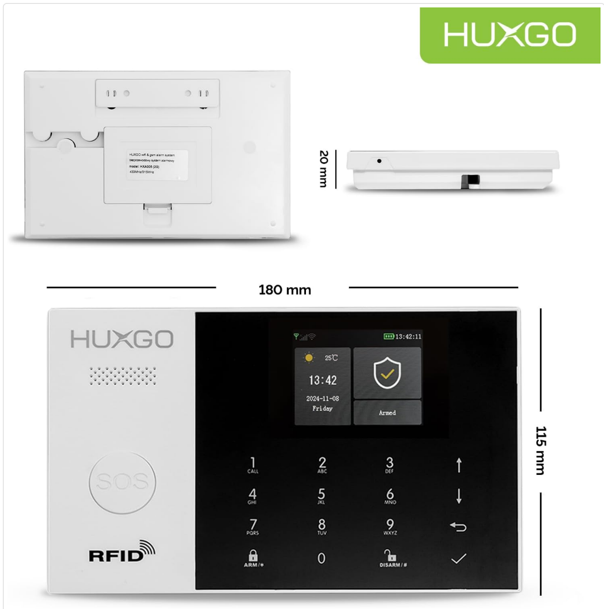
Image: Dimensions of the HUXGO HXA005 control panel, showing its compact size for discreet installation.