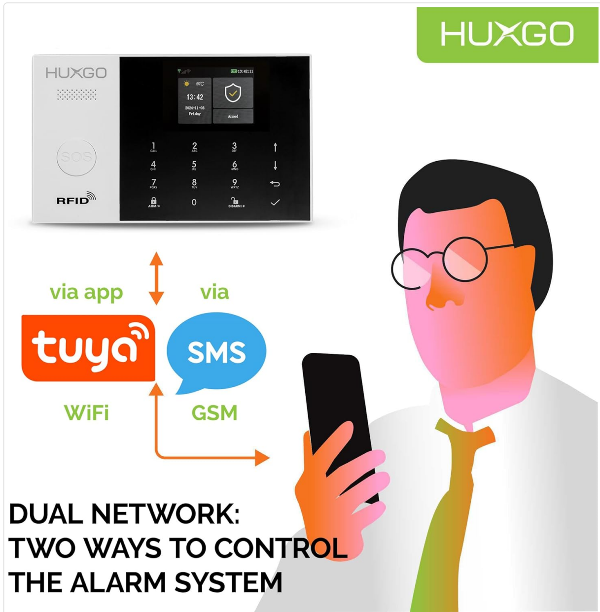
Image: Illustration showing dual network control via Tuya app (WiFi) and SMS (GSM) for the HUXGO HXA005 alarm system.

The HUXGO HXA005 system offers multiple ways to control and monitor your security.