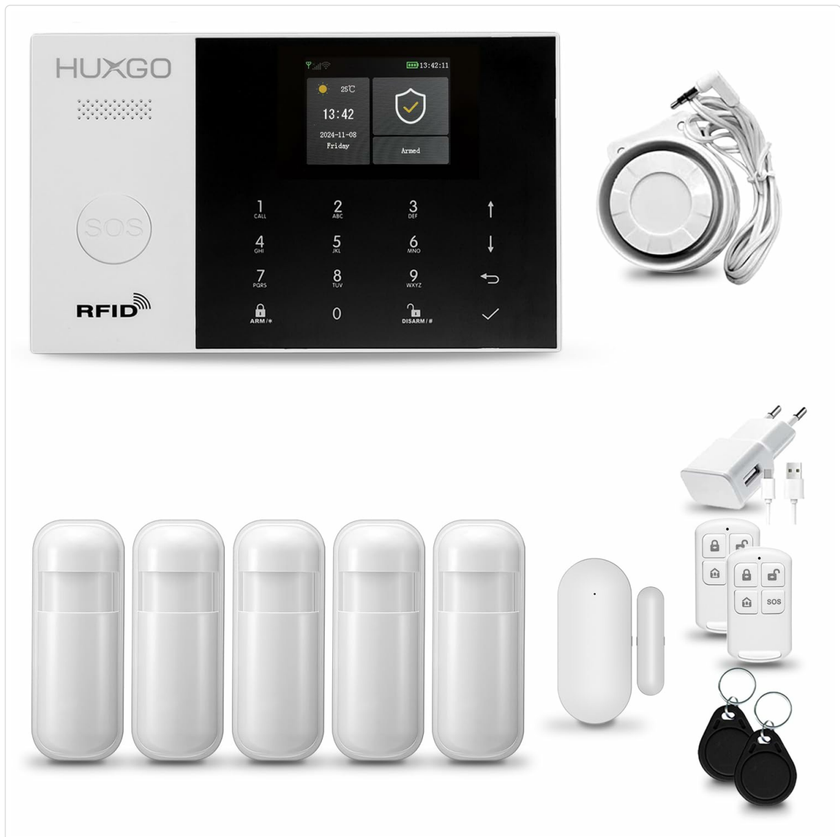
Image: Front view of the HUXGO HXA005 control panel, showing the touchscreen display, numeric keypad, and RFID reader.

supports both WiFi and GSM 4G LTE connectivity for reliable communication.