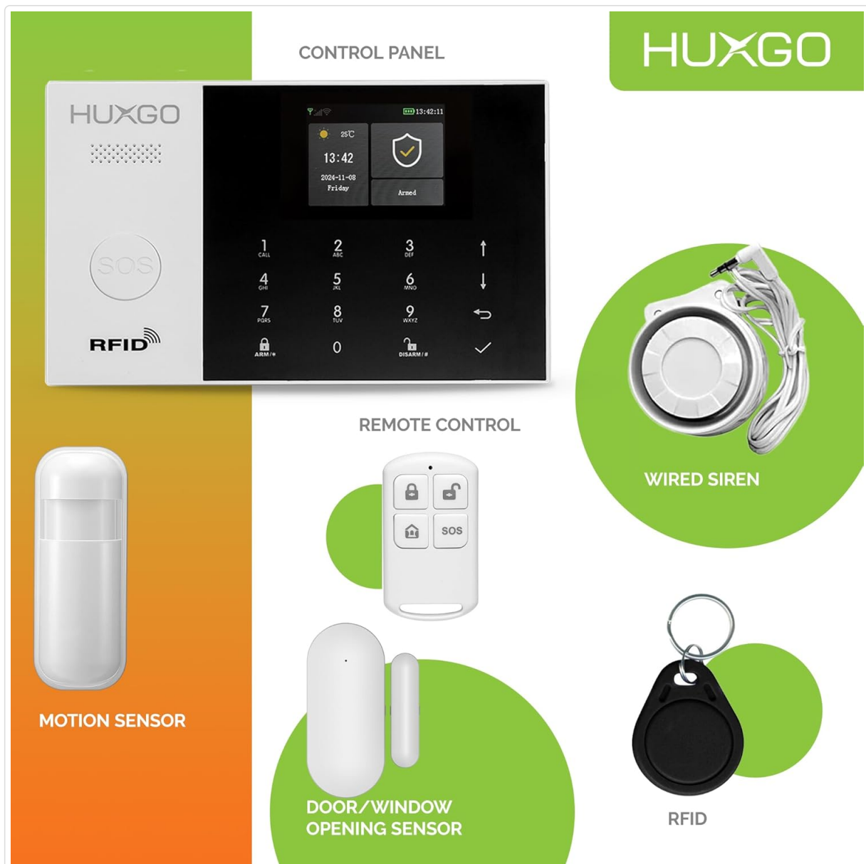
Image: Overview of the HUXGO HXA005 alarm system components, including the control panel, motion sensor, door/window sensor, remote control, wired siren, and RFID tag.