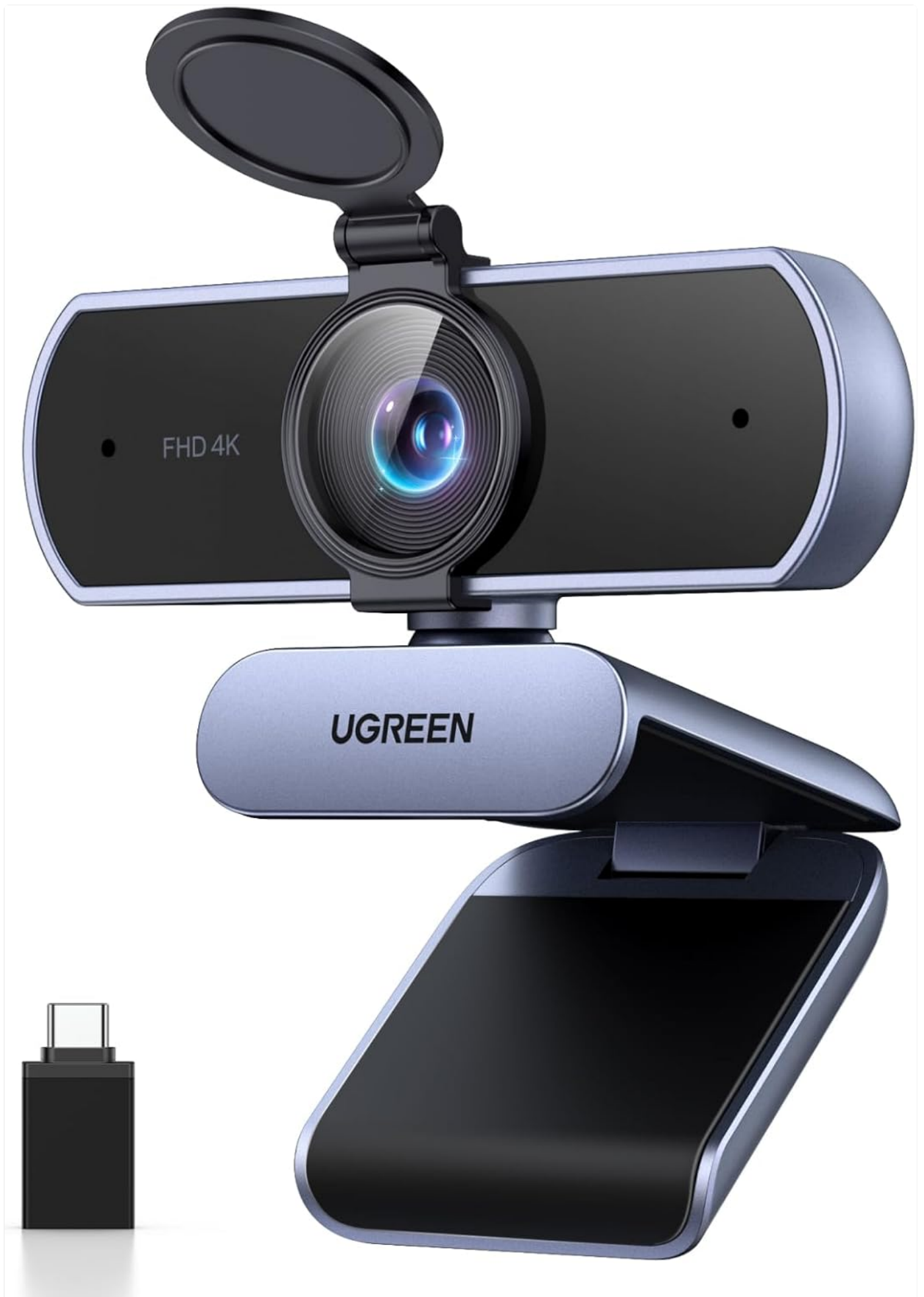
Image: The UGREEN 4K Webcam, showcasing its sleek design, integrated privacy cover, and included USB-A to USB-C adapter.