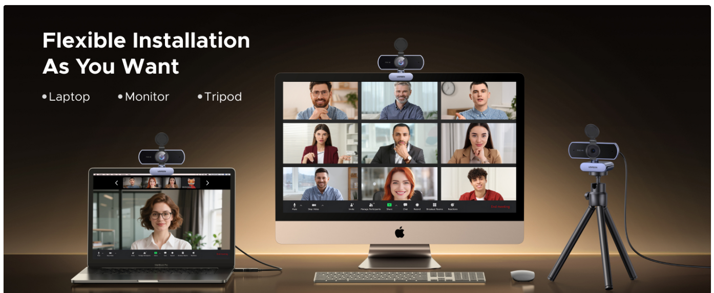
Image: Demonstrates the webcam's versatile installation options, including mounting on a laptop, a desktop monitor, and a tripod.