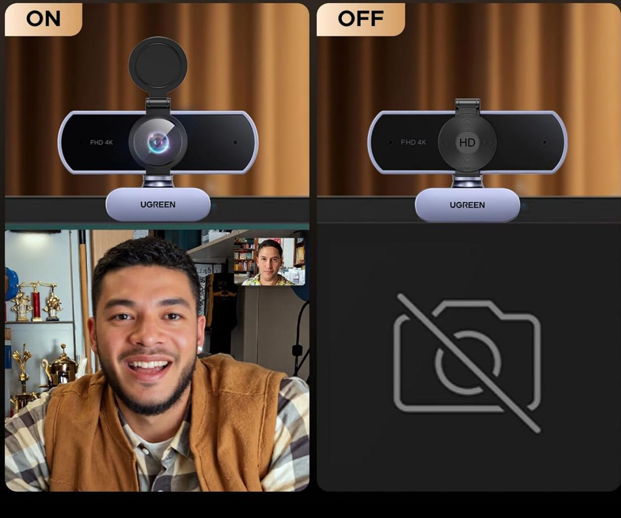
Image: A split image showing the webcam with its privacy cover in the open (ON) and closed (OFF) positions, demonstrating its privacy function.