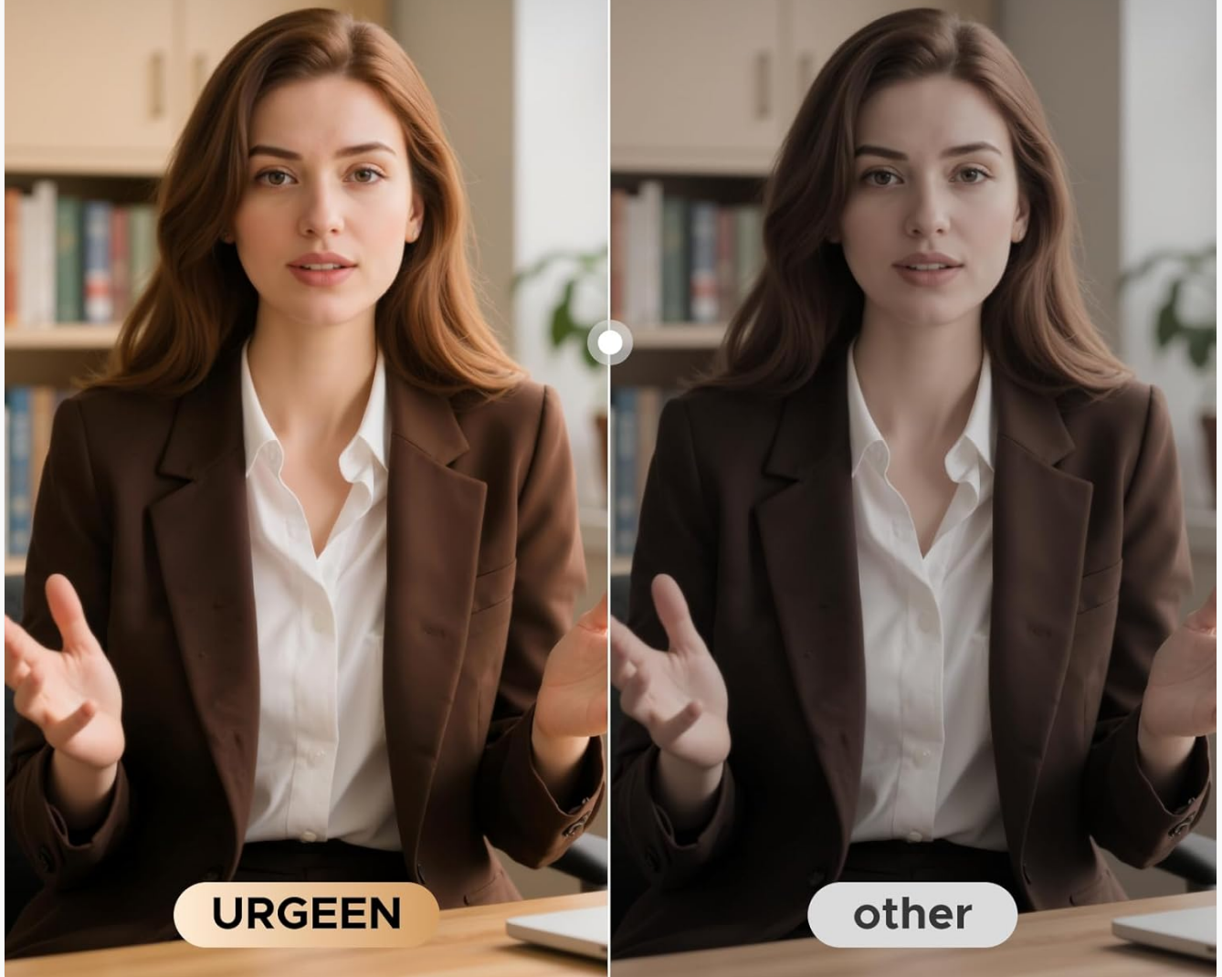
Image: A side-by-side comparison showing how UGREEN's automatic light correction improves image quality in challenging lighting conditions versus a standard webcam.

True-to-life picture, look better and brighter