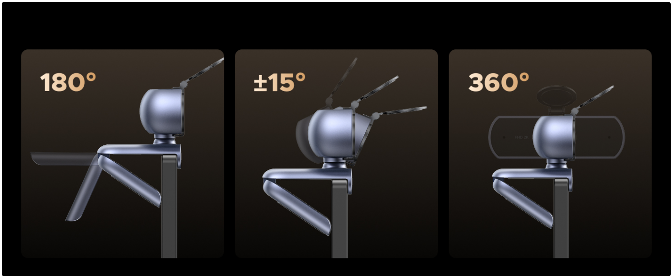
Image: A diagram illustrating the webcam's adjustable features, including 180-degree base rotation, \pm 15 -degree vertical tilt, and 360-degree horizontal rotation for finding the perfect angle.