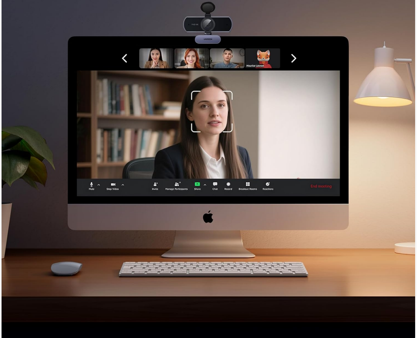
Image: A monitor displaying a video call with the webcam's autofocus actively tracking a person's face, ensuring constant clarity.