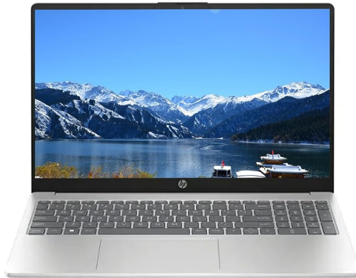
HP 15.6" Laptop