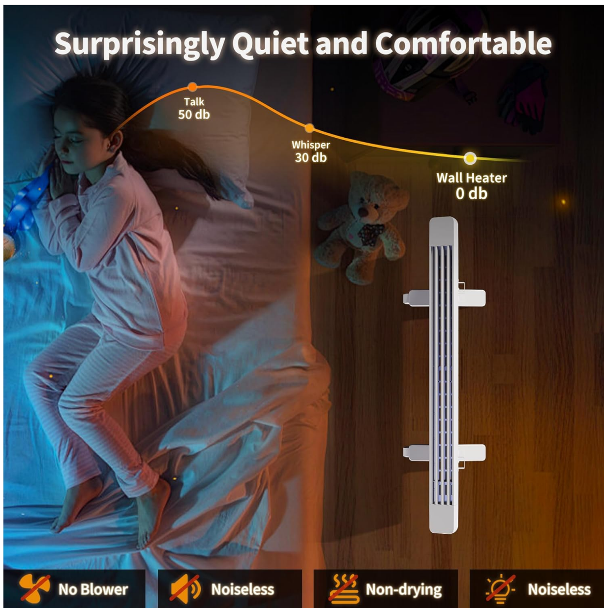
Image: A graphic demonstrating the heater's noiseless operation (0 dB) compared to typical sound levels like talking (50 dB) and whispering (30 dB).