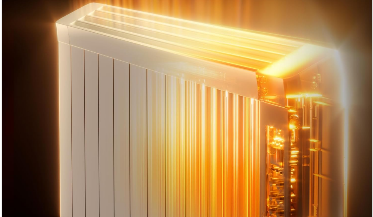
Image: Illustration of the heater's internal structure, emphasizing multi-layer extended fins for higher heating efficiency.