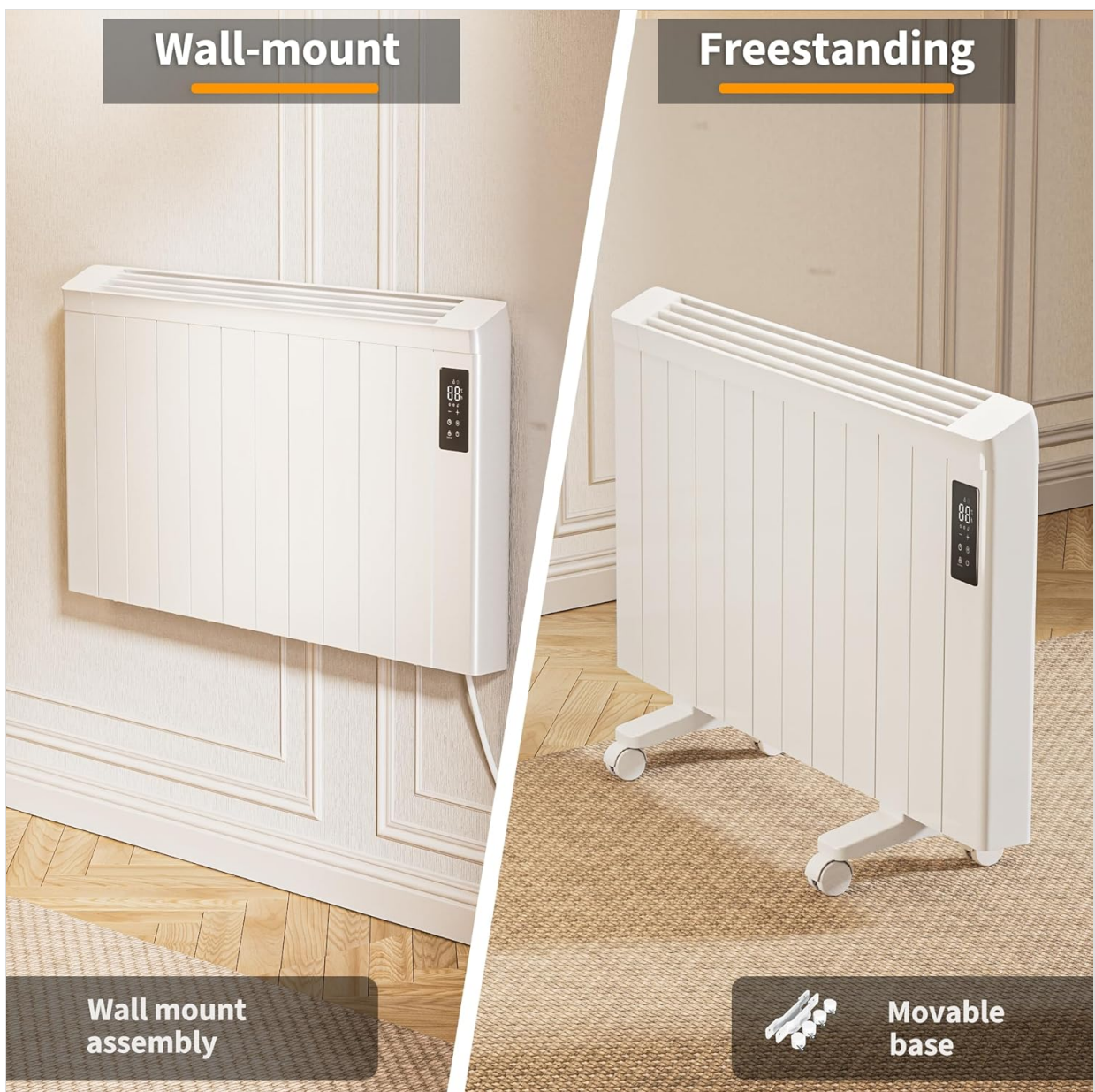
Image: The heater displayed in both wall-mounted and freestanding configurations, illustrating its versatility.