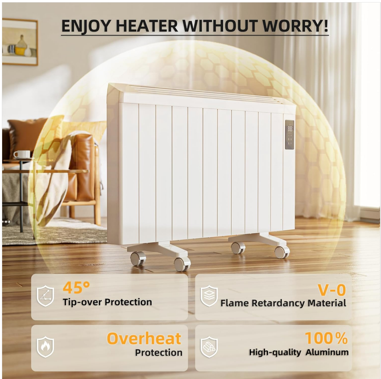
Image: The Fierscial Convection Panel Heater highlighting its 45° Tip-over Protection, V-0 Flame Retardancy Material, Overheat Protection, and 100% High-quality Aluminum construction.