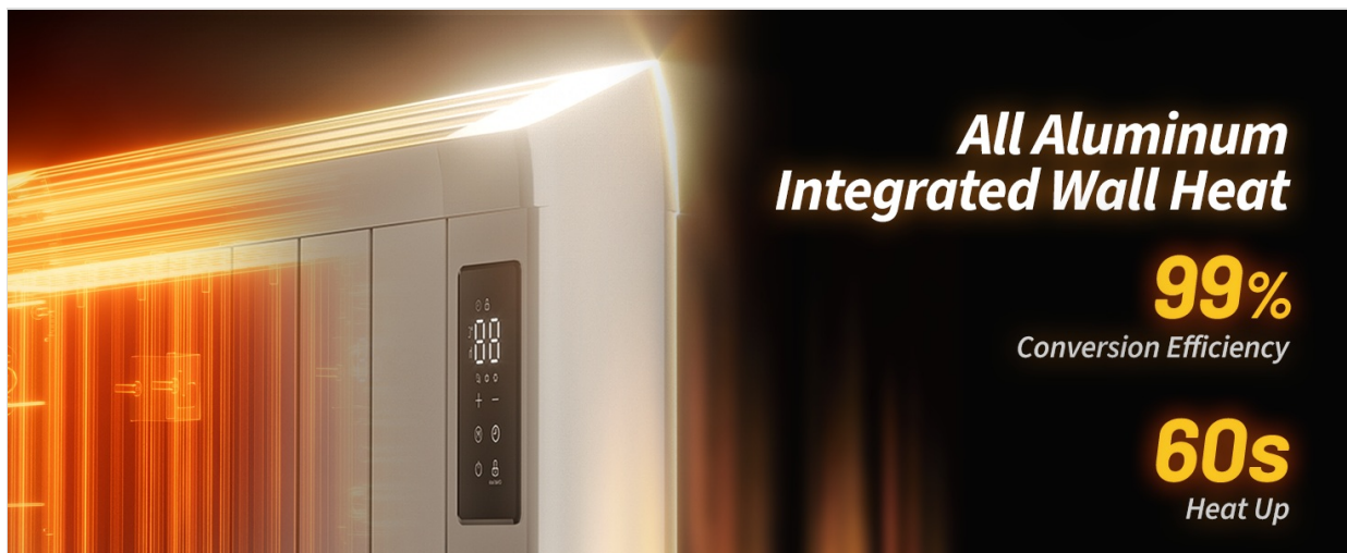
Image: Detailed view of the heater's touch control panel and the remote control, showing various function buttons.

To activate the child lock, press and hold the lock button on the control panel or remote for a few seconds. This will disable all other buttons, preventing accidental changes to settings. Repeat the action to unlock.