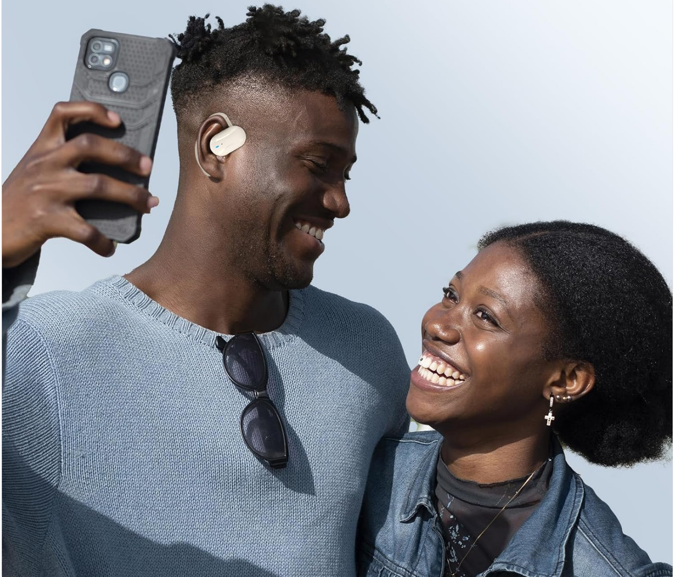
Image: A person wearing the SIXTHGU V8 Open-Ear Headphones, demonstrating the secure and comfortable fit around the ear.