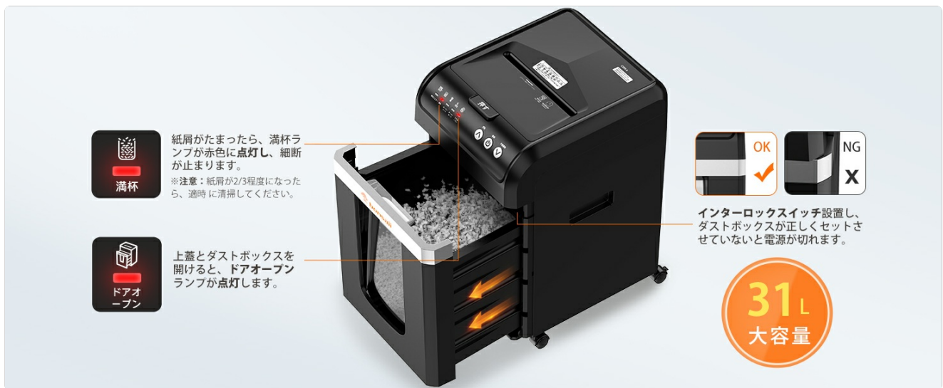
Image: Waste bin and associated indicators.