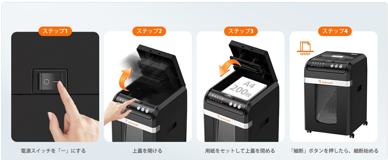
Image: Step-by-step guide for initial setup and operation.