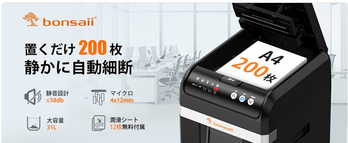
Image: Key features of the bonsai C283-A shredder.