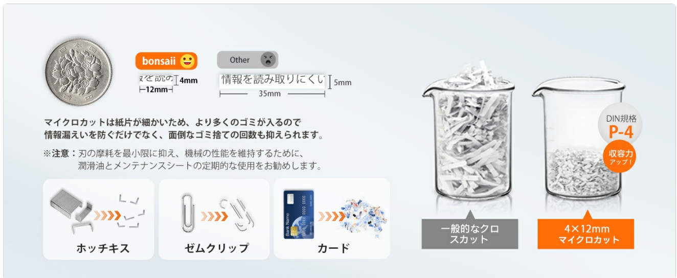
Image: Micro-cut size comparison and acceptable items for shredding.