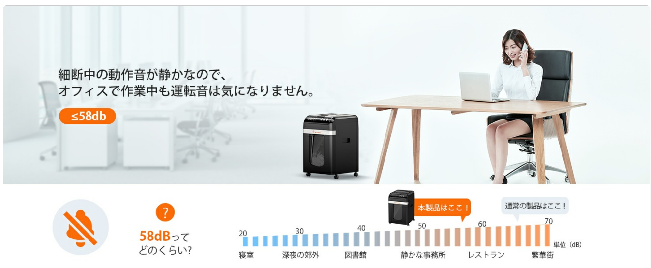
Image: The shredder's quiet operation in an office setting.