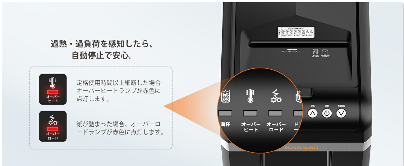
Image: Control panel indicators for various operational states.