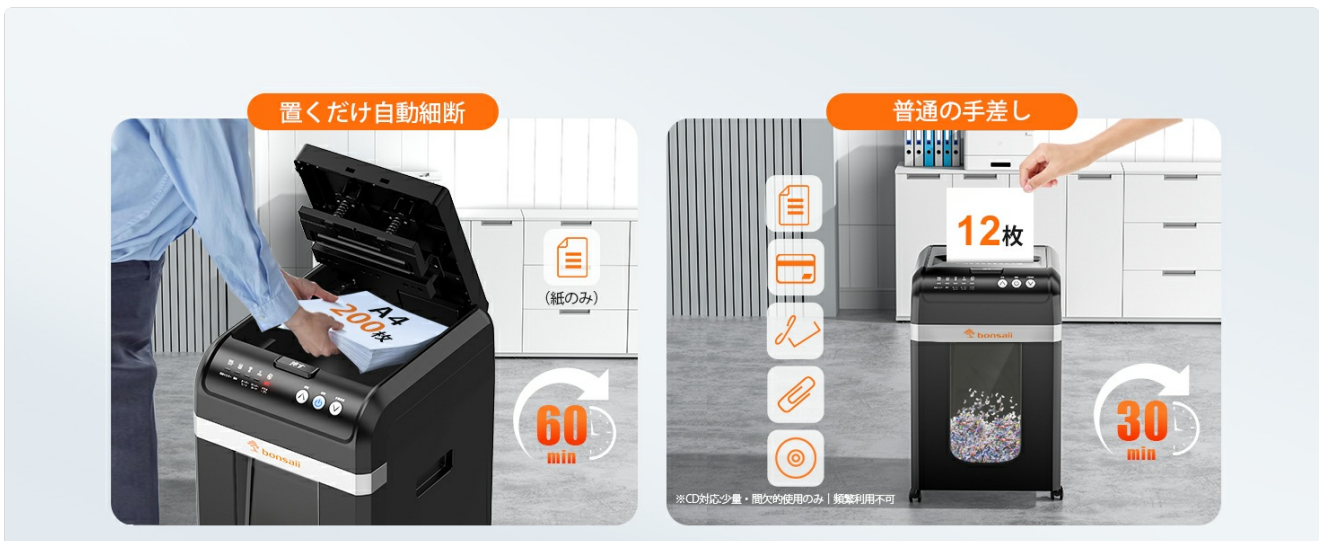
Image: Visual comparison of auto-feed and manual feed capabilities.

Video: Demonstration of the bonsai C283-A shredder's automatic and manual feed functions, including shredding paper, staples, and credit cards, and emptying the waste bin.