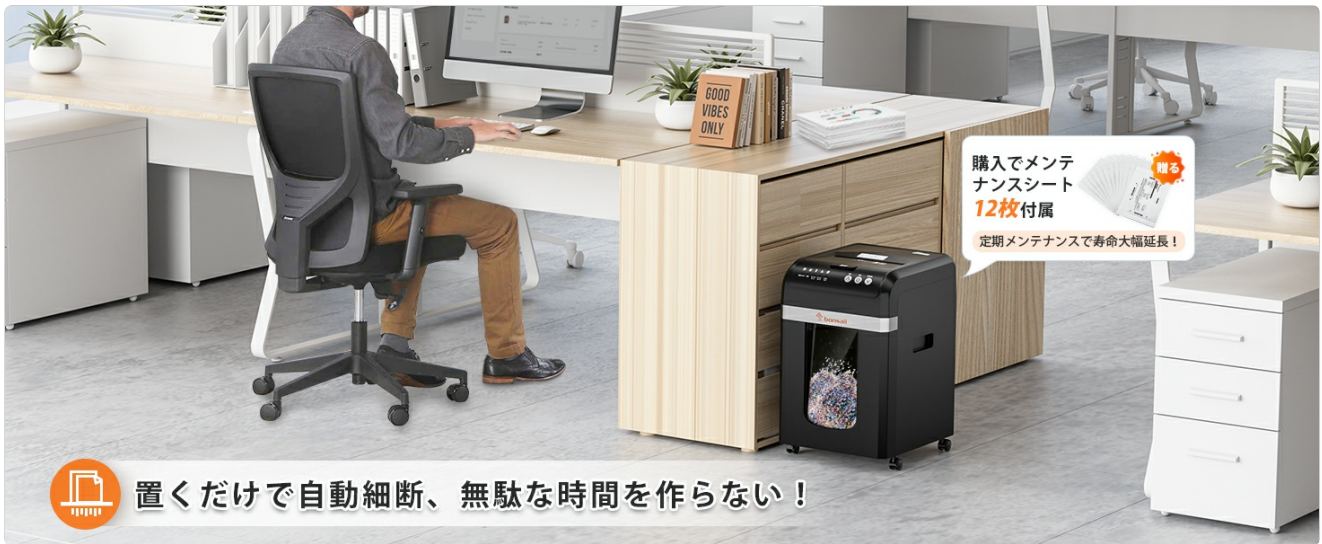
Image: The shredder in an office, emphasizing the use of maintenance sheets.