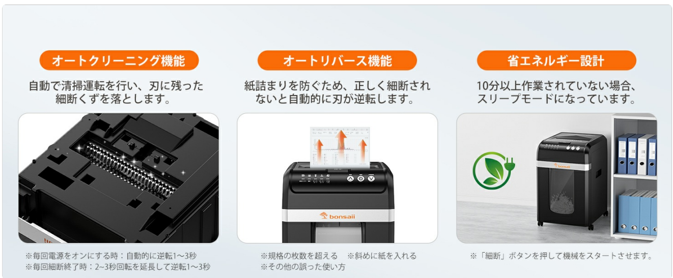
Image: Details on auto-cleaning, auto-reverse, and energy-saving features.