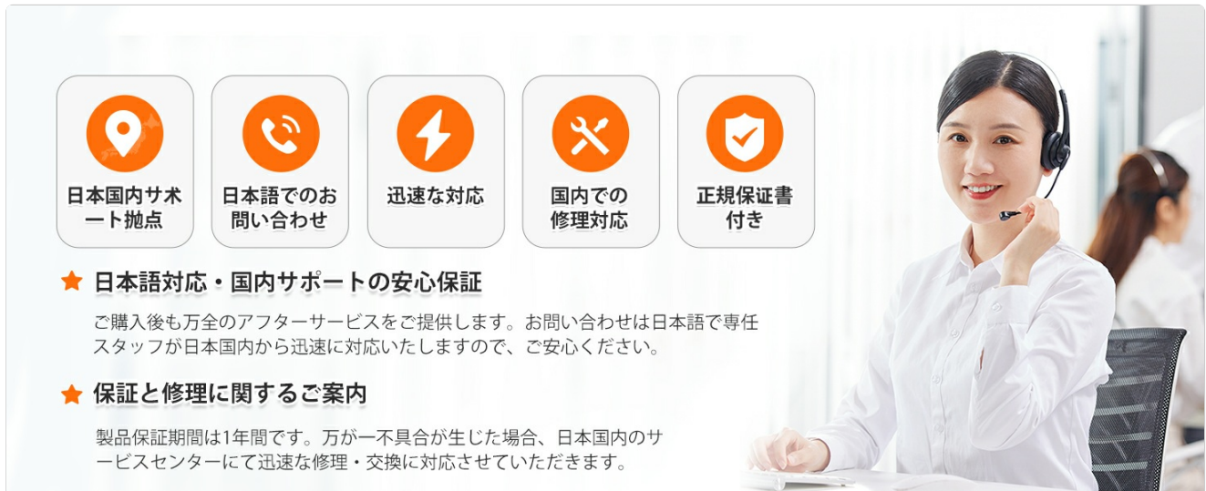
Image: Information regarding bonsaii's warranty and customer support services.

For support, please refer to the contact information provided with your product or visit the official bonsaii website.