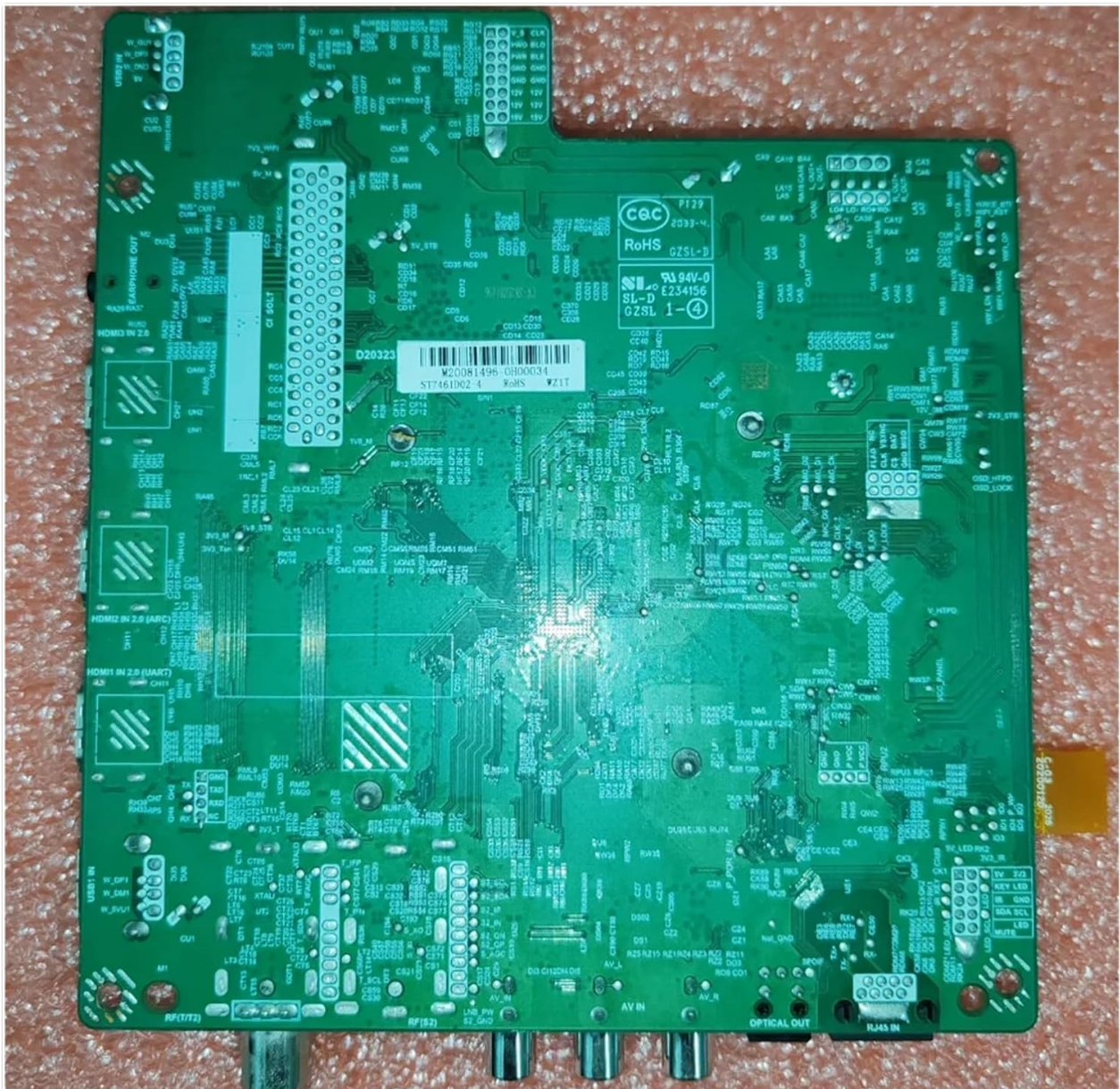
Figure 3.2: Back view of the TD.MT9612.795 TV Motherboard. This image illustrates the intricate circuit traces and solder points on the reverse side of the board, essential for its functionality.