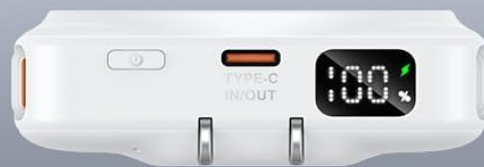
Image: A diagram illustrating the various features of the power bank, including the iPhone cable, wireless charging pad, USB-C port, Type-C cable, foldable stand, foldable AC plug, and LED display.