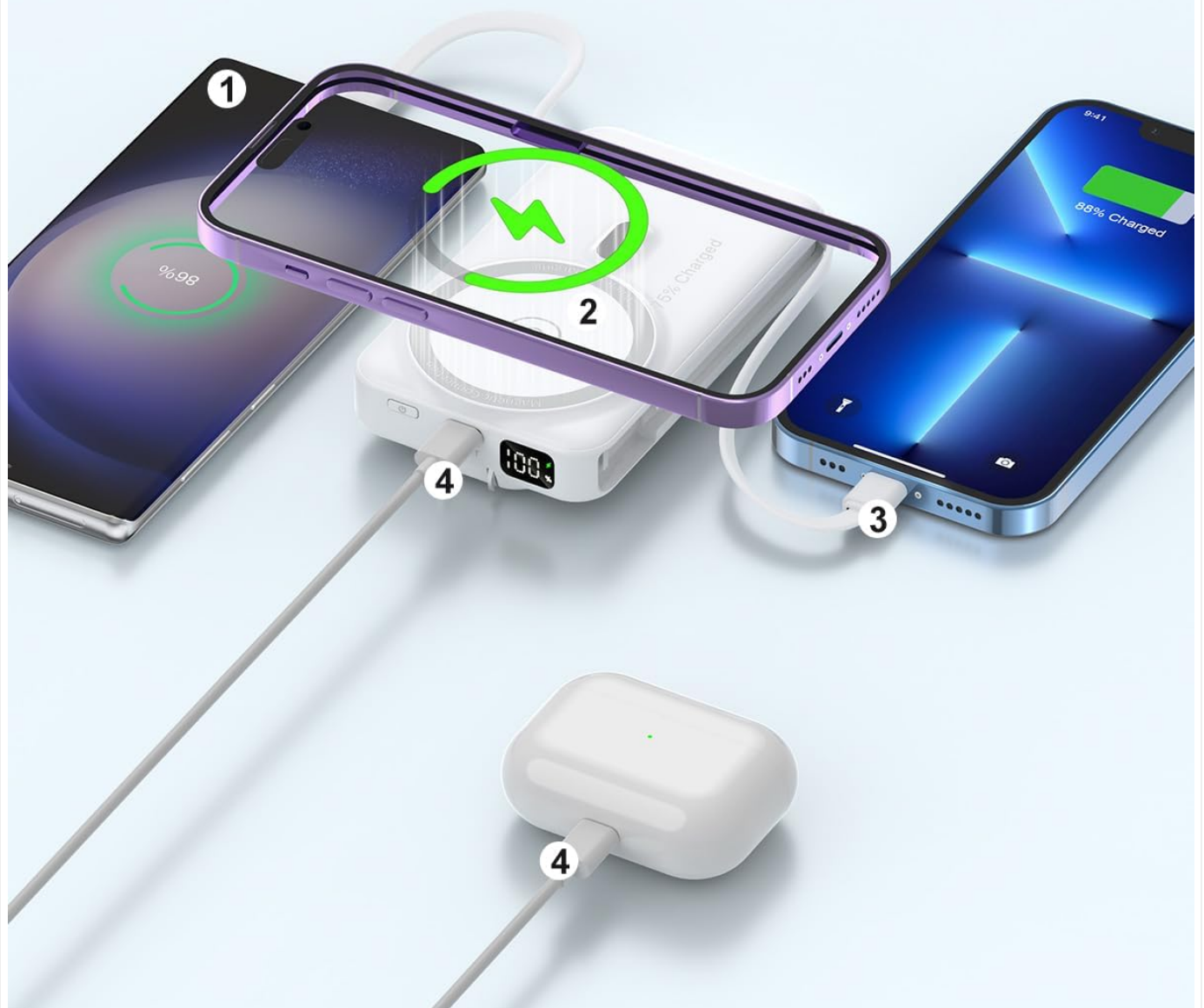
Image: A visual demonstration of the power bank charging four different devices (two phones, one earbud case) using its various output methods simultaneously.