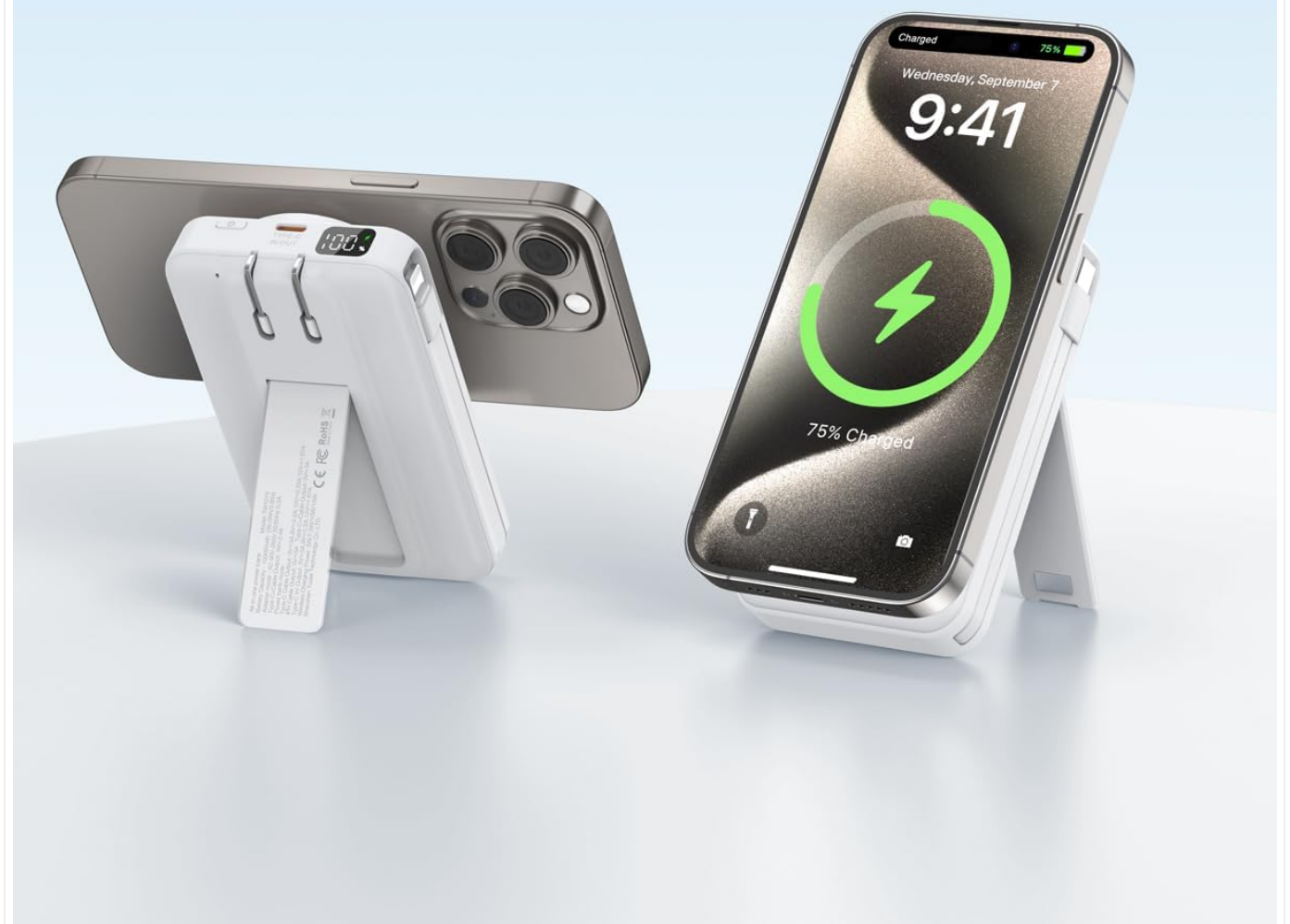
Image: The power bank with its foldable stand extended, supporting a smartphone in both vertical and horizontal orientations.