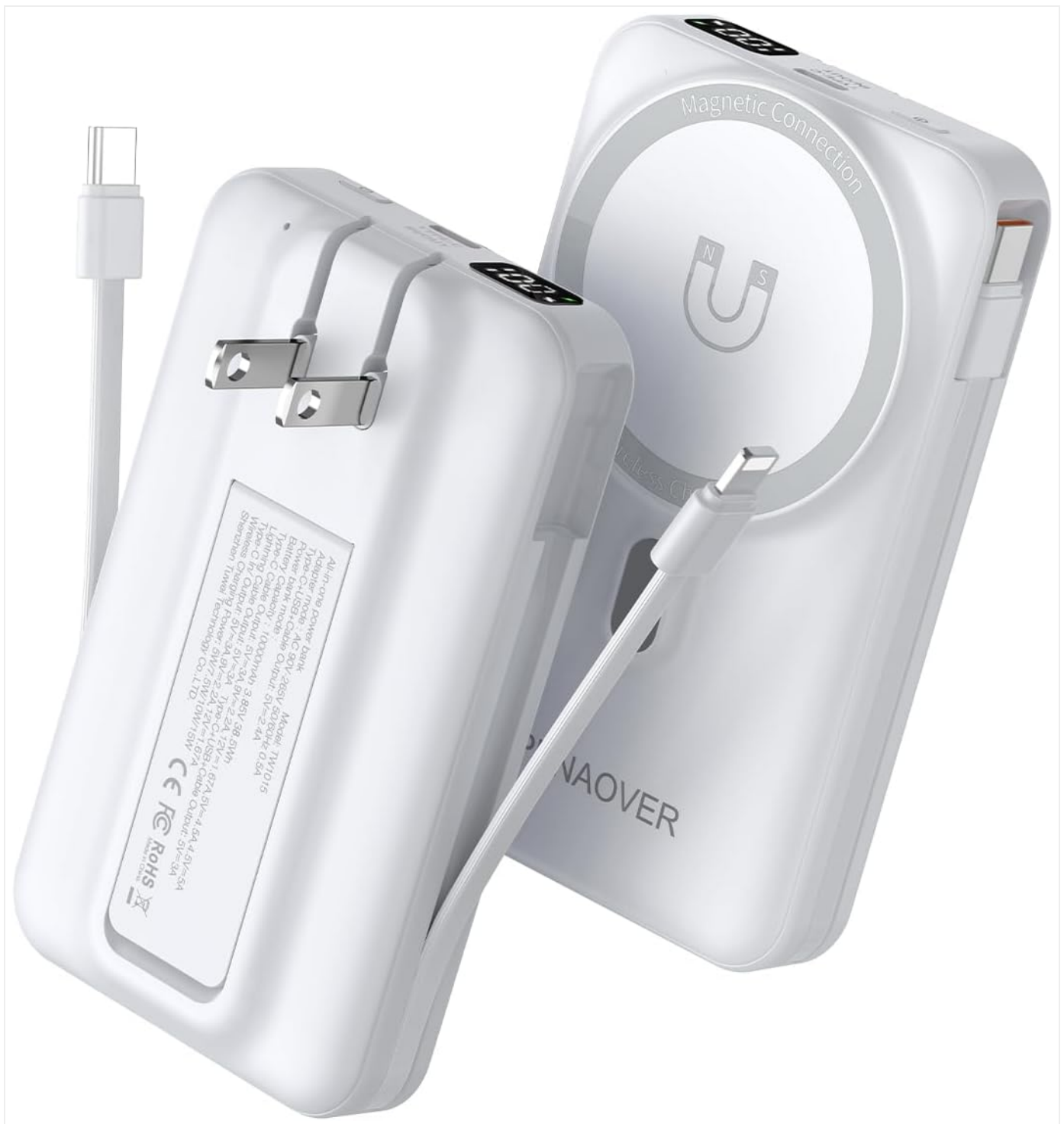
Image: The penaover Magnetic Power Bank, Model TW1015, showcasing its compact design with integrated cables and a foldable AC wall plug.