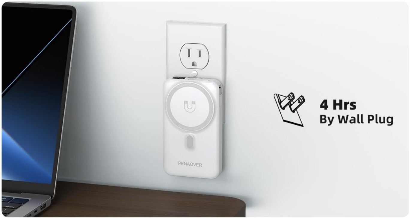
Image: Visual representation of recharging the power bank using its integrated AC wall plug or a USB-C cable, with estimated charging times.