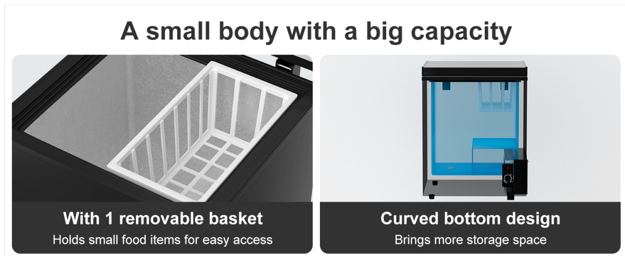
Image: An illustration showing the interior of the freezer with a removable basket for organizing small food items and a curved bottom design for increased storage capacity.