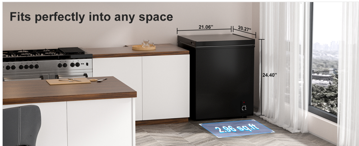
Image: The freezer positioned in a kitchen, illustrating its compact dimensions (21.06"W x 20.27"D x 24.4"H) and minimal space requirement.