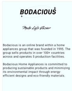
Image: An icon representing customer satisfaction, indicating BODACIOUS's commitment to service.

If you have any questions or require assistance with your BODACIOUS 3.5 Cubic Feet Chest Freezer, please do not hesitate to contact our professional support team. We are ready to answer your questions before or after your purchase.