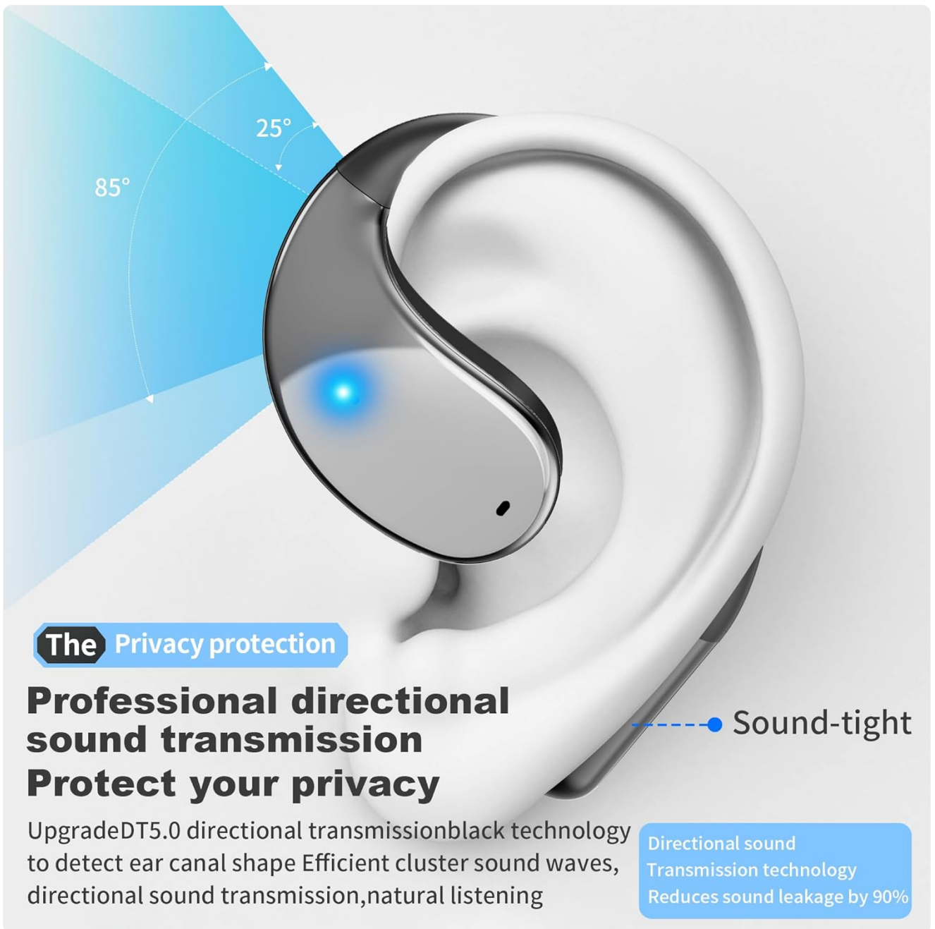
Figure 5.3: The comfortable open-ear design for extended wear.