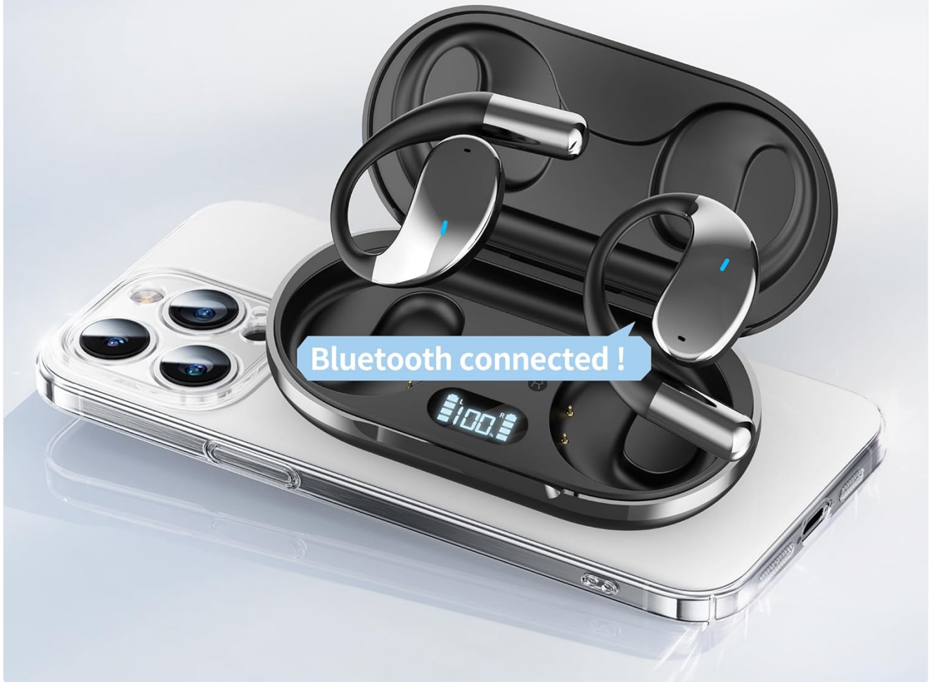
Figure 3.1: Earbuds in charging case showing digital battery display and Type-C port.