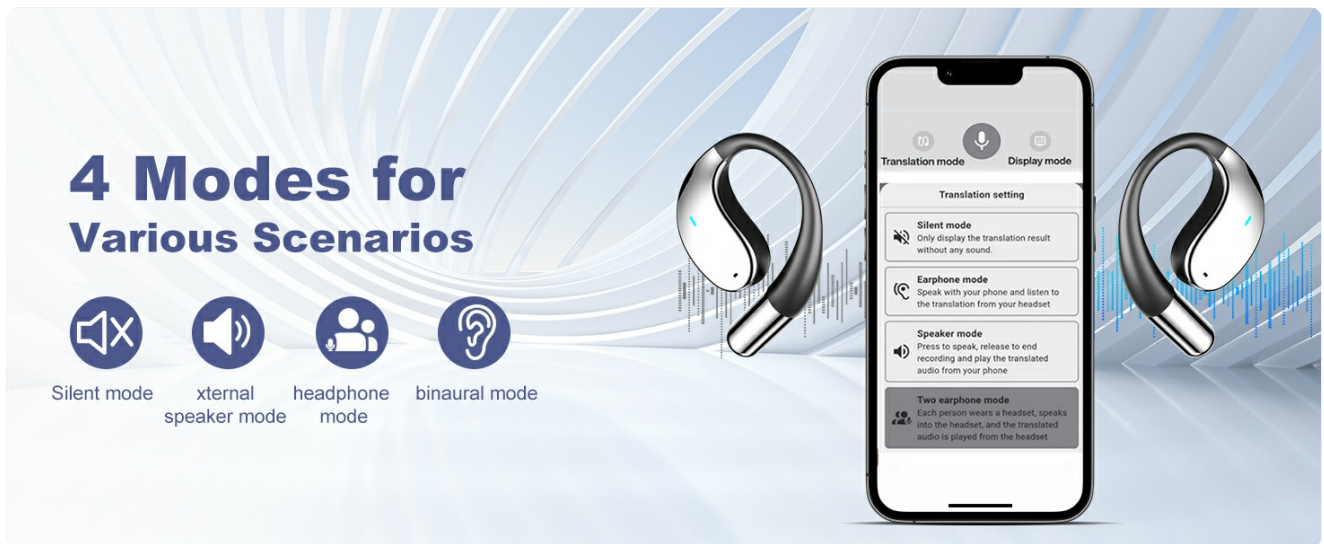
Figure 4.1: Overview of the four translation modes available in the Ear Dance app.