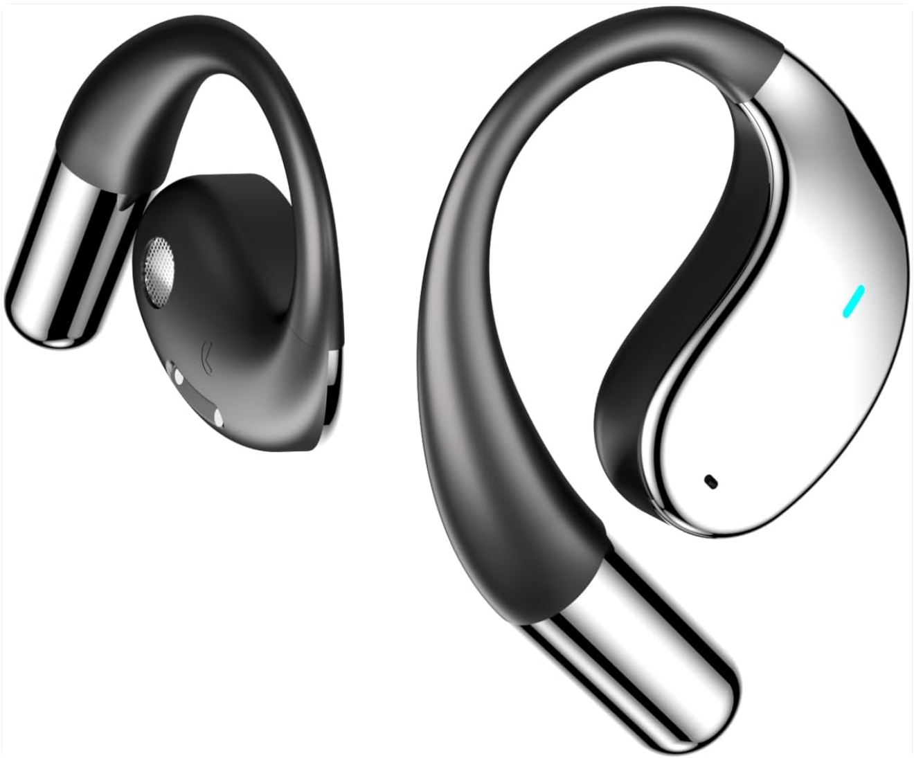
Figure 1.1: ADYOOM AI Language Translator Earbuds and Charging Case.