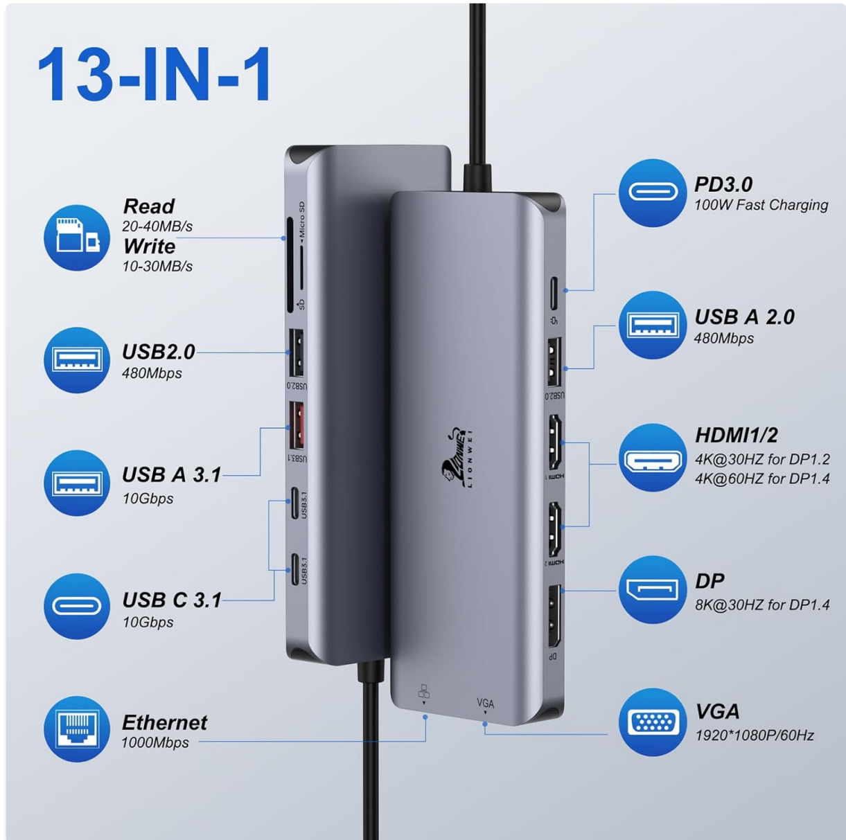
Overview of the 13-in-1 port configuration and specifications.