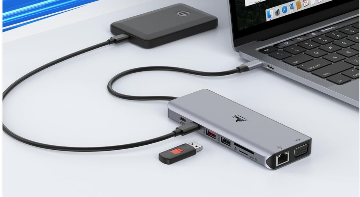
High-speed data transfer capabilities up to 10Gbps.