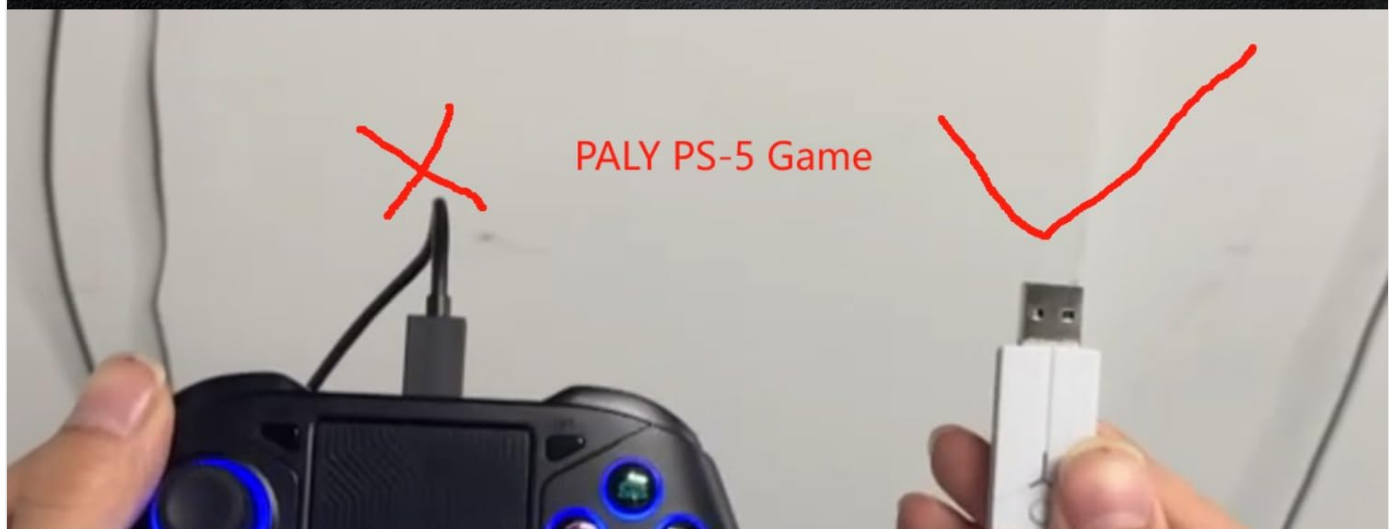
Image: A three-step visual guide demonstrating how to pair the controller with a PS5 console using the USB adapter.