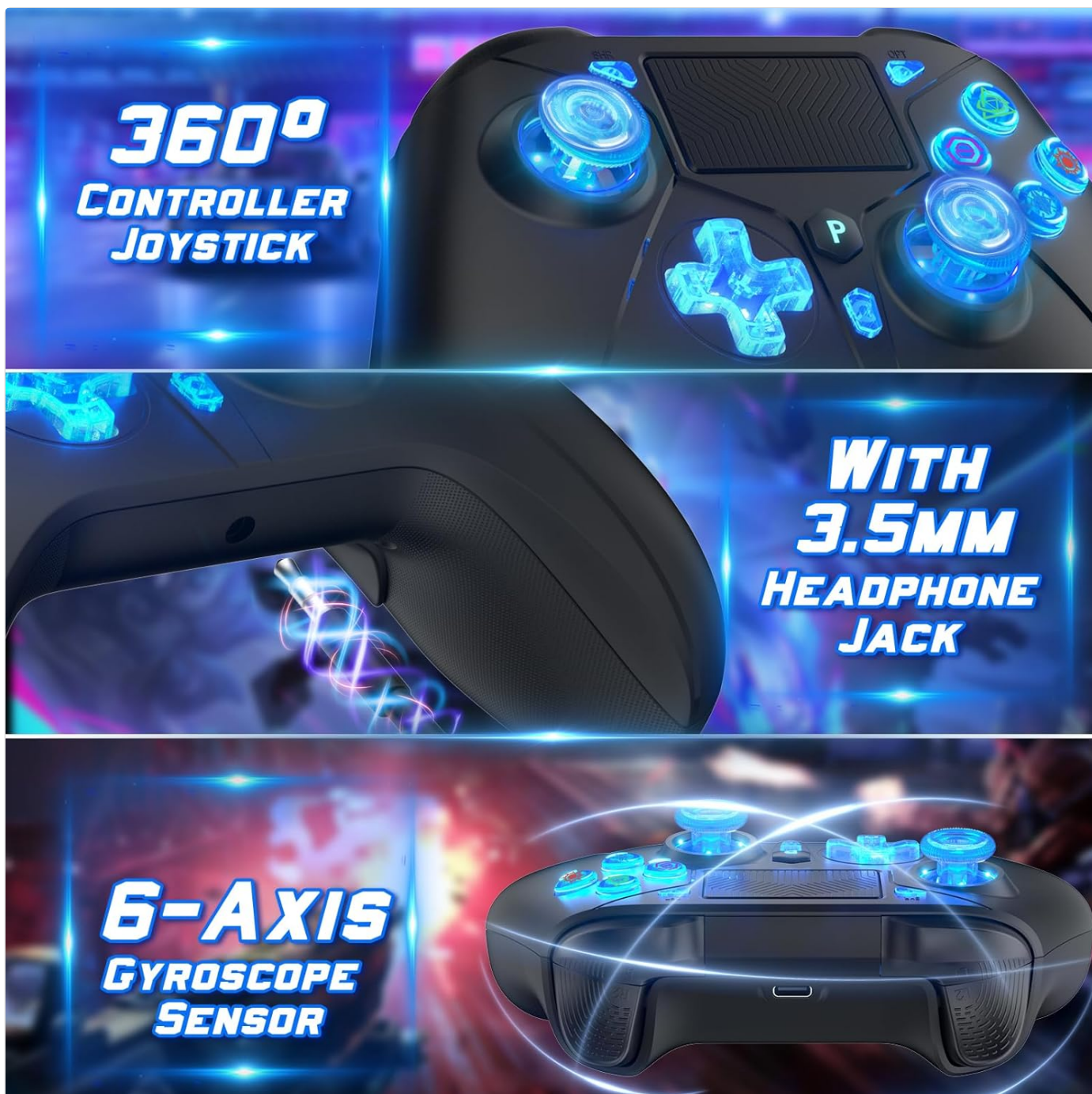
Image: Close-up views highlighting the controller's 360-degree joysticks, 3.5mm headphone jack, and 6-axis gyroscope sensor.