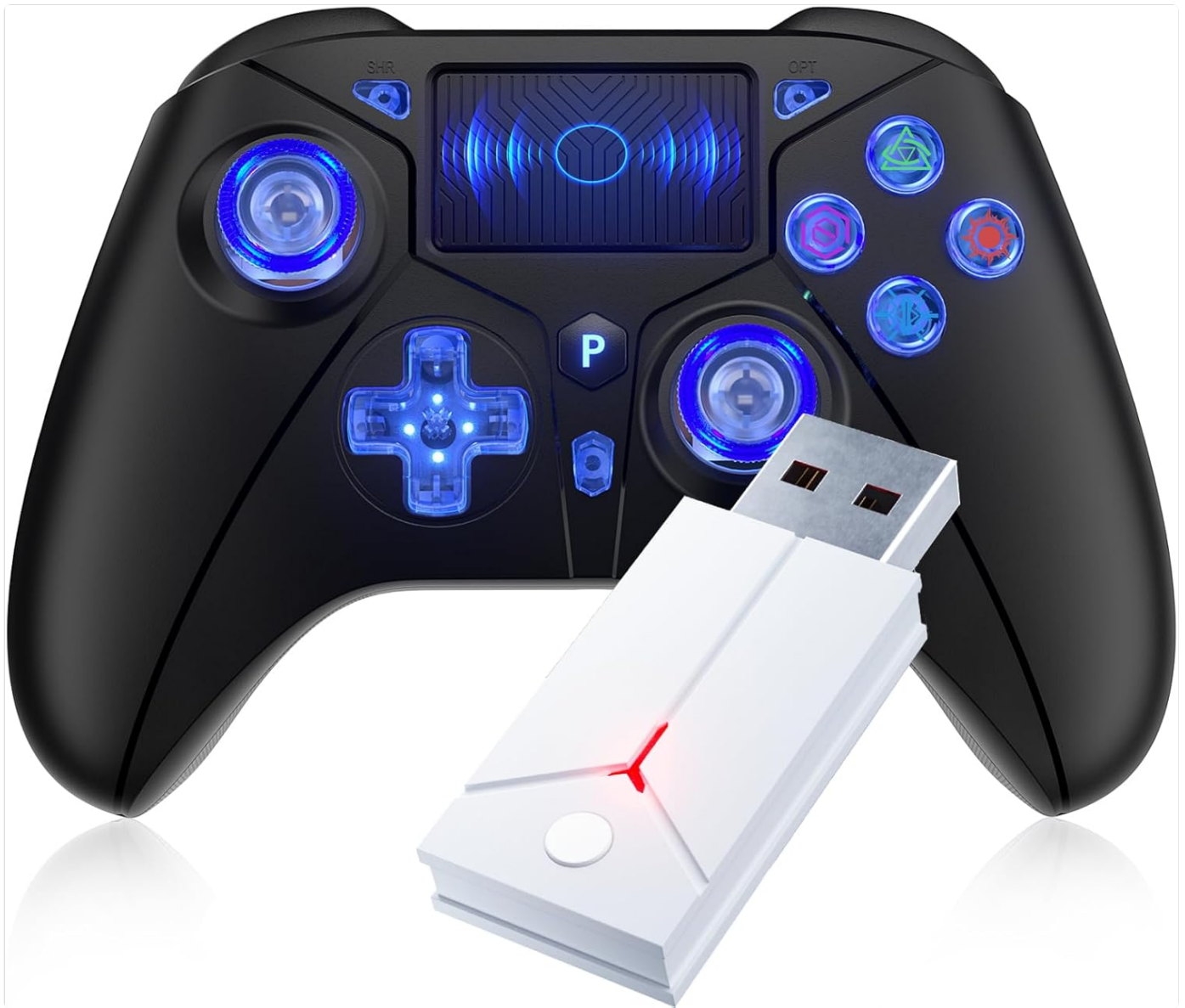
Image: The Bonacell Wireless Controller, black with blue illuminated buttons, shown alongside its white USB receiver adapter.