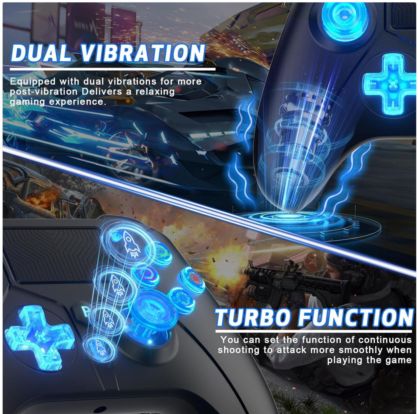
Image: An illustration highlighting the dual vibration motors and the Turbo function capability of the controller.

Specific instructions for activating and deactivating the Turbo function are typically found in the game's control settings or may involve a combination of the Turbo button (if present) and another action button. Refer to the controller's quick start guide or product packaging for exact button combinations if not detailed here.