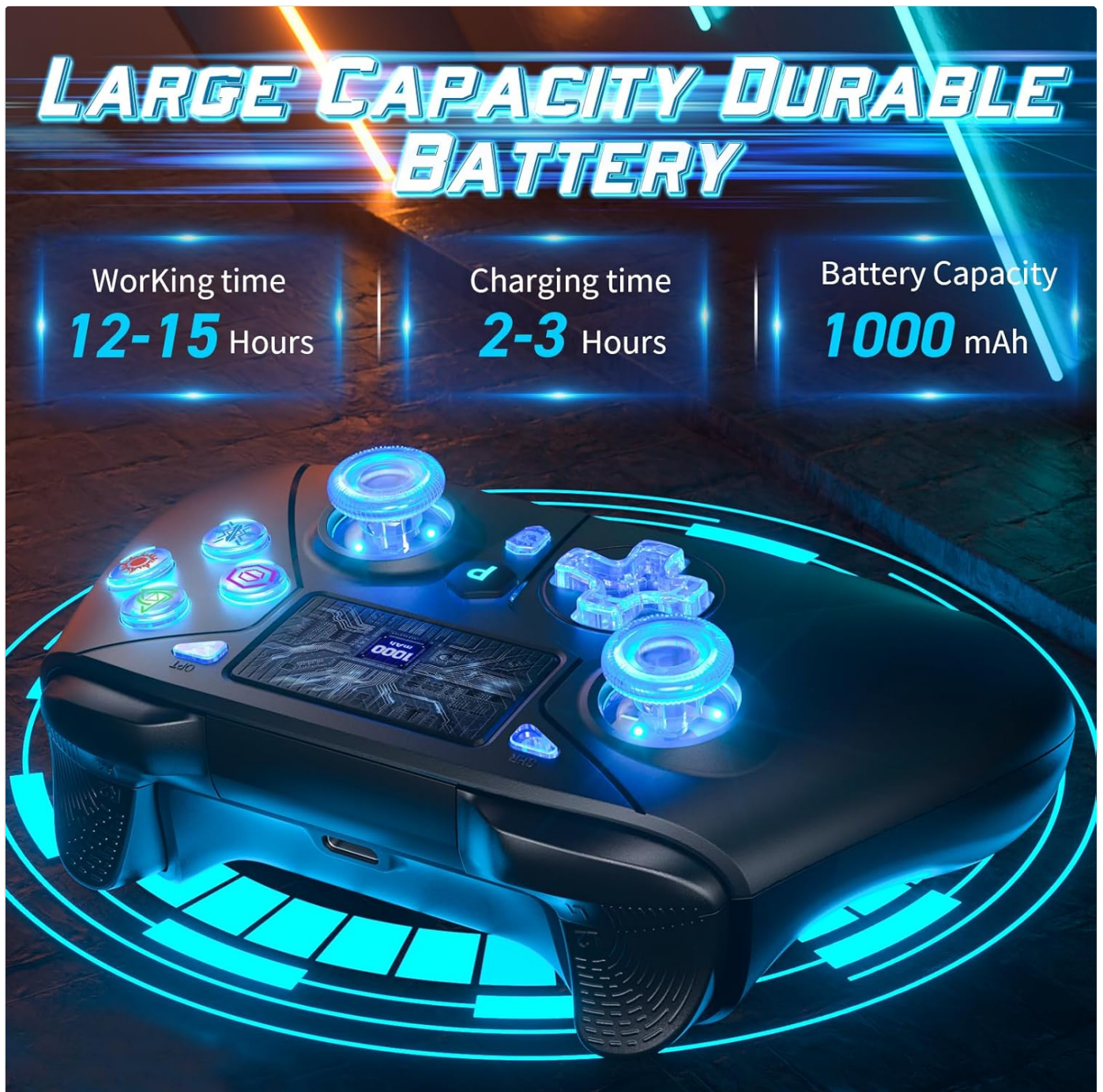
Image: Visual representation of the controller's battery specifications, including its 1000mAh capacity, working time, and charging duration.