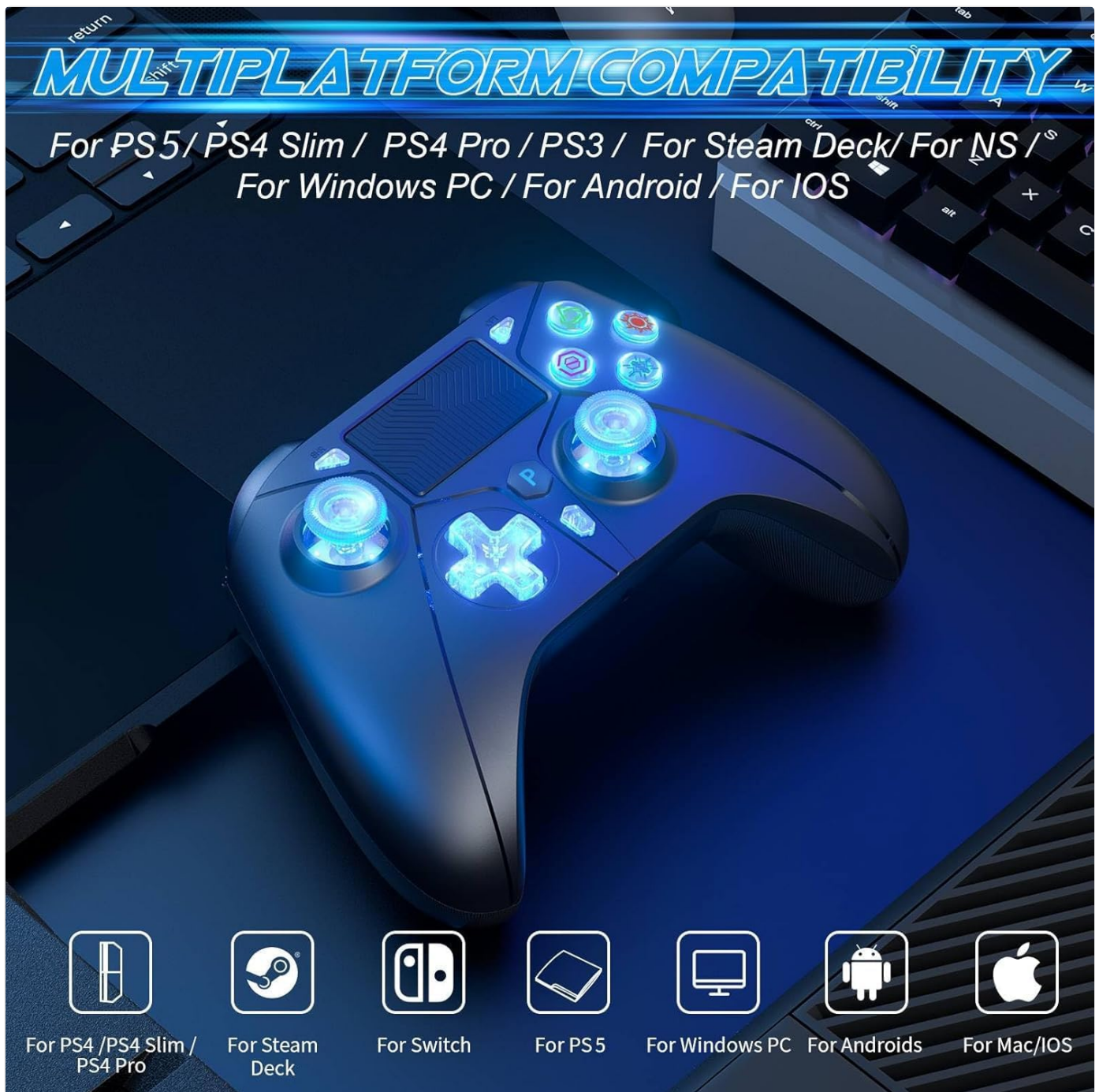
Image: An illustration showing the Bonacell Wireless Controller's compatibility with various platforms such as PS5, PS4, PC, Android, and iOS.