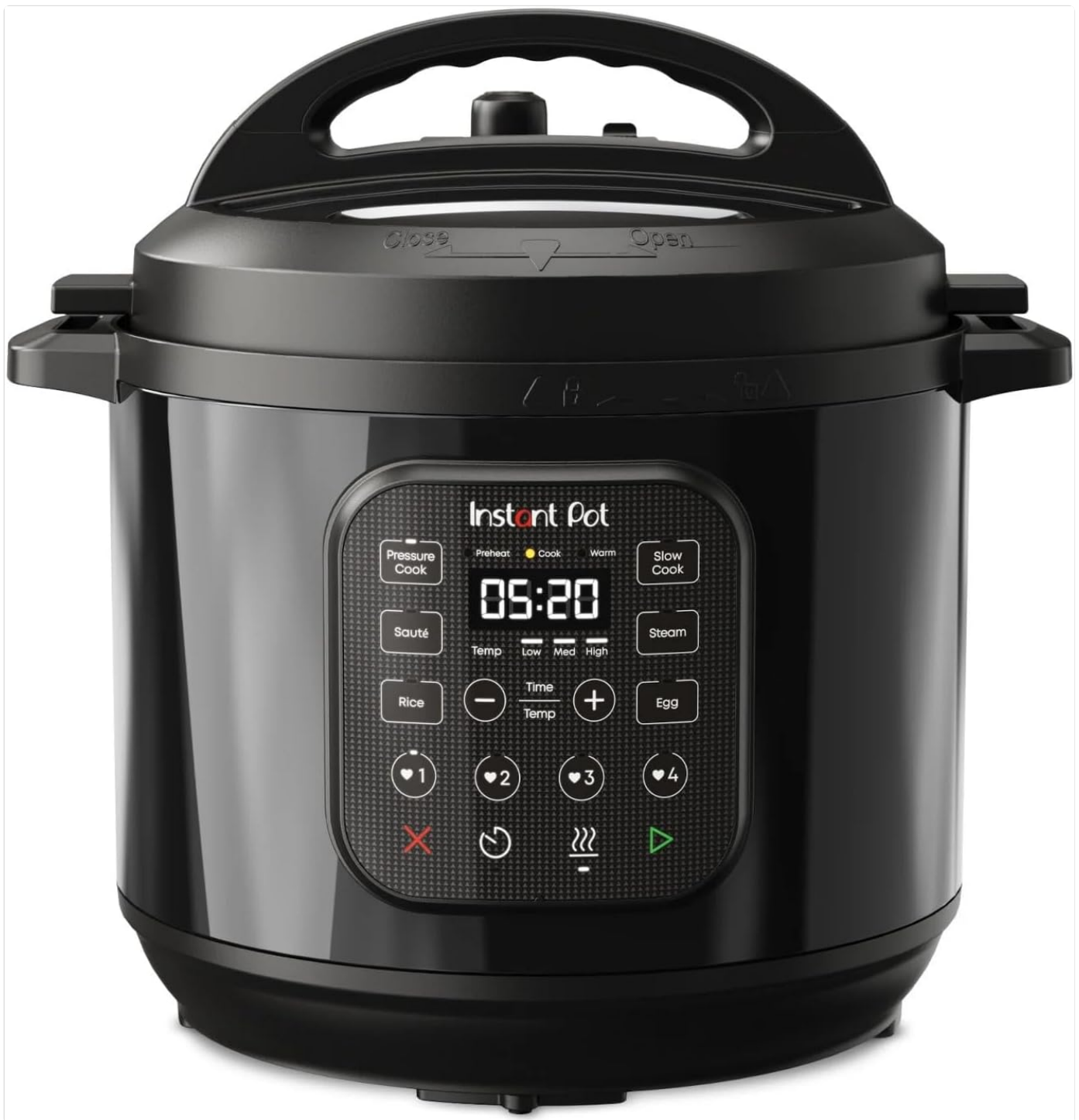
Image 1: Front view of the Generic Instant-Pot Chef Series 8 Qt Multi-Cooker, showing the control panel and lid.

Familiarize yourself with the various parts of your multi-cooker for safe and effective operation.