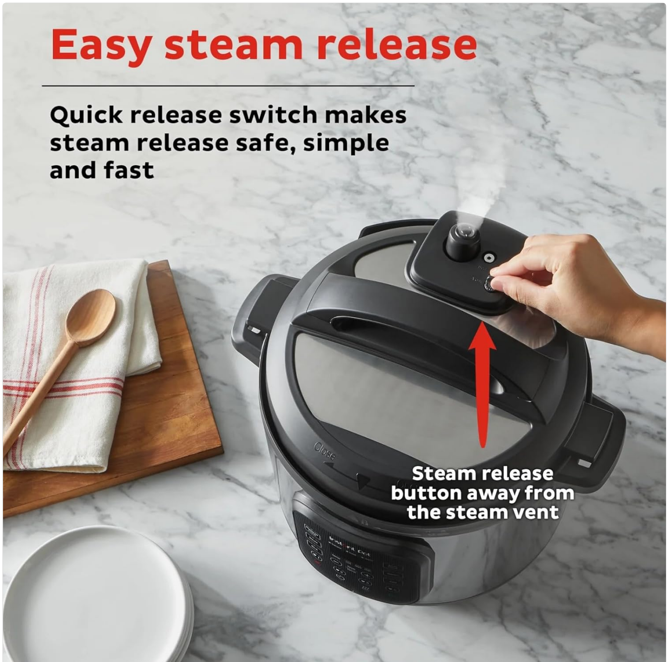
Image 3: Close-up of the lid showing the easy steam release button, designed to keep hands away from the steam vent.