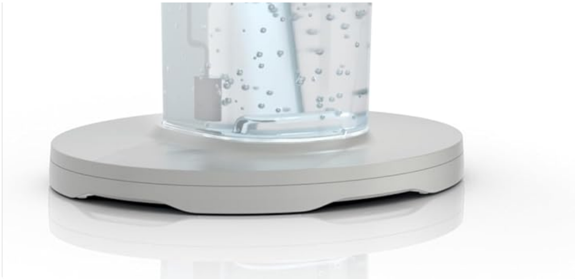
Image: The Shark FlexBreeze Pro Mist Fan fully assembled in pedestal mode, showing the fan head, pole, base, and integrated misting tank.