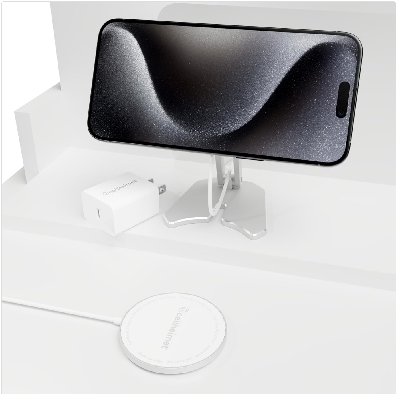
Image: An iPhone being charged wirelessly on the desk stand, with the wall adapter visible.