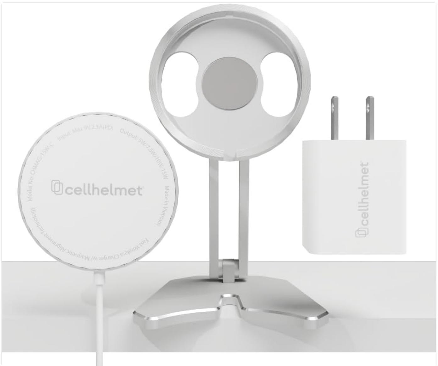
Image: The cellhelmet Power Bundle, featuring the 20W wall adapter, 15W MagSafe-compatible wireless charging pad, and the aluminum desk stand.