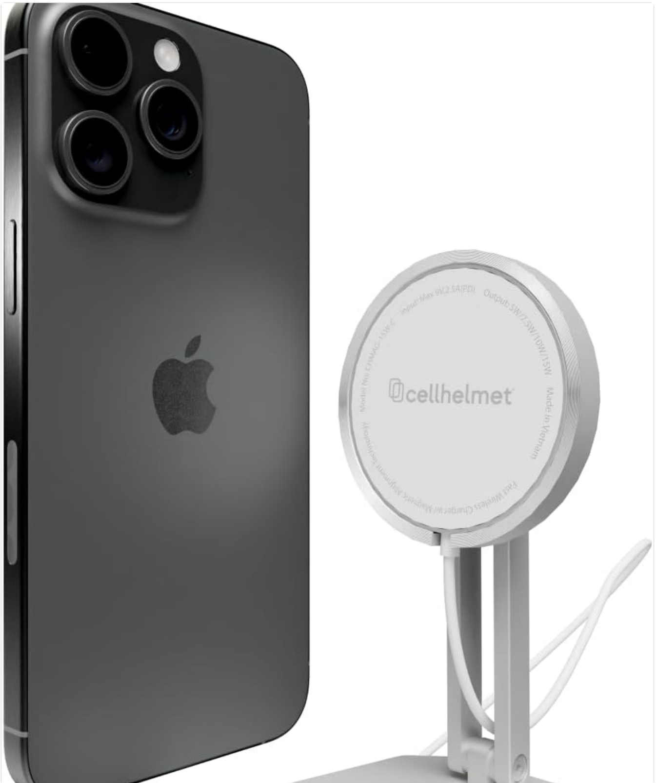
Image: An iPhone attached to the MagSafe-compatible wireless charging pad, demonstrating magnetic alignment.