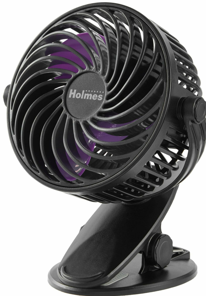
Figure 1: Holmes 4-inch On-The-Go Personal Fan with Clip.