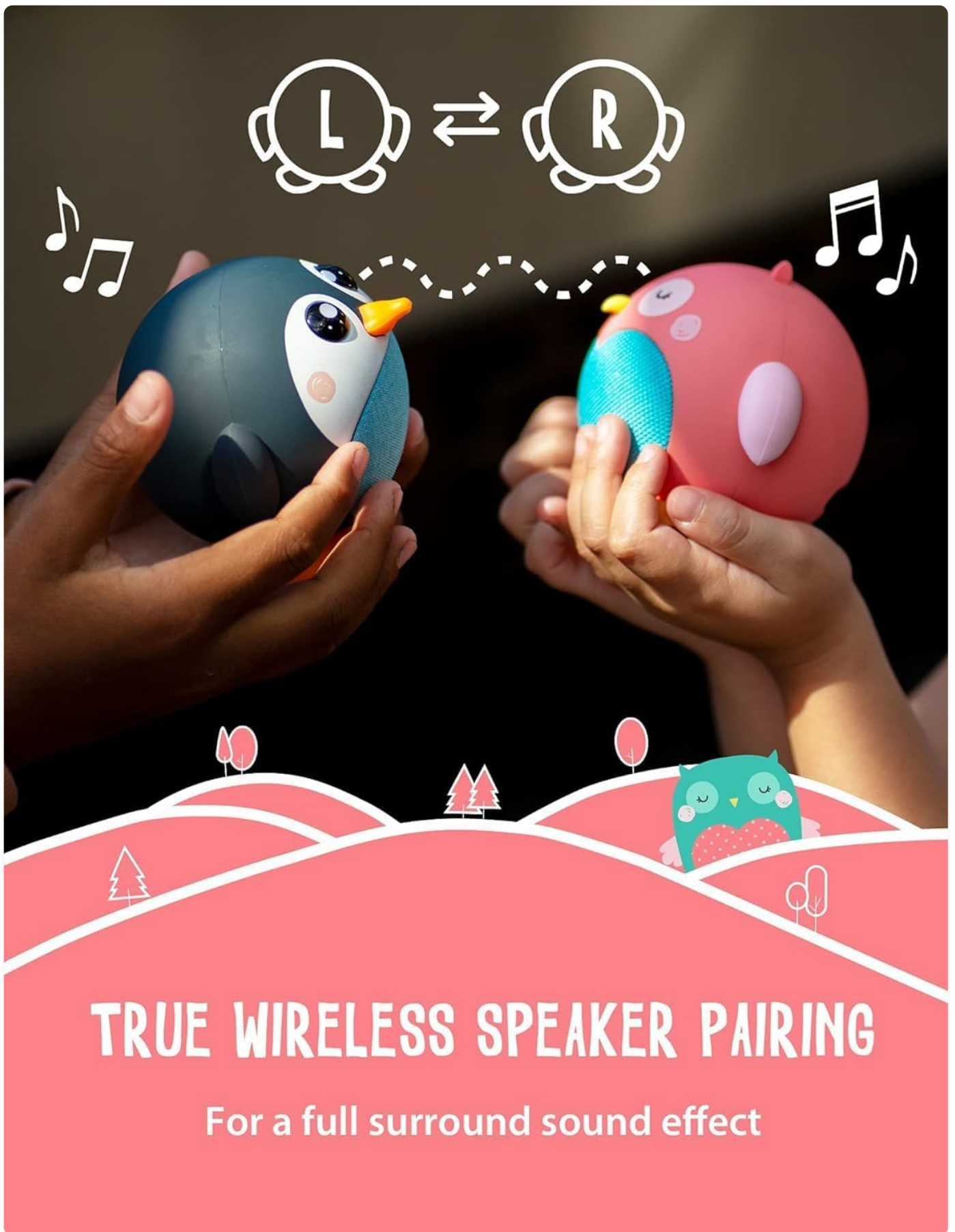
Image: Two Planet Buddies speakers, one Olive Owl and one Penguin, shown wirelessly connected to provide a stereo sound experience.