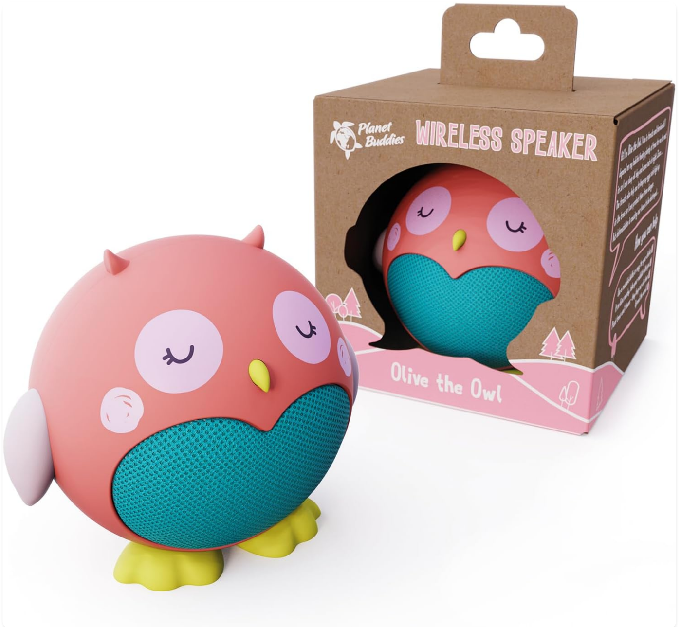
Image: The Olive Owl speaker next to its retail packaging, showing the product and its box contents.