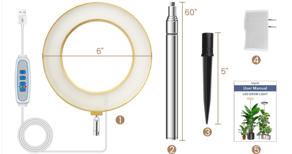
Image showing the contents of the Kullsinss Grow Light package, including the light ring, telescopic rod, ground stake, power adapter, and user manual.