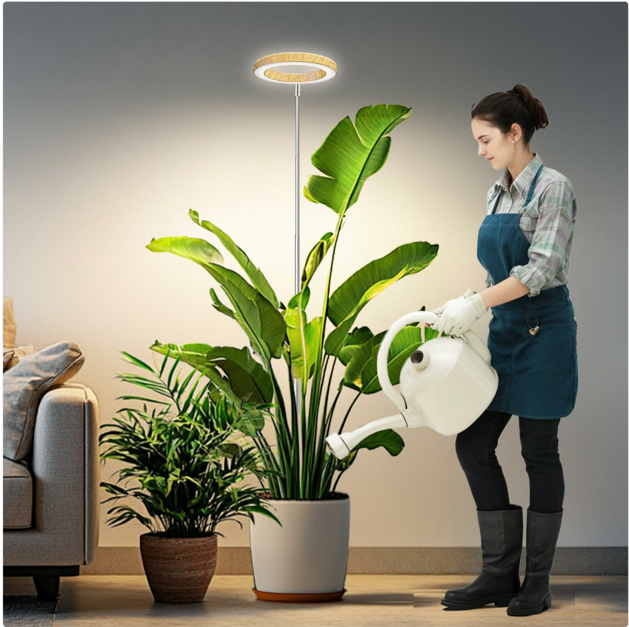
The Kullsinss Grow Light assembled and positioned in a plant pot, illustrating its adjustable height and elegant design.