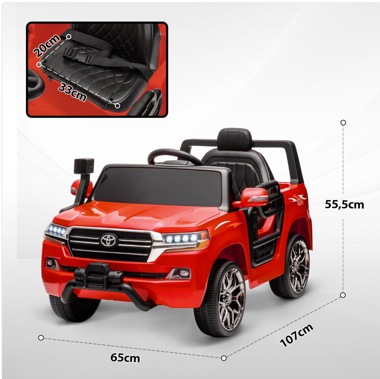
Image: Detailed dimensions of the AIYAPLAY Toyota Land Cruiser Electric Car.