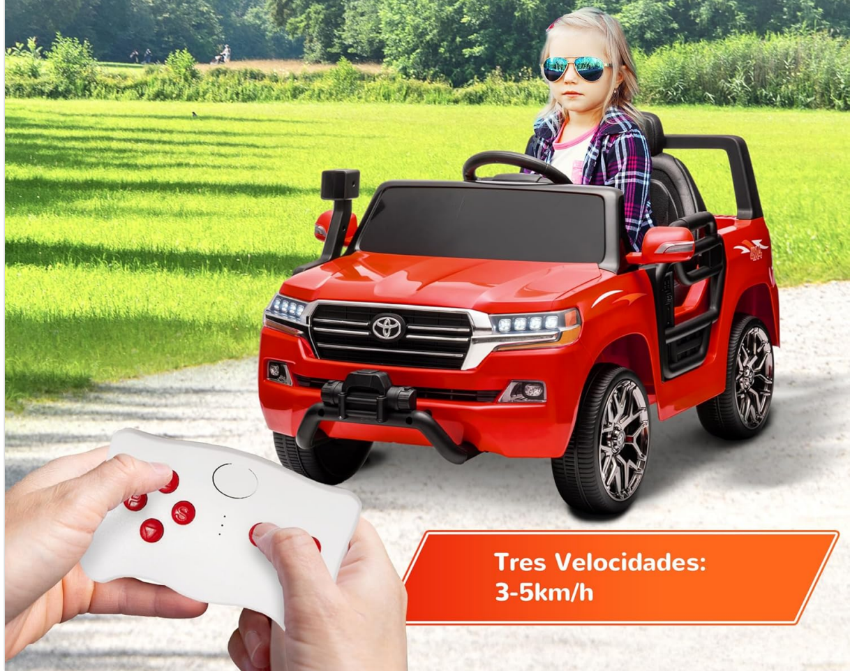
Image: Child driving the red electric car while an adult uses the remote control. The image highlights the dual control options and the three adjustable speeds (3-5 km/h).