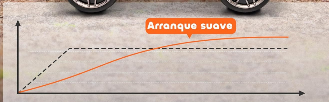
Image: Illustration of the car's smooth driving features, including spring suspension and soft start technology.