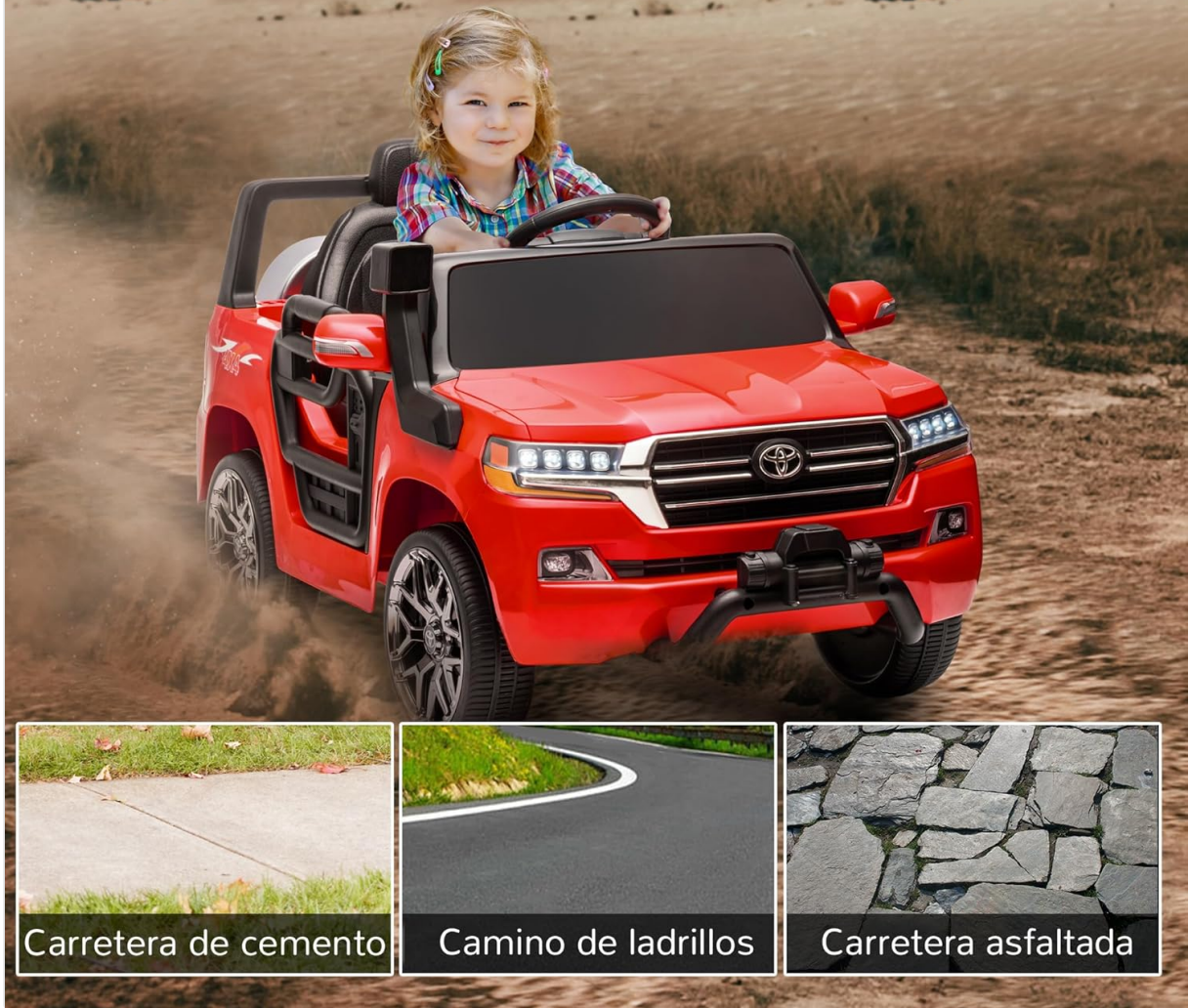
Image: The electric car is suitable for use on smooth surfaces such as cement, brick, and asphalt roads.