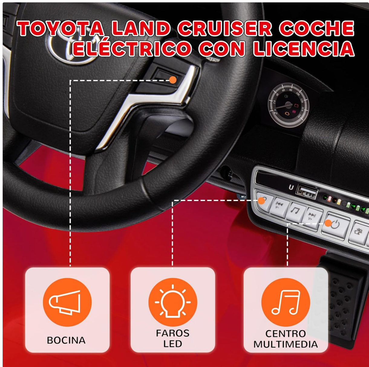
Image: Close-up of the car's dashboard, illustrating the horn, LED headlights, and multimedia center controls.