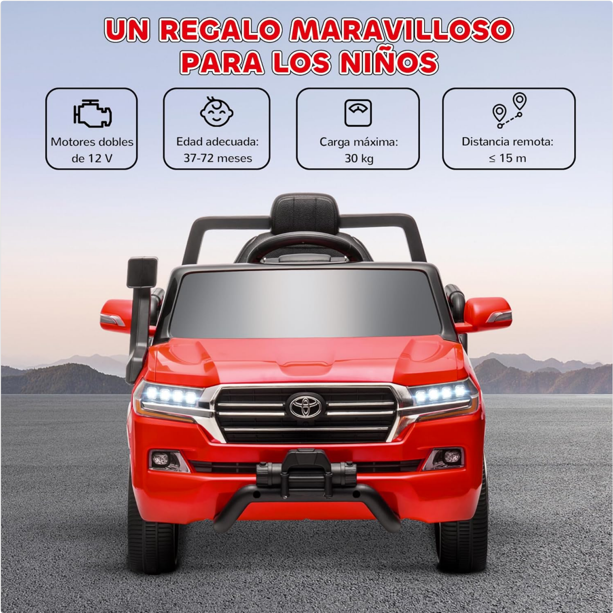
Image: Summary of key product specifications and features.