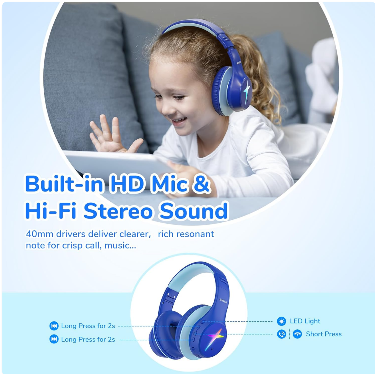
Image: A child wearing EarFun K4 headphones, with an accompanying diagram detailing the location and function of the control buttons for LED lights and audio playback/calls.