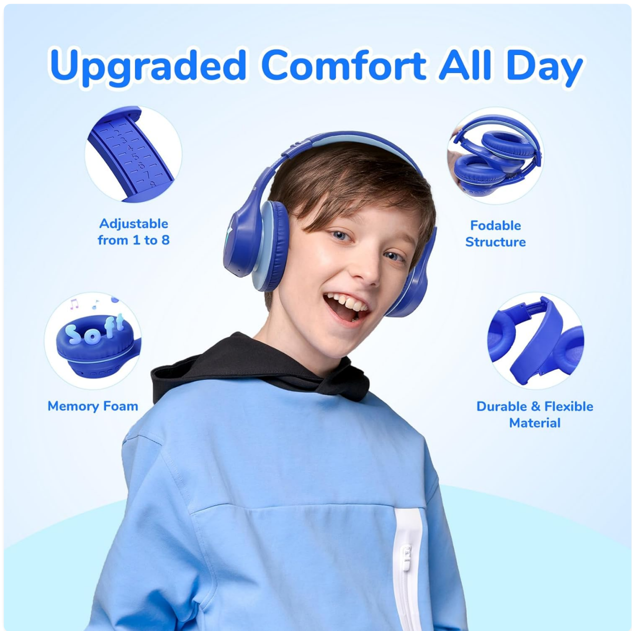
Image: A child wearing the EarFun K4 headphones, with callouts emphasizing the adjustable headband, foldable structure, soft memory foam earcups, and durable materials for all-day comfort.