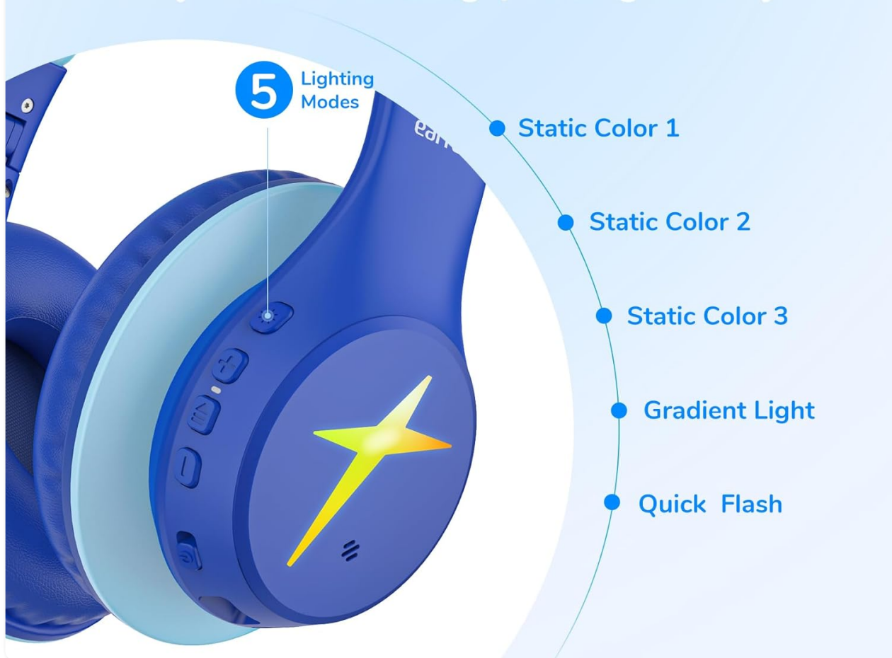
Image: A detailed view of the EarFun K4 headphone's ear cup, highlighting the LED light panel and listing the five available lighting modes.

Find your child faster in dim light, enhancing their safety.