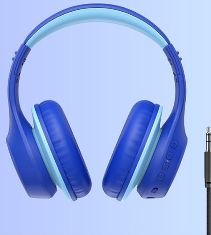
Image: Illustration of the EarFun K4 headphones' battery life, highlighting 90 hours of wireless use (with lights off) and unlimited playtime in wired mode.