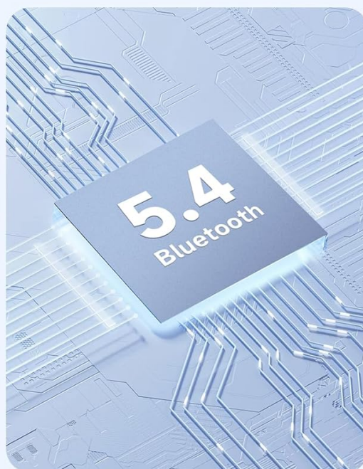
Image: The EarFun K4 headphones demonstrating universal compatibility with smartphones, tablets, laptops, PCs, gaming consoles, and other devices, powered by Bluetooth 5.4 technology.