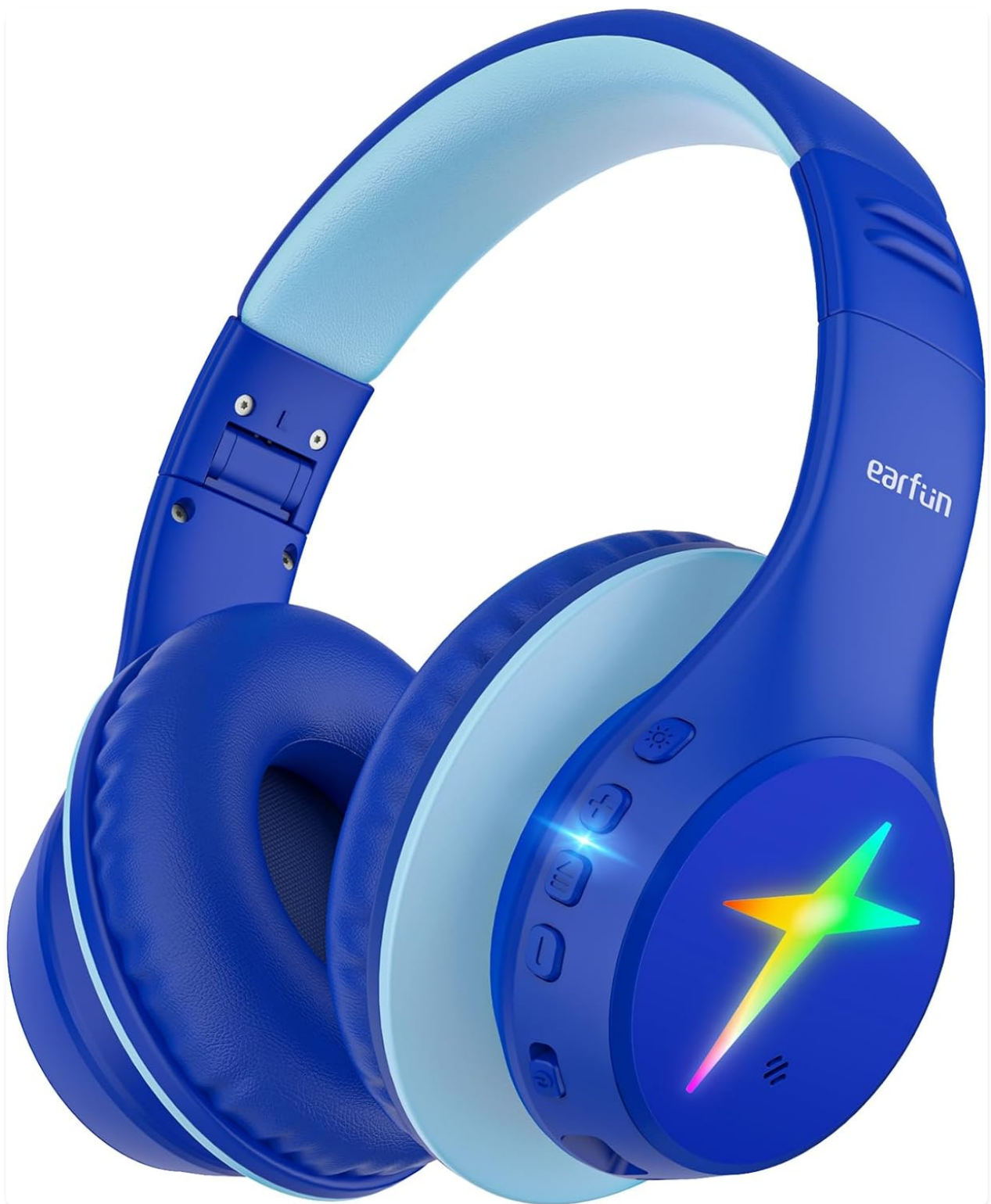
Image: The EarFun K4 Kids Bluetooth Headphones in blue, showcasing their over-ear design and LED light feature.