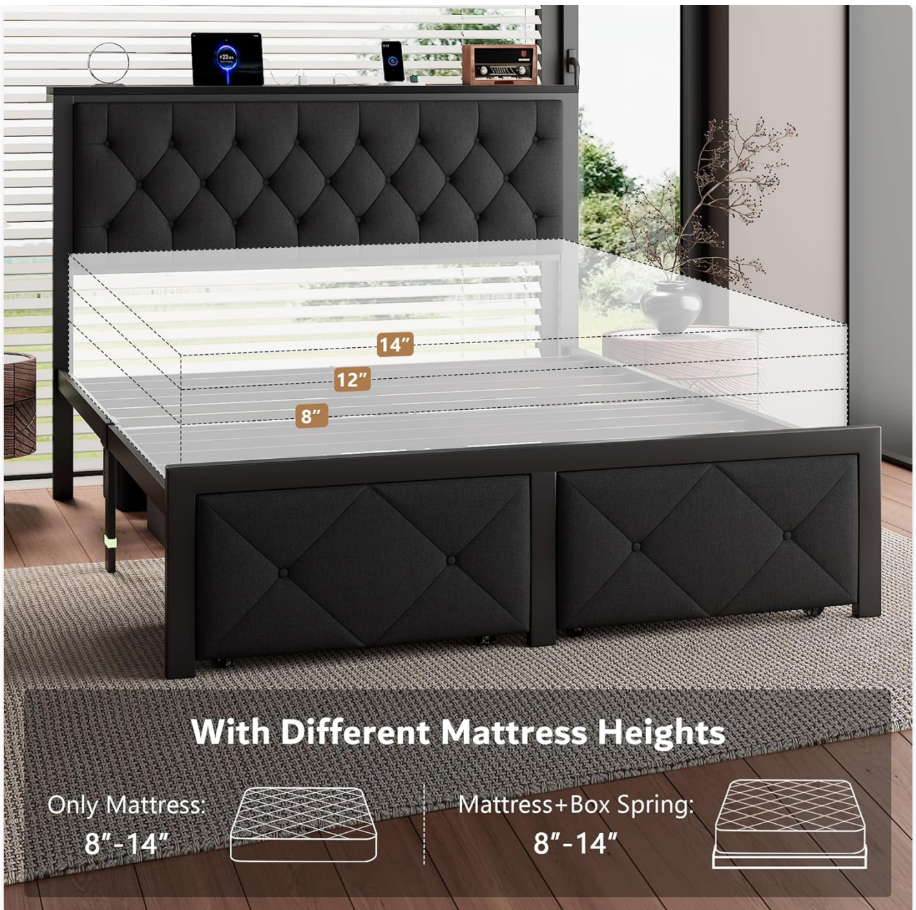
Image: Illustration showing compatibility with various mattress heights (8"-14") for the iPormis bed frame, with or without a box spring.