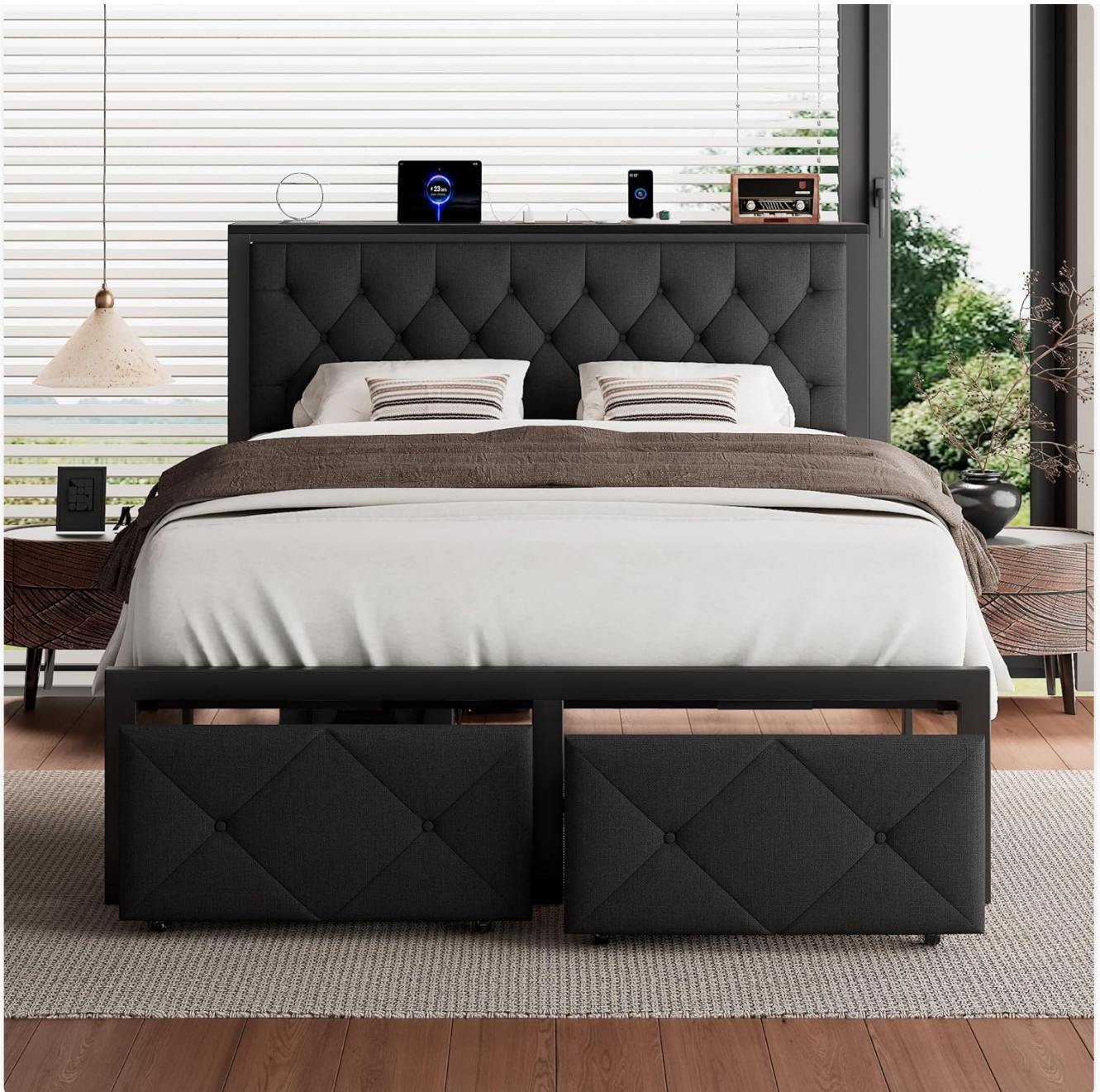
Image: The iPormis Full Bed Frame in black, featuring an upholstered headboard, integrated charging station, and two under-bed storage drawers.