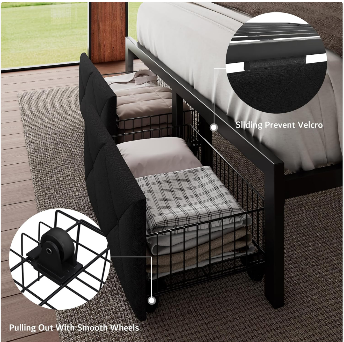
Image: A close-up of the under-bed storage drawers, illustrating their smooth wheels for easy pulling out and the sliding prevent Velcro for secure placement.