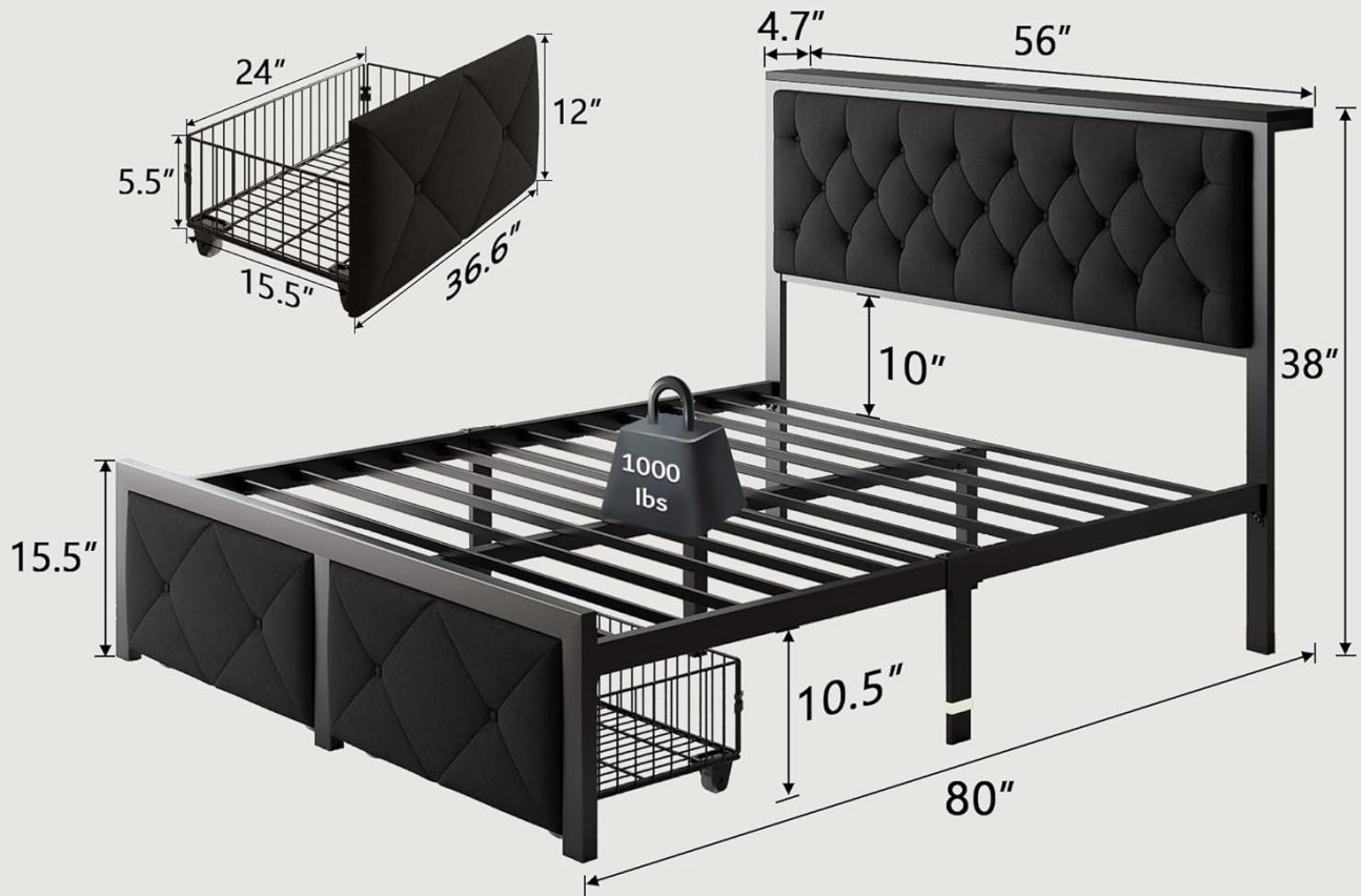
Image: Detailed dimensions of the iPormis Full Bed Frame, including overall length, width, height, and mattress area.