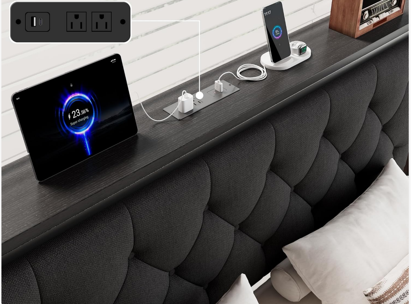
Image: A detailed view of the headboard's practical fast charging station, showing 2 AC outlets, 2 USB ports, and a 6.6-foot power cord.