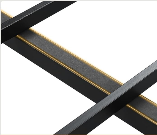
No Noise Rubber Stick