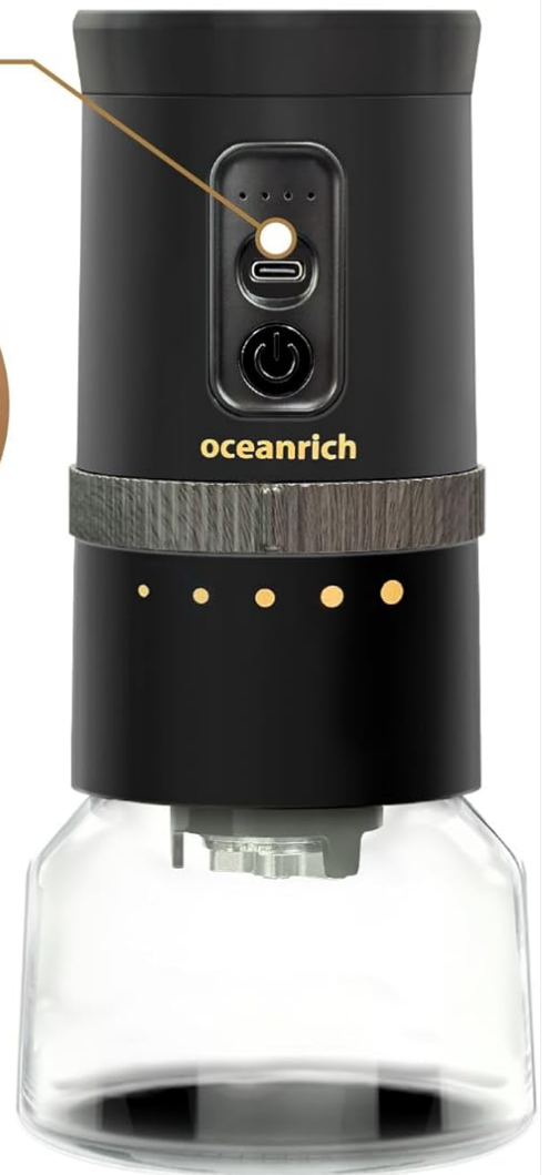
Figure 7: USB Type-C Charging

This image highlights the USB Type-C charging port on the device, indicating its modern and convenient charging method.