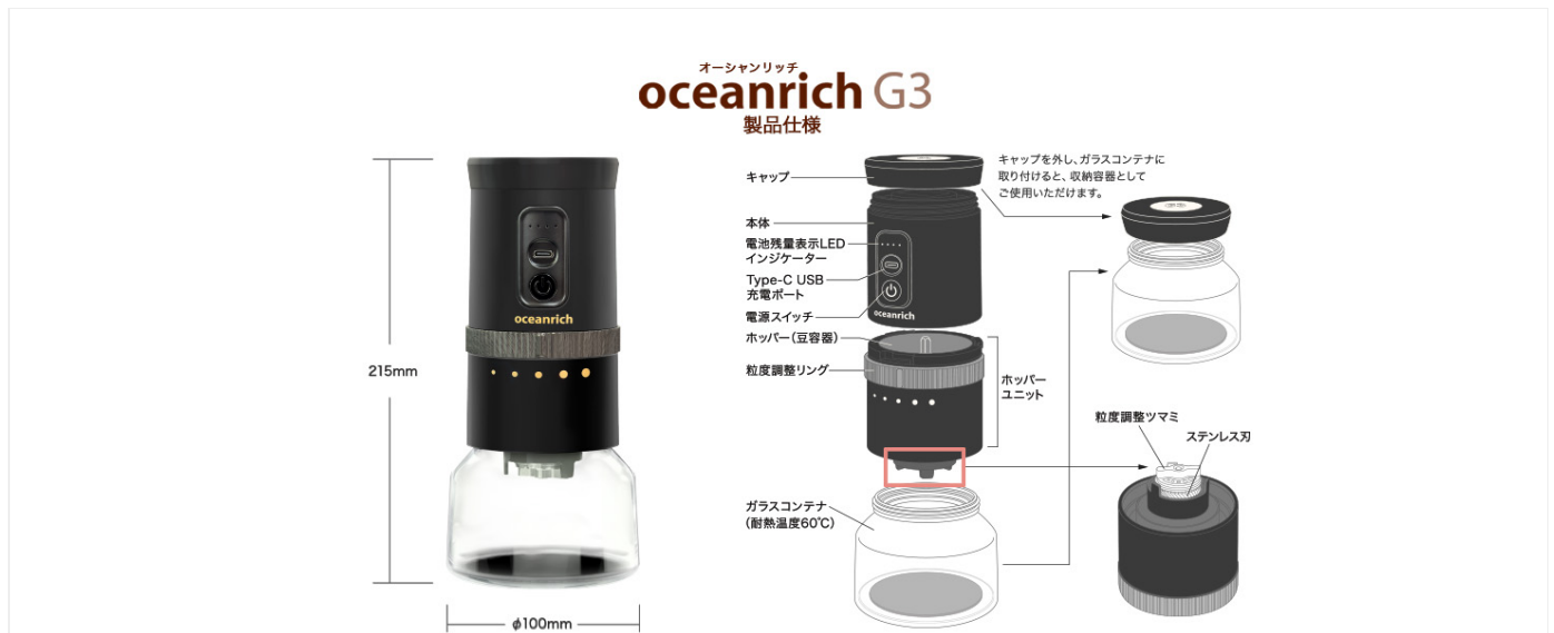
Figure 1: Product Components Diagram

This diagram illustrates the various parts of the oceanrich G3 coffee mill, including the main body, cap, battery indicator LEDs, USB Type-C charging port, hopper unit, grind adjustment ring, stainless steel burr, and glass container. The cap can be removed and used as a lid for the glass container for storage.