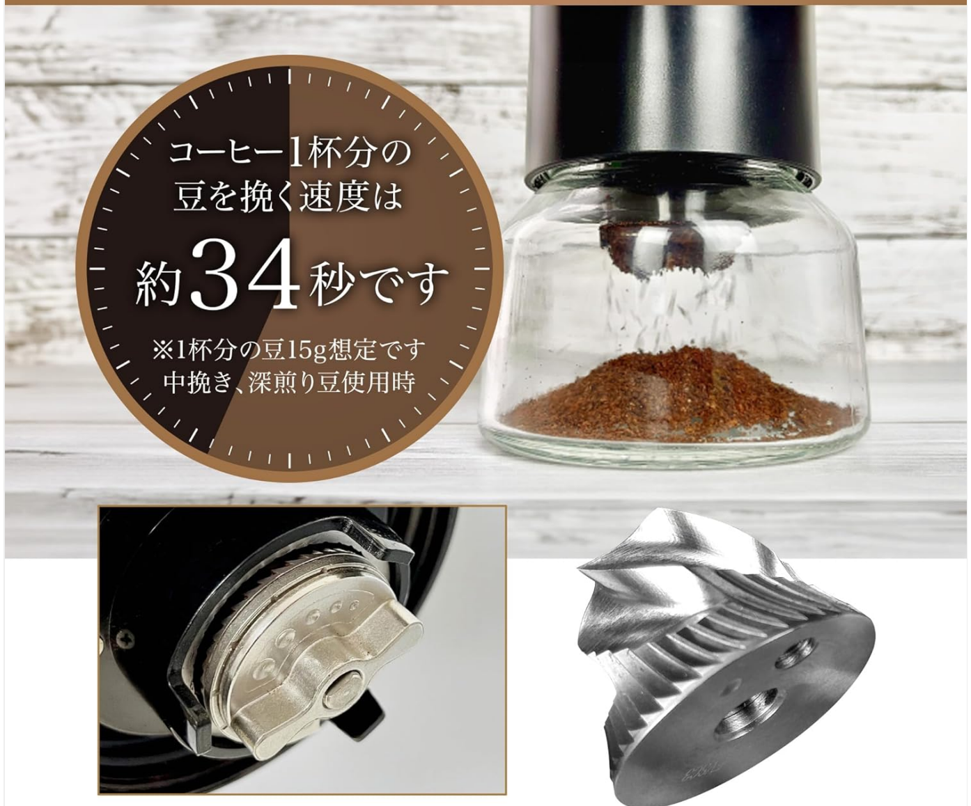
Figure 3: Grinding Speed

This image highlights the grinder's efficiency, capable of grinding 15g of coffee beans in approximately 34 seconds.