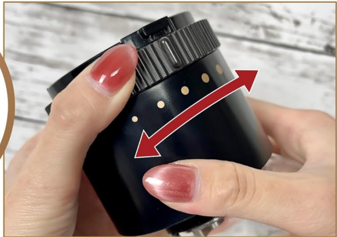
Figure 4: Grind Size Adjustment

This image displays the range of 5 grind settings, from very fine (suitable for espresso) to coarse (ideal for French press), and how to adjust the dial.