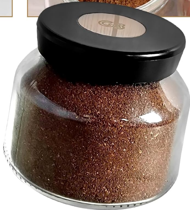
Figure 9: Glass Container as Storage

本体上部のキャップを取り外し、ガラスコンテナのフタとして使用すると、コーヒー粉の保存や持ち運びに便利です。