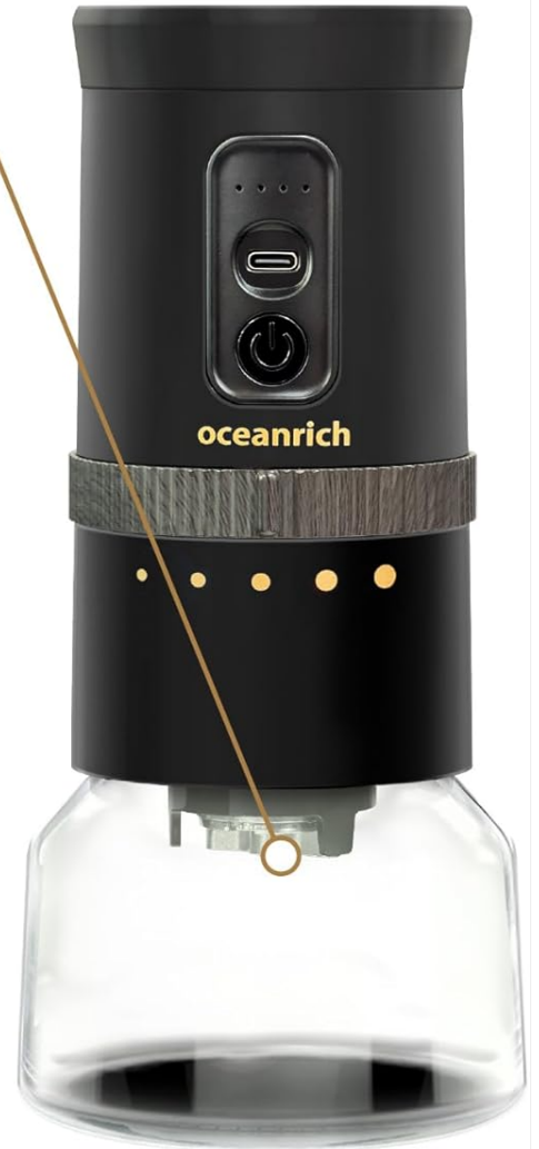
Figure 2: Stainless Steel Conical Burr

A detailed view of the durable stainless steel conical burr, designed for precise and uniform grinding.