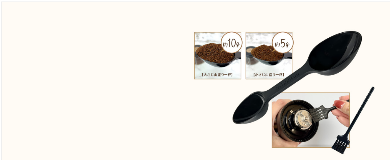
Figure 8: Included Accessories

This image shows the measuring spoon and cleaning brush that come with the coffee mill, useful for precise measurement and maintenance.