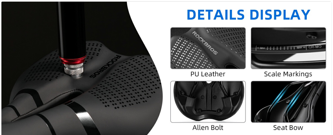
Image: A detailed view of the bike seat's surface, highlighting the PU leather material and high-density foam for comfort.