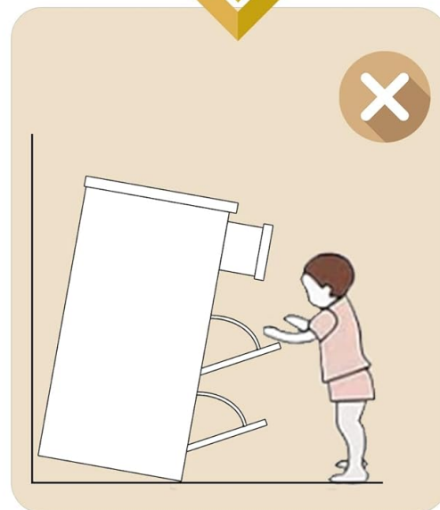
Figure 2.1: Anti-tipping kit installation to prevent accidents.

The anti-tipping kit is an essential safety component. Install it as directed in the assembly instructions to anchor the cabinet securely to the wall.