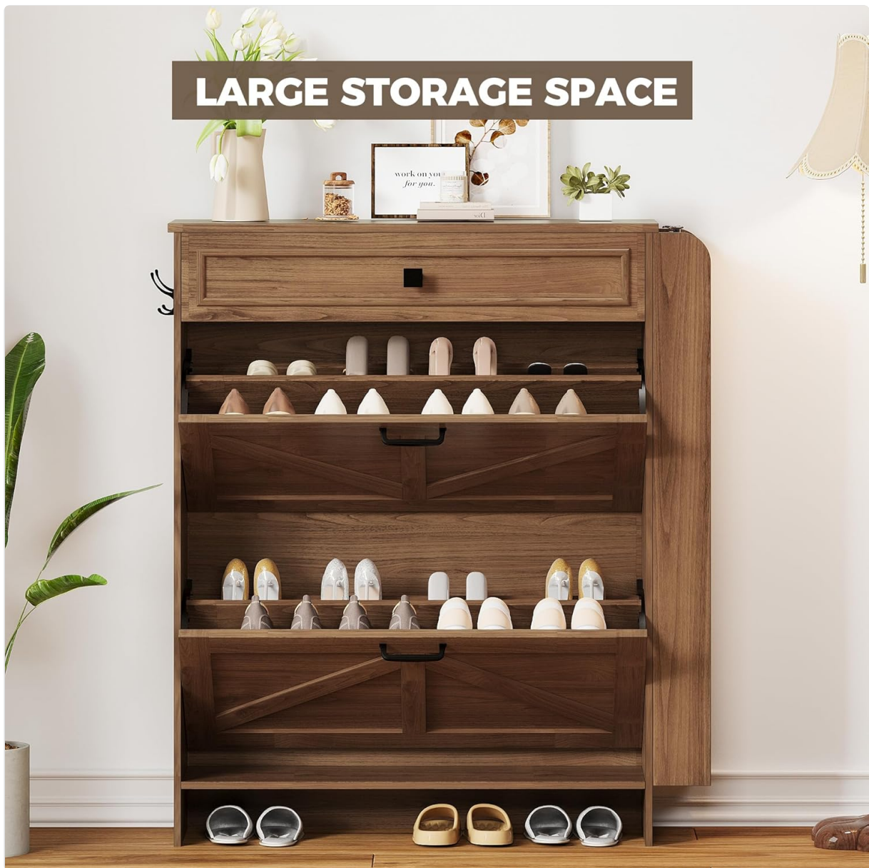
Figure 4.2: The large capacity of the shoe cabinet with shoes organized in the flip drawers.