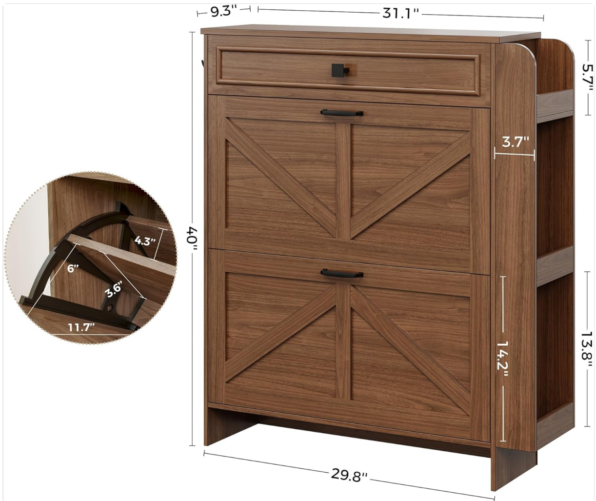
Figure 7.1: Detailed dimensions of the shoe storage cabinet.