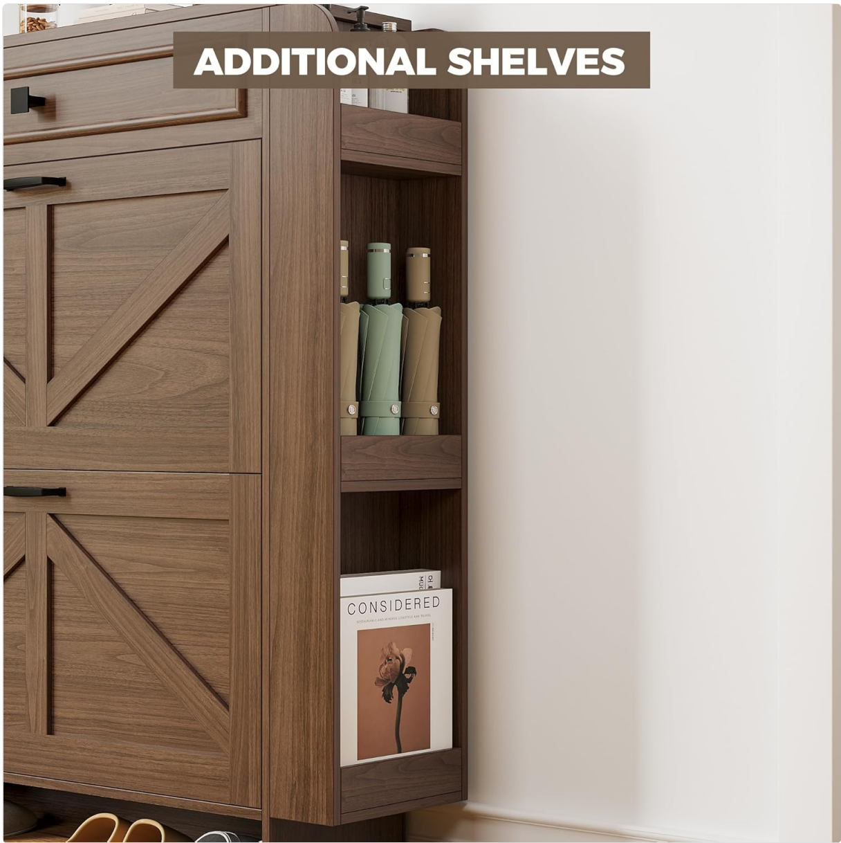
Figure 4.3: Additional side shelves for convenient storage of various items.