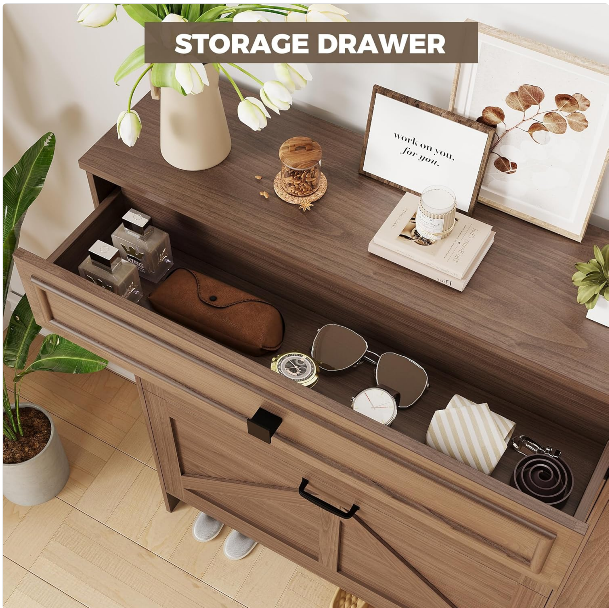
Figure 4.4: The top storage drawer for small items.