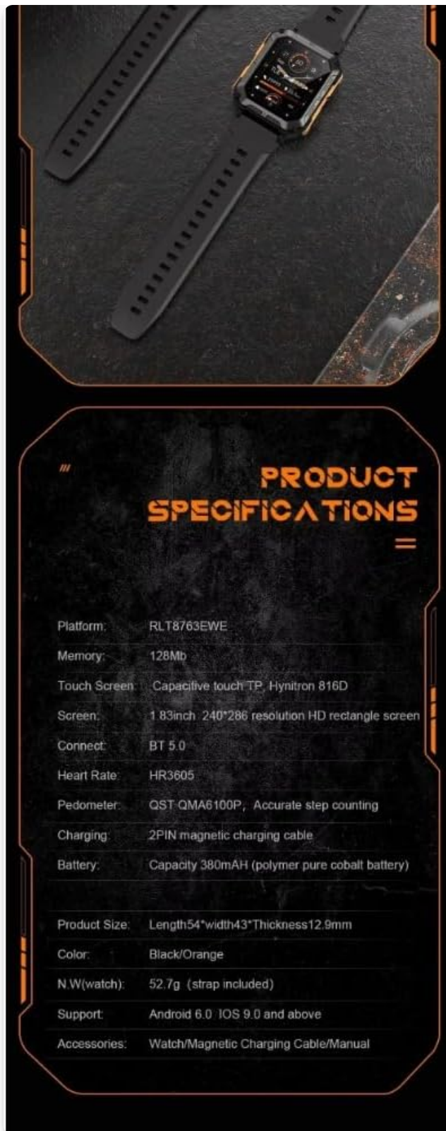
Image 6: The watch screen showing health data such as heart rate and blood oxygen, emphasizing the 1.83-inch high-definition display.