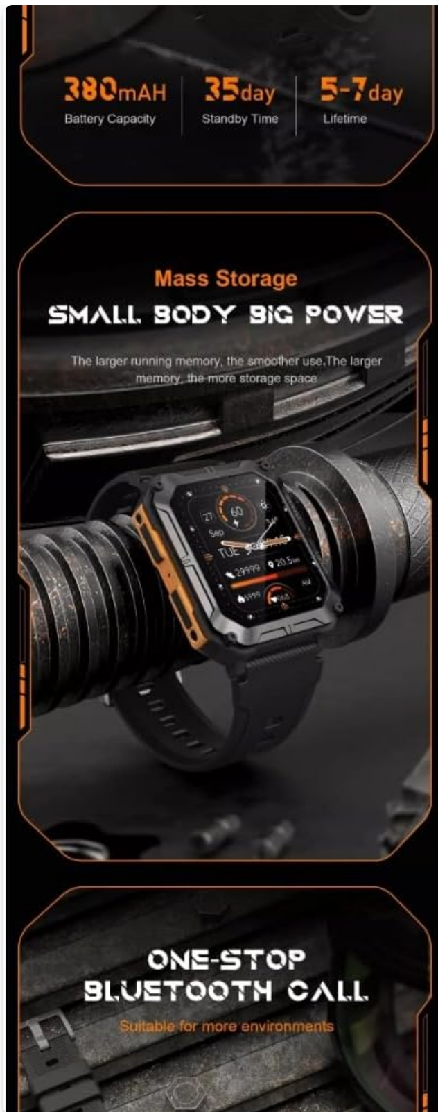
Image 8: Visual representation of the watch's battery specifications, including 380mAh capacity, 35-day standby time, and 5-7 day typical lifetime.