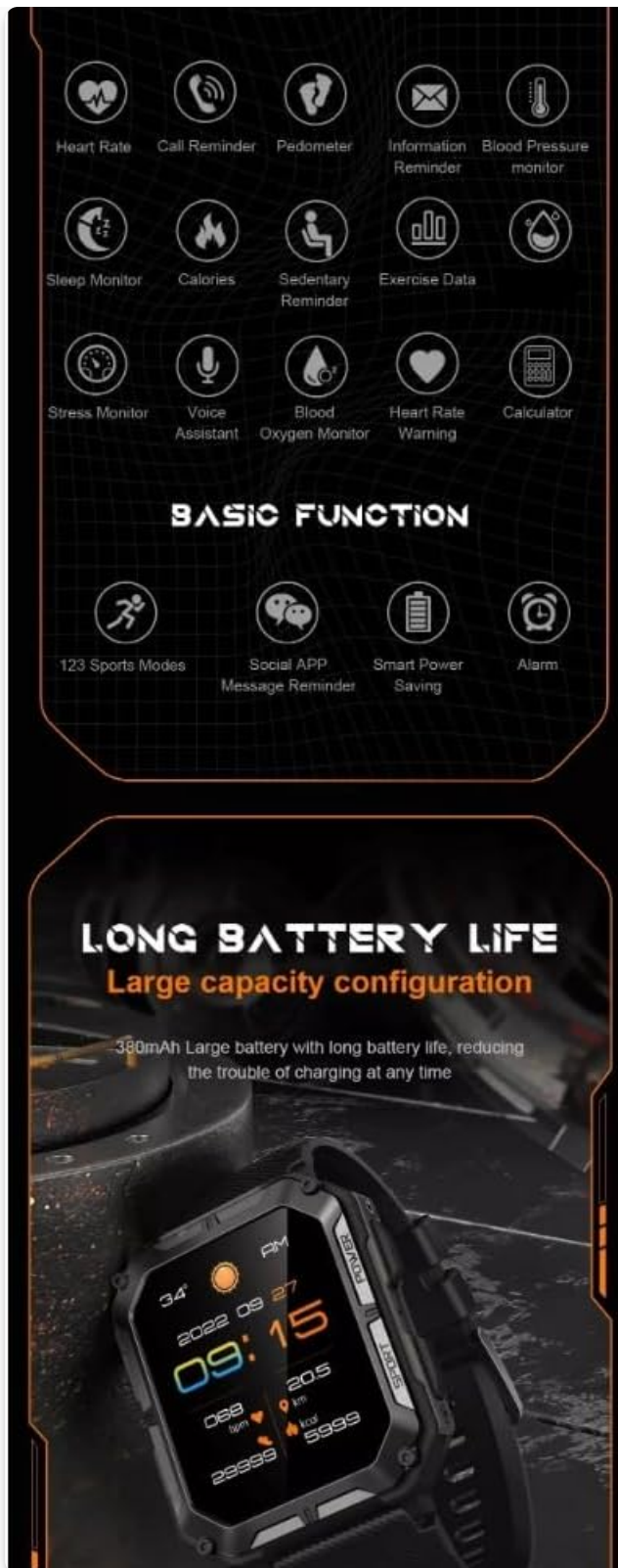
Image 5: An overview of the watch's basic functions including heart rate, call reminder, pedometer, and information reminder, alongside battery life indicators.