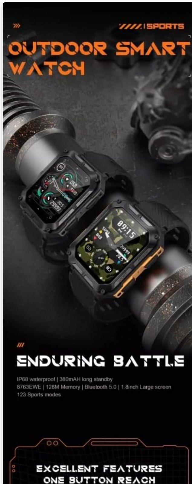
Image 2: Two Ethelred C20 PRO Smart Watches displayed in an outdoor environment, highlighting their durable design.