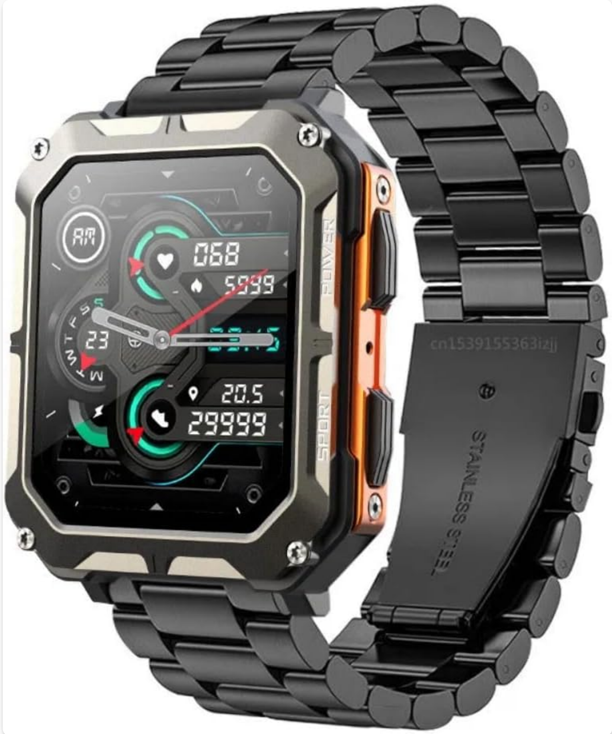
Image 1: The Ethelred C20 PRO Smart Watch featuring a black steel band and a vibrant display showing health metrics.