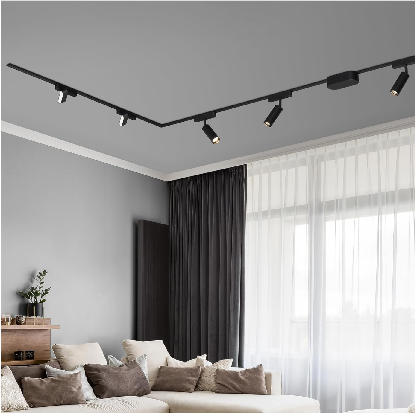
Image: An L-shaped BRILONER Luxtrail track lighting system mounted on a ceiling, showcasing its application in a modern living room setting.

Determine the desired layout for your track lighting system. The 3-meter rail arrangement and angle connector allow for versatile designs, including L-shaped installations around corners. Ensure the chosen location provides adequate support and access to power.