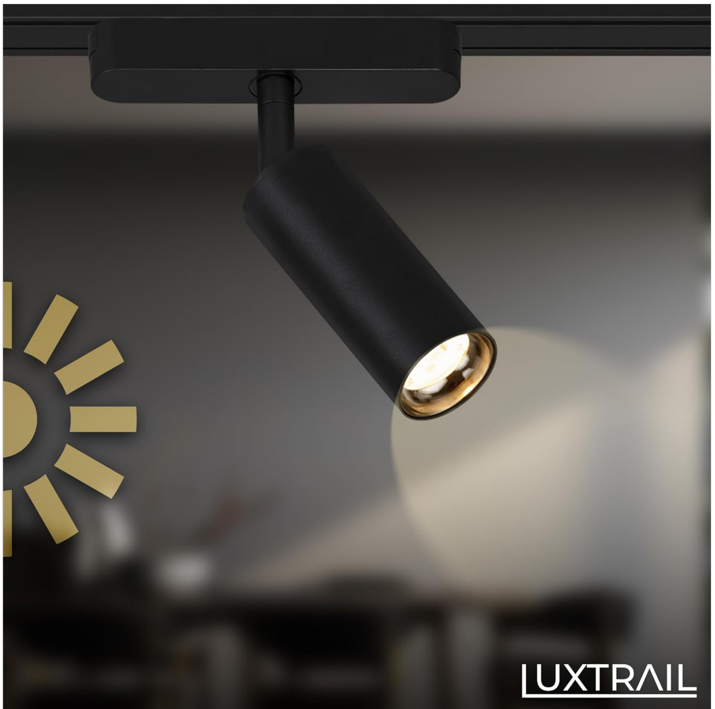
Image: A graphic representation of the dimming feature for BRILONER Luxtrail lights, depicted with a slider to adjust light intensity.