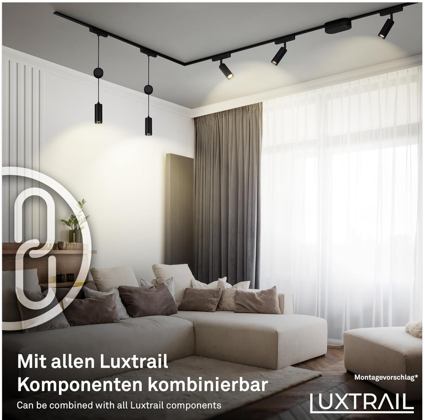
Image: A complete BRILONER Luxtrail system showcasing a combination of tracklights and pendant lights, highlighting the system's modularity and design flexibility.