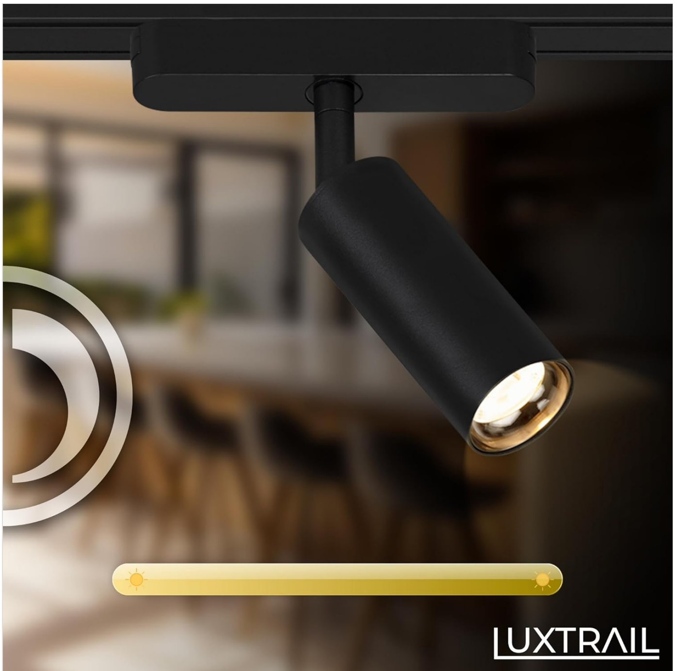
Image: A detailed view of a BRILONER Luxtrail tracklight, illustrating its rotational capability for precise light direction.