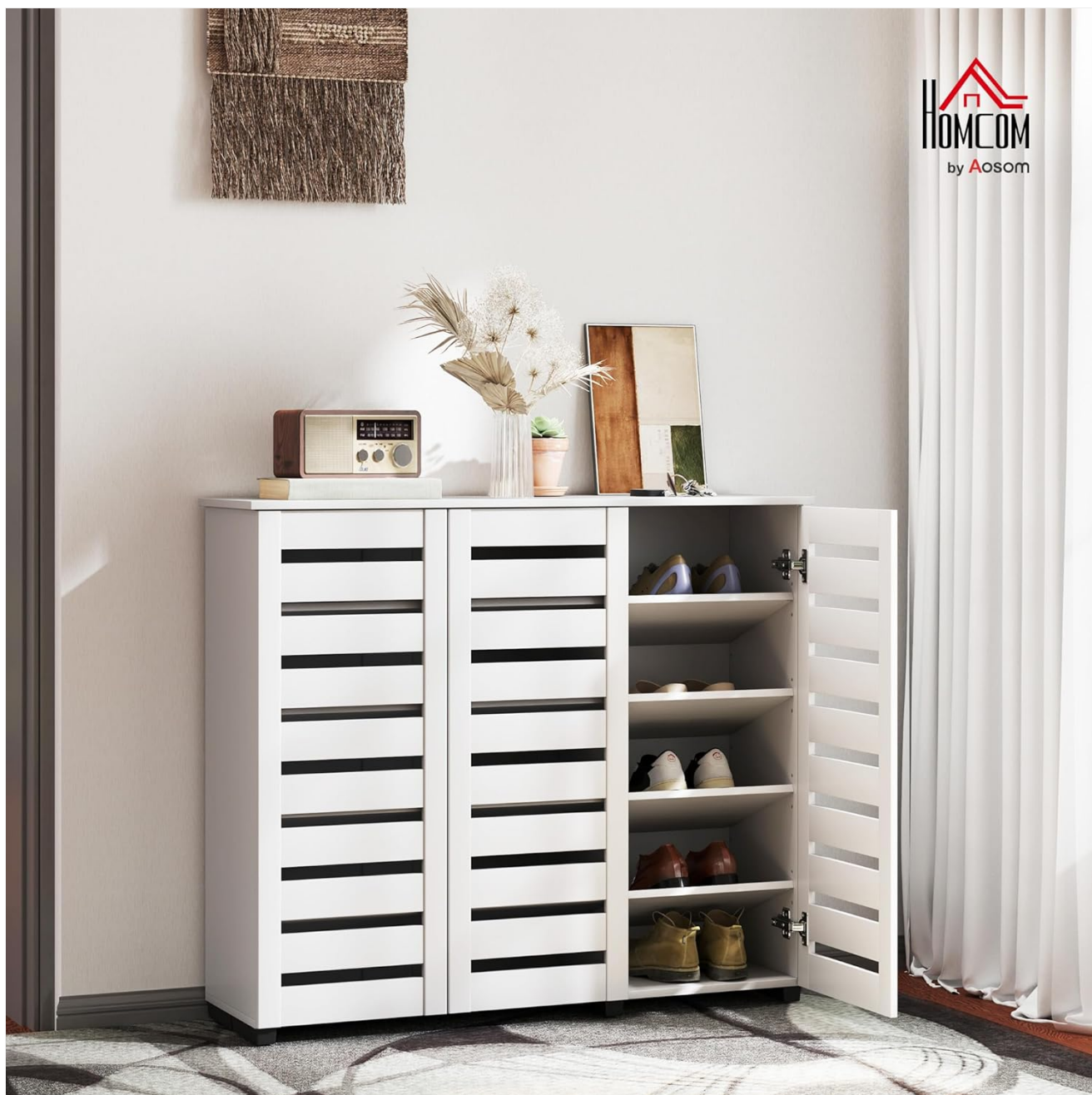
The HOMCOM Narrow Shoe Cabinet, featuring three slatted doors and a white finish, designed for efficient shoe storage in entryways or hallways.