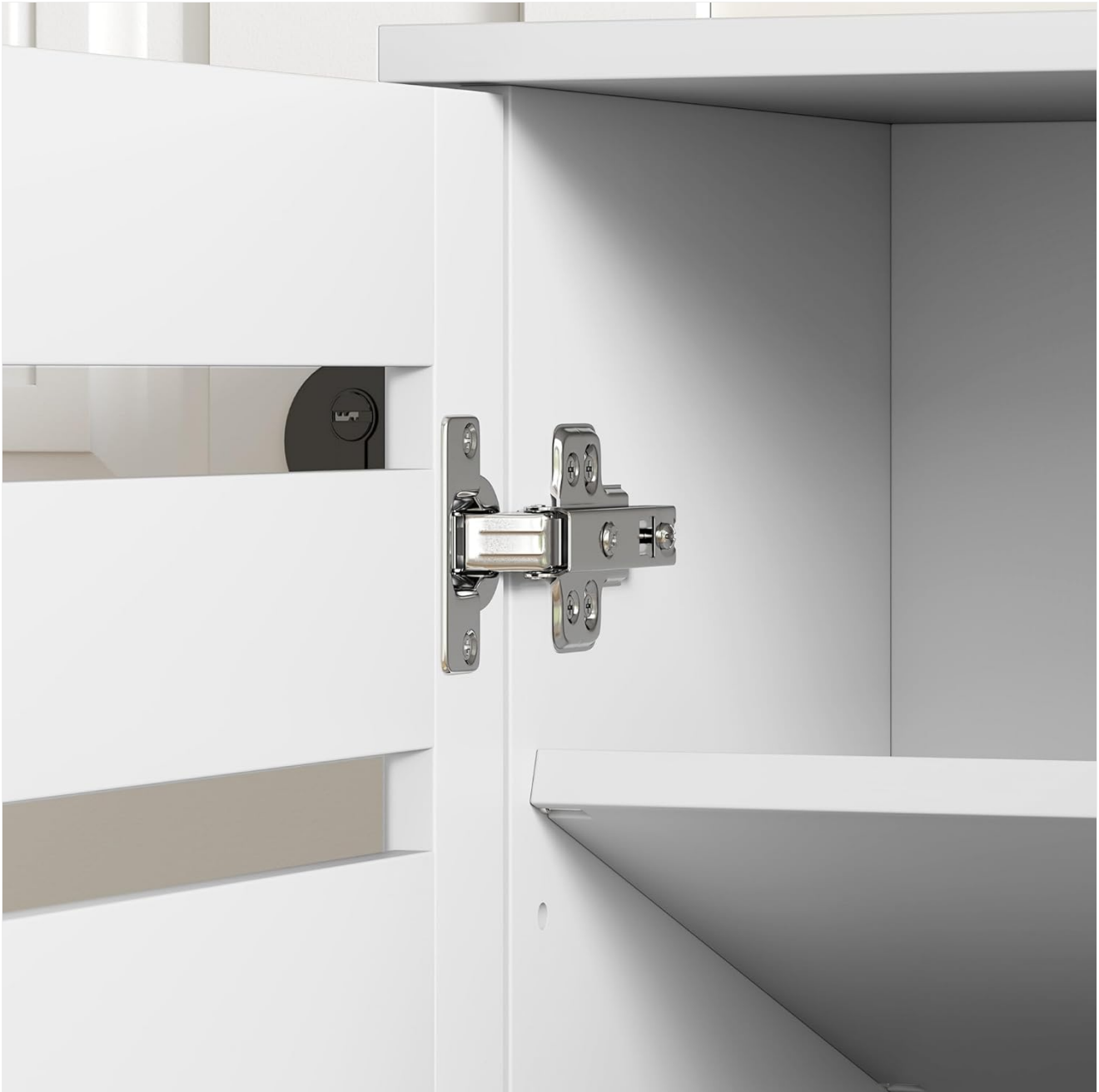
Detail of the door hinge, which can be adjusted for proper door alignment.