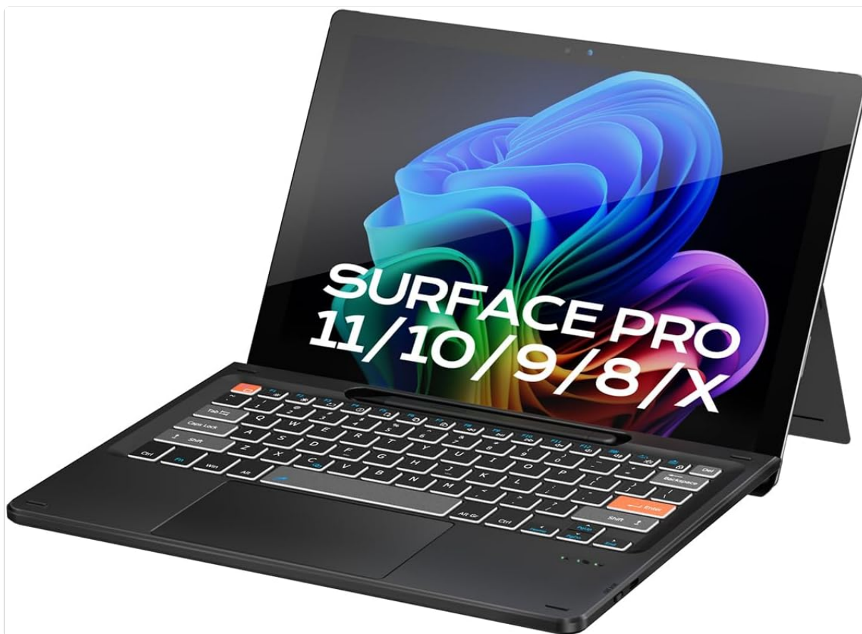
Image: The Doohoeek Bluetooth Keyboard shown attached to a Surface Pro tablet, illustrating its integrated design.

This manual provides detailed instructions for the setup, operation, maintenance, and troubleshooting of your Doohoeek Bluetooth Keyboard for Surface Pro 13-inch devices. Please read this manual thoroughly before using the product to ensure proper functionality and longevity.