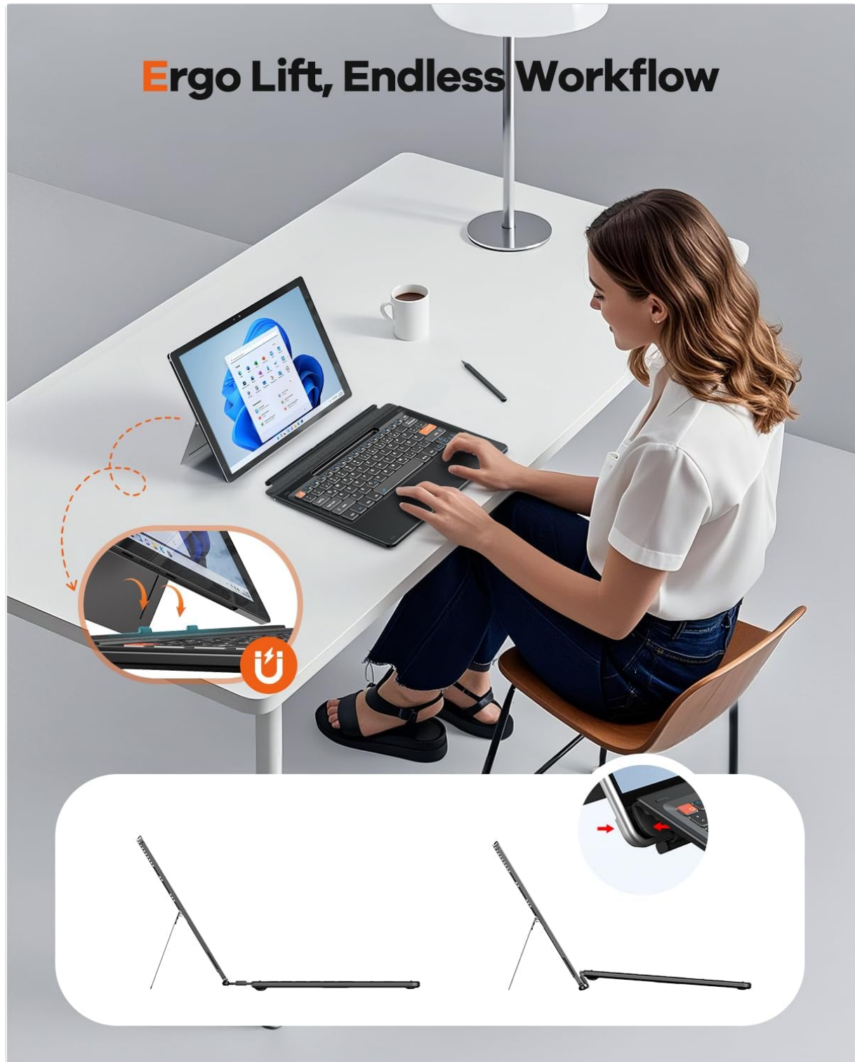
Image: Illustrates how the keyboard can be angled for an ergonomic typing position.

The keyboard can be slightly angled for a more comfortable typing experience. Gently lift the top edge of the keyboard towards the Surface Pro screen until it magnetically secures into an elevated position.