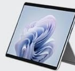
Image: A visual representation confirming the keyboard's compatibility with Surface Pro 11, 10, 9, 8, and X 13-inch models.