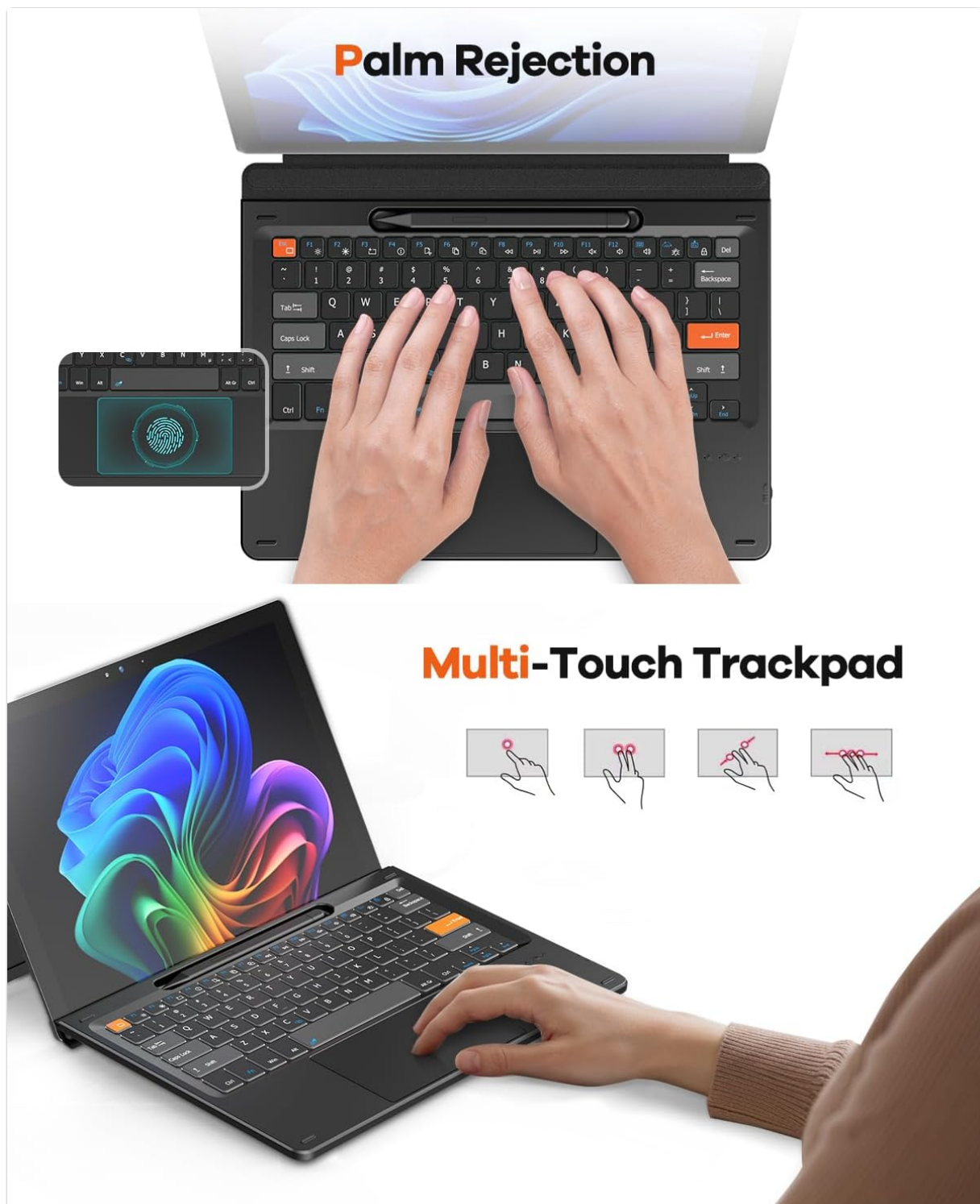
Image: Demonstrates various multi-touch gestures for the trackpad and highlights the palm rejection feature during typing.