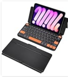
Image: A close-up view demonstrating the magnetic connection between the keyboard and the Surface Pro tablet.