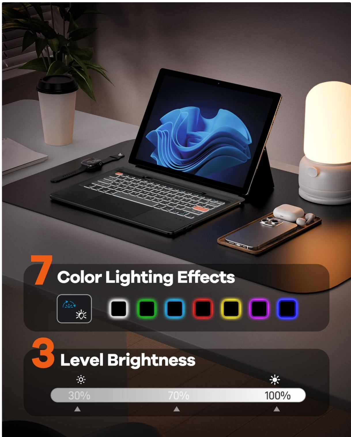
Image: Shows the keyboard's backlit keys with various color options and adjustable brightness settings.