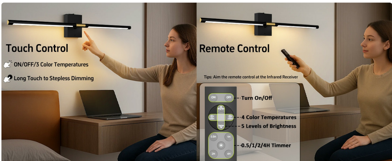
Figure 5.2: Touch control and remote control overview.

This image highlights both the touch control functionality on the sconce itself and the comprehensive remote control options, providing flexible ways to manage your lighting.