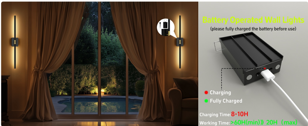
Figure 6.1: Detachable battery box charging process.

Charging time is approximately 8-10 hours. A full charge provides 20-60 hours of working time, depending on the brightness level used.