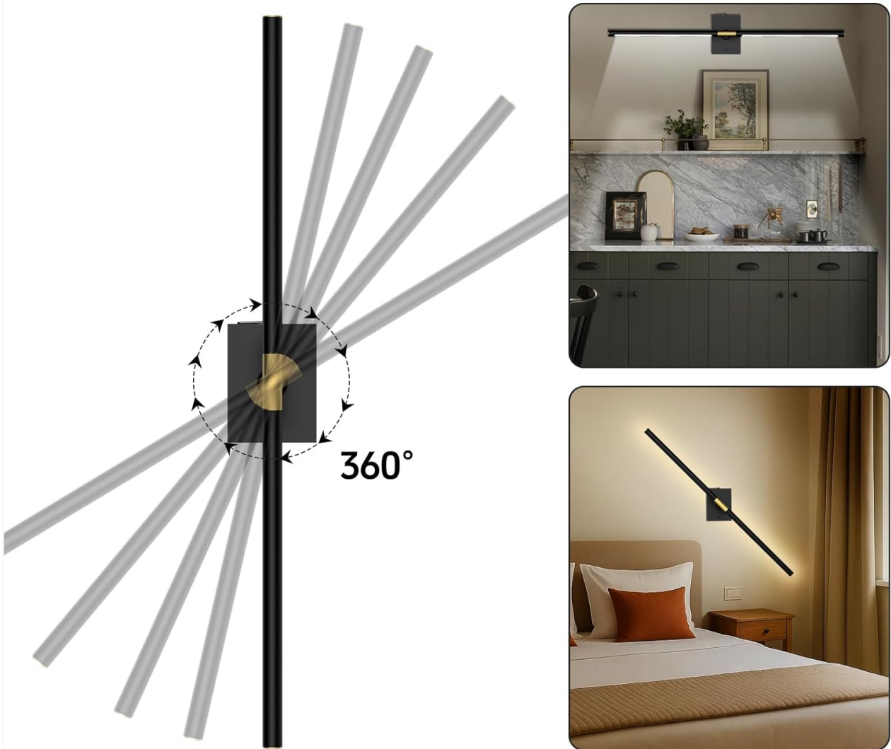
Figure 3.1: The light bar can rotate 360 degrees for customizable illumination.

360° flexible rotation to adjust your desired light angle