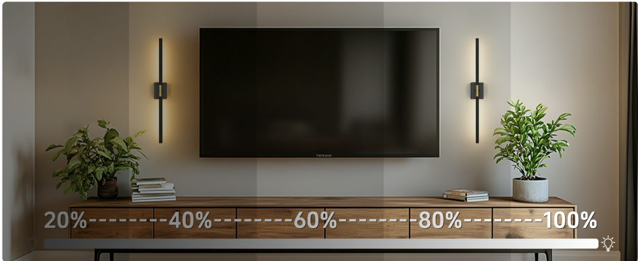
Figure 5.1: Remote control functions and brightness levels.

This image details the various functions available on the remote control, including power, brightness, color temperature, and timer settings, along with a visual representation of the brightness adjustment range.