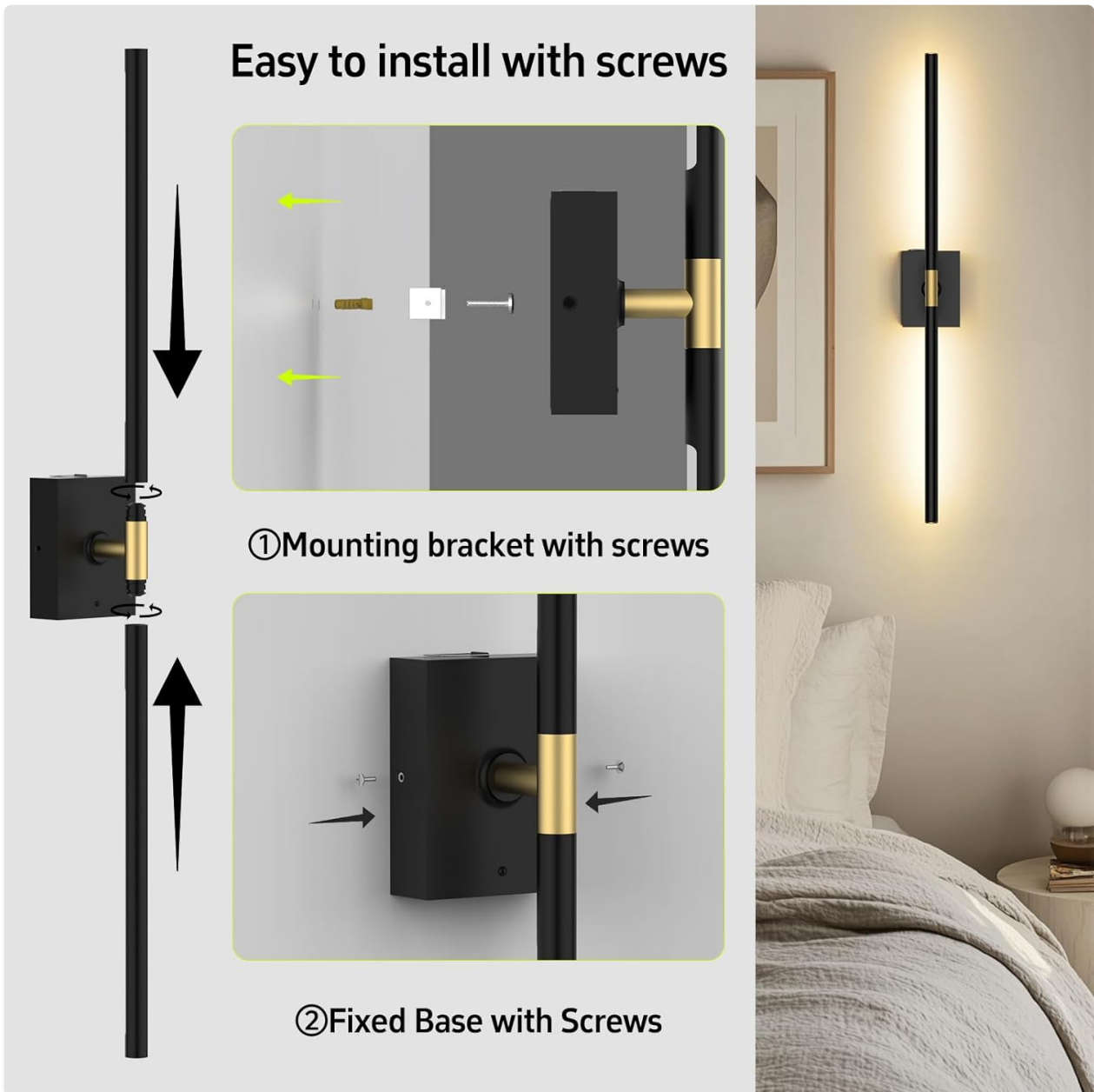
Figure 4.1: Step-by-step guide for screw installation.

This diagram illustrates the two main steps for securely mounting your wall sconce using the provided screws and bracket.